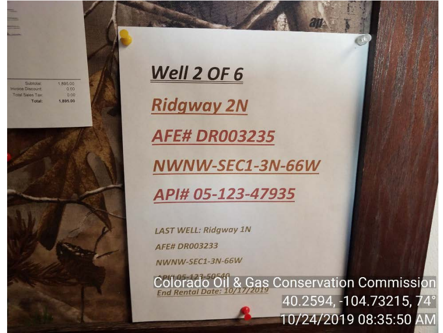
Current well posting