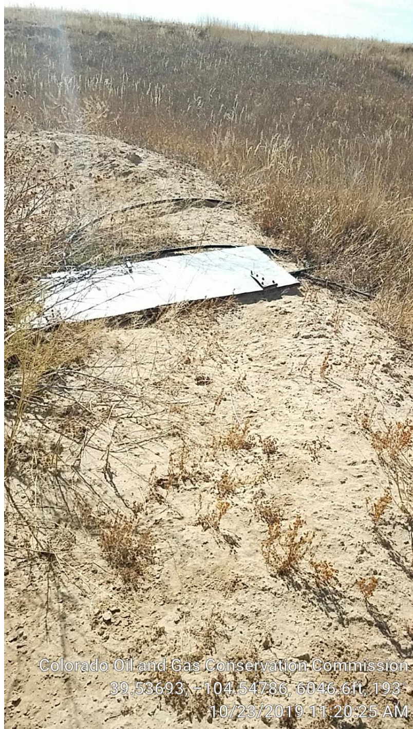
Door of treater shed.