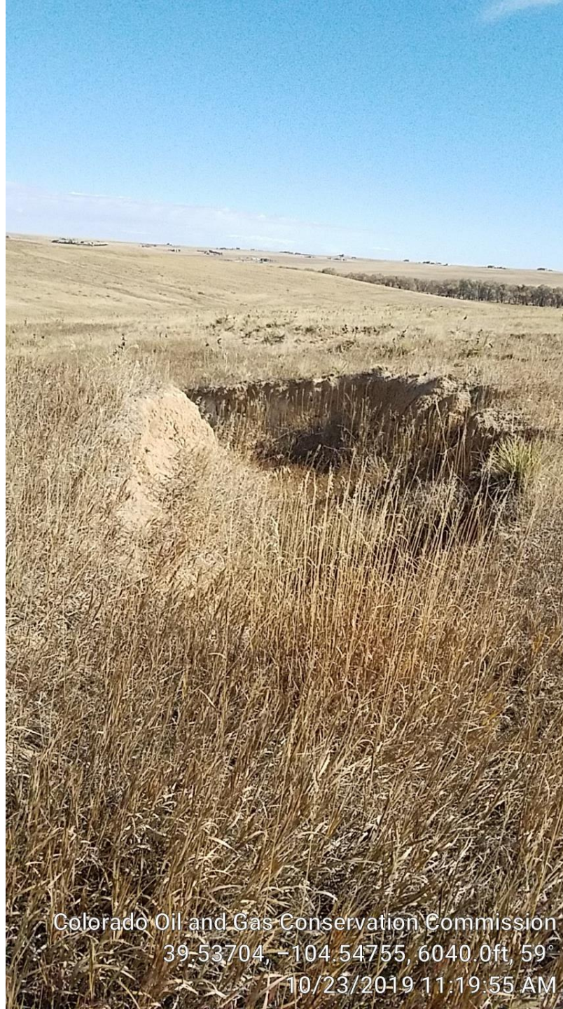
Erosion at NE deadman.