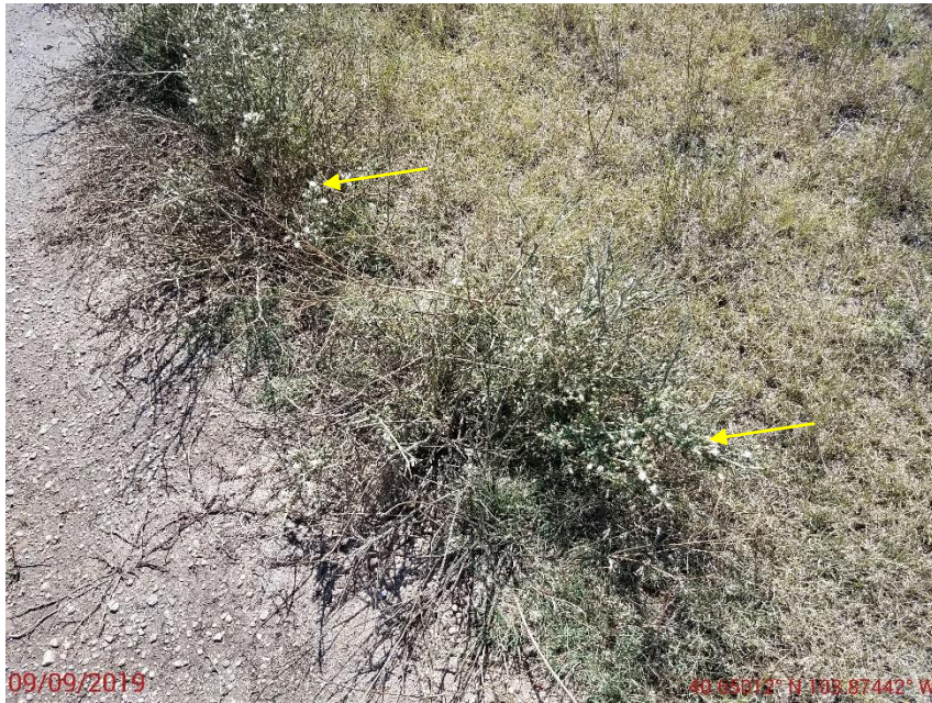
Photo 3: Photo shows noxious weeds (Diffuse Knapweed) remaining on location.