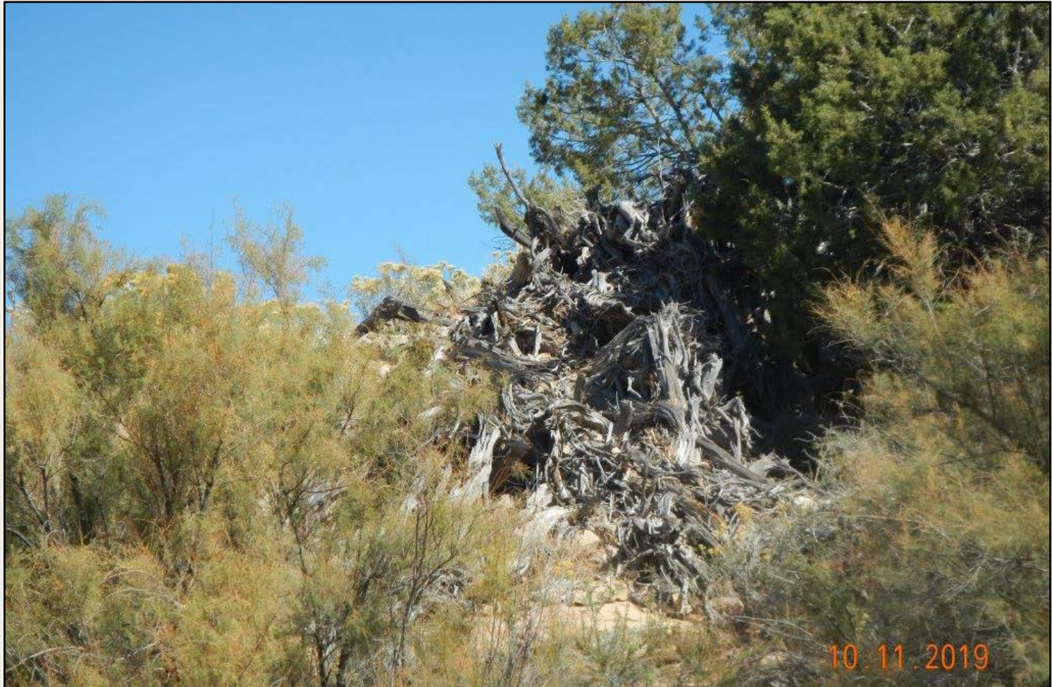
Photo 3. View of wood debris and salt cedar weeds within the eastern project area.