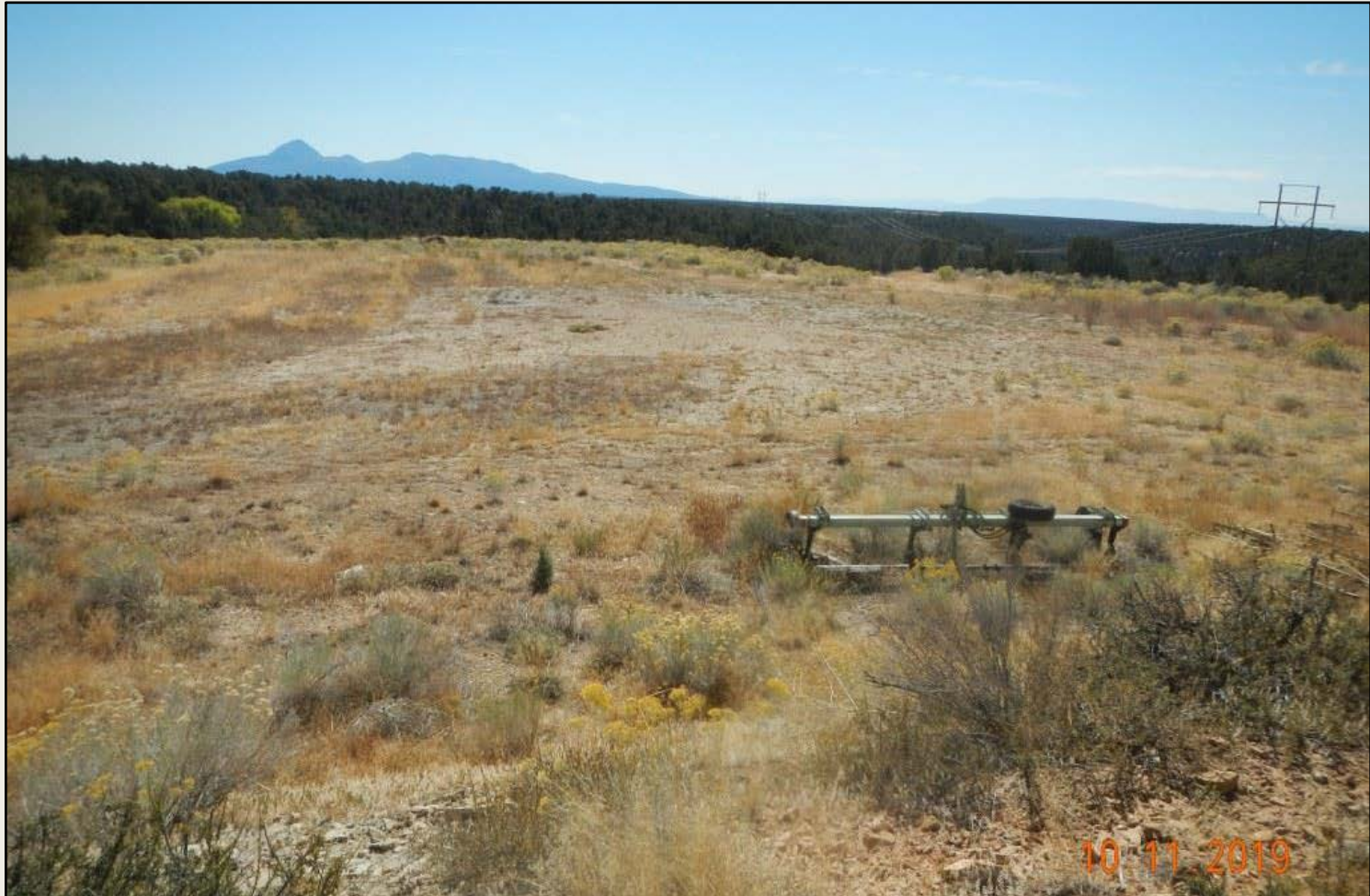
Photo 1. View of the project area from the northern edge facing center. Well pad is not reclaimed.