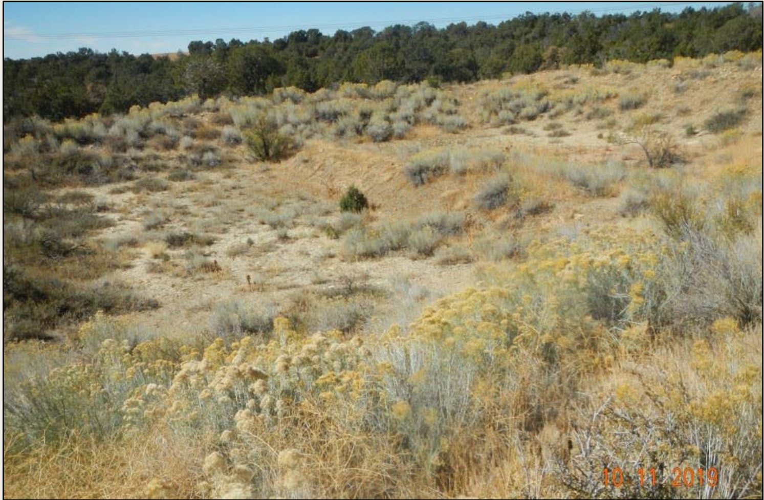
Photo 2. View of pits constructed and needing reclamation.