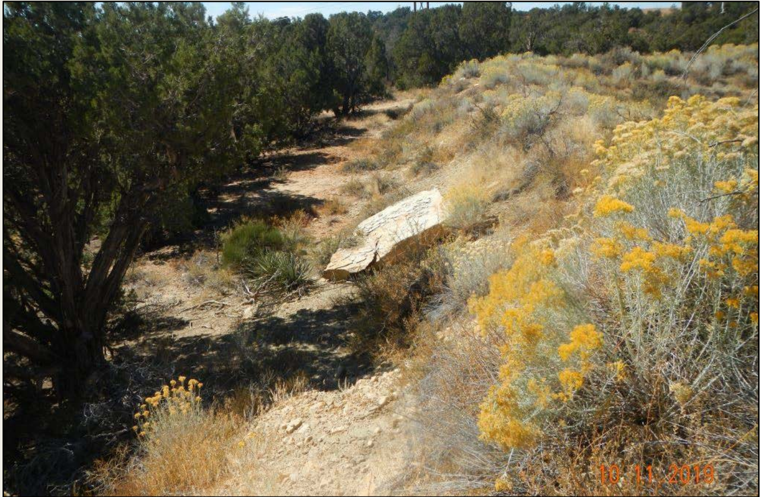
Photo 5. View of the southern fill slope from the southeastern edge facing westward.