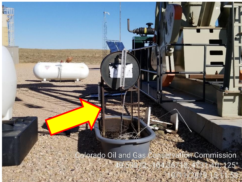
Photo 5 – Unused Chemical drum and containment on the North side of the South Pumping Unit