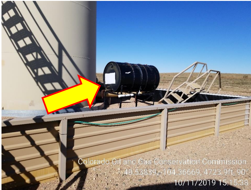
Photo 7 – Unused Chemical drum and containment on the South side of the Tank Berm