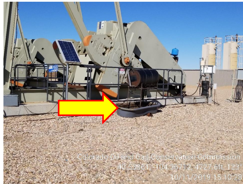
Photo 4 – Unused Chemical drum and containment on the South side of the South Pumping Unit