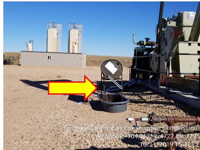
Photo 6 – Unused Chemical drum and containment on the North side of the North Pumping Unit