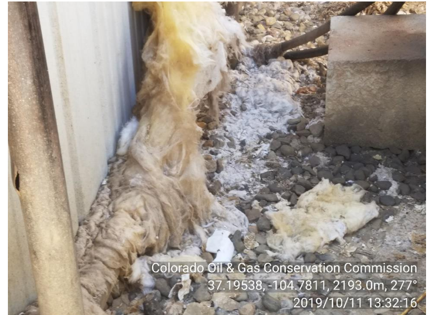
PHOTO 4: TRASH, THE INSULATION ON SOUND WALL IS DETERIORATING AND PREADING ON LOCATION INSIDE SOUDWALL AND OUT. COMPLY WITH 603.f. CA DATE 10-18-19