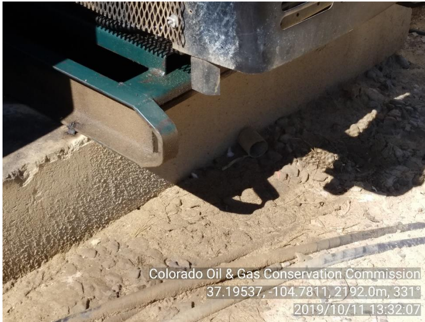
PHOTO 3: SEVERAL AREAS OF IMPACTED SOIL AROUND ENGINE SKID. Properly treat or dispose of oily waste in accordance with 907.e. CA DATE 11-11-19.