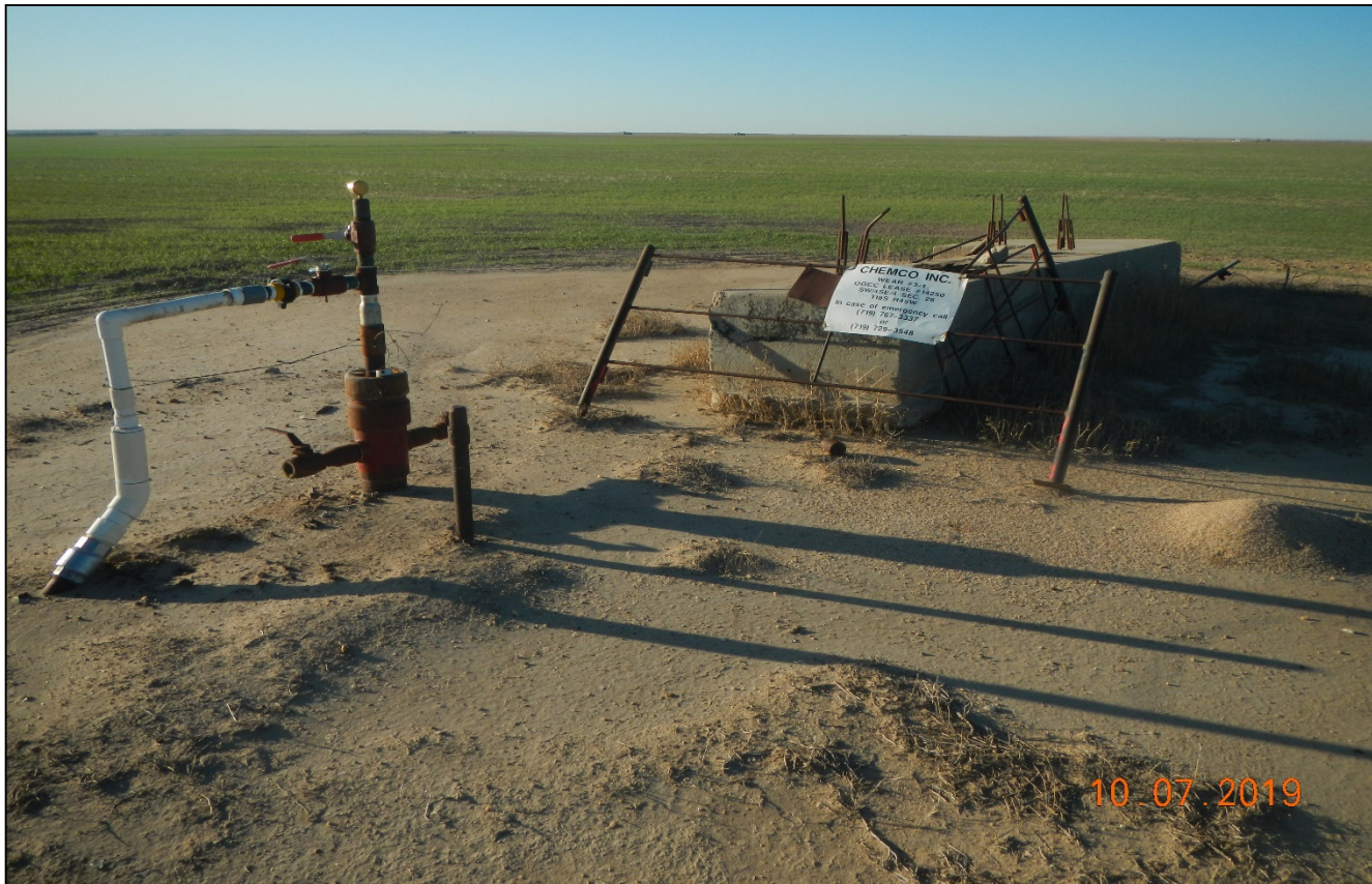
Photo 2. Well sign is posted.