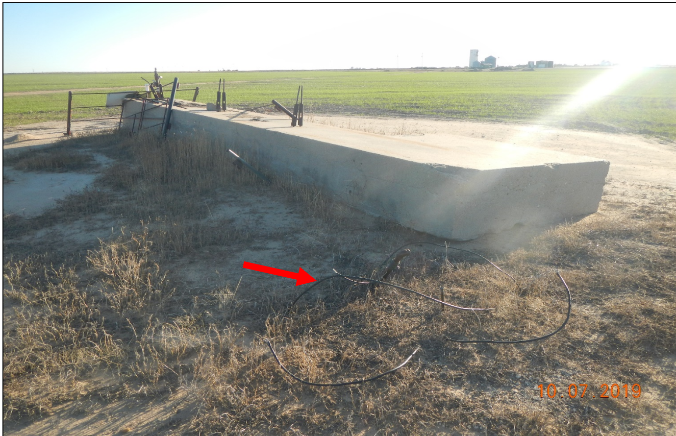
Photo 3. The cement pad is not in use and is considered unused equipment which needs to be removed. There are electrical wires and pipe risers shown by red arrow.