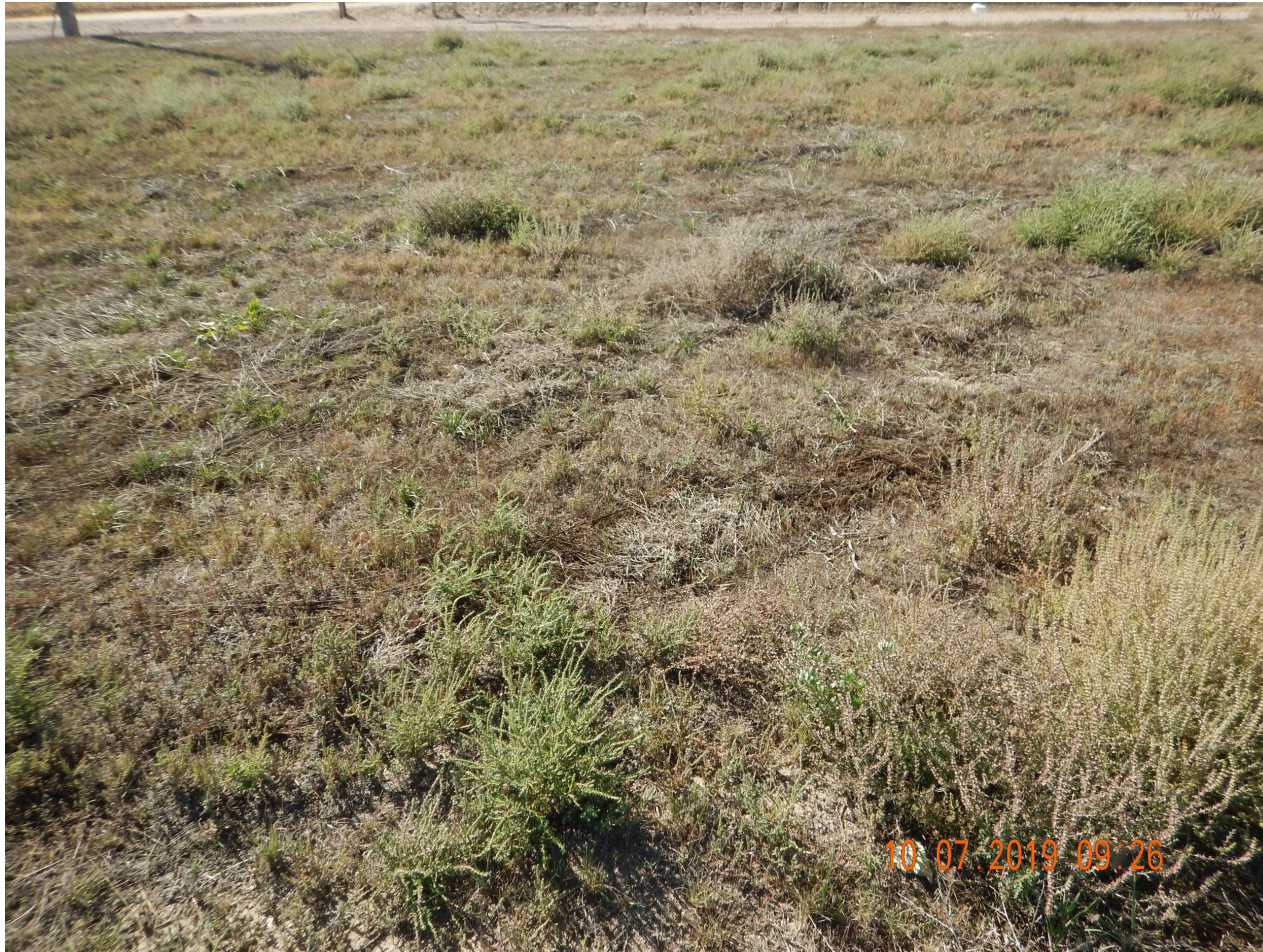
Photo 6. Photo taken from the central tank battery location, facing South. Photo illustrates the location appears to have been mowed this season. Undesirable species (Kochia and Russian thistle) were observed. Note: Even though the Operator claims to use a seed mix approved by the Surface Owner, it is not reflective of reference area vegetation.