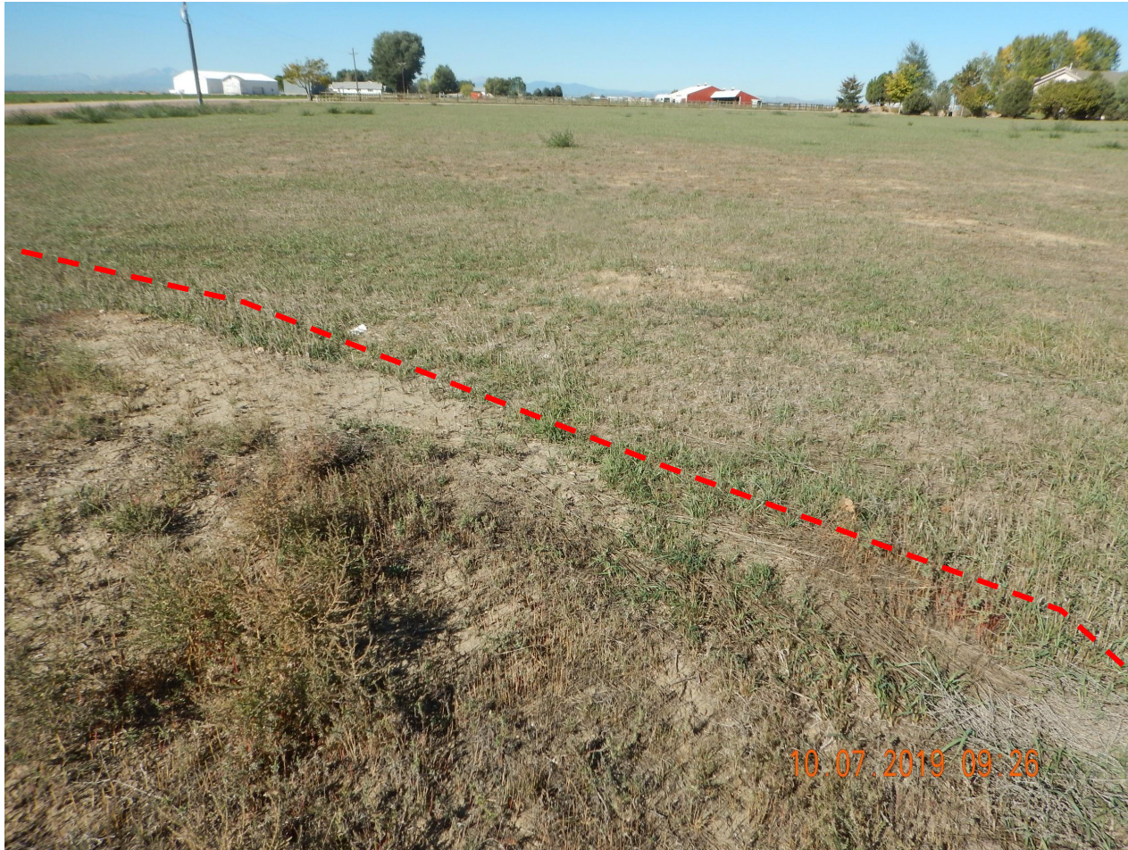
Photo 7. Photo taken from the western tank battery location, facing West. Photo illustrates the reference area vegetation is mostly comprised of Smooth brome. Location is in the foreground of the photo, below the red-dashed line.