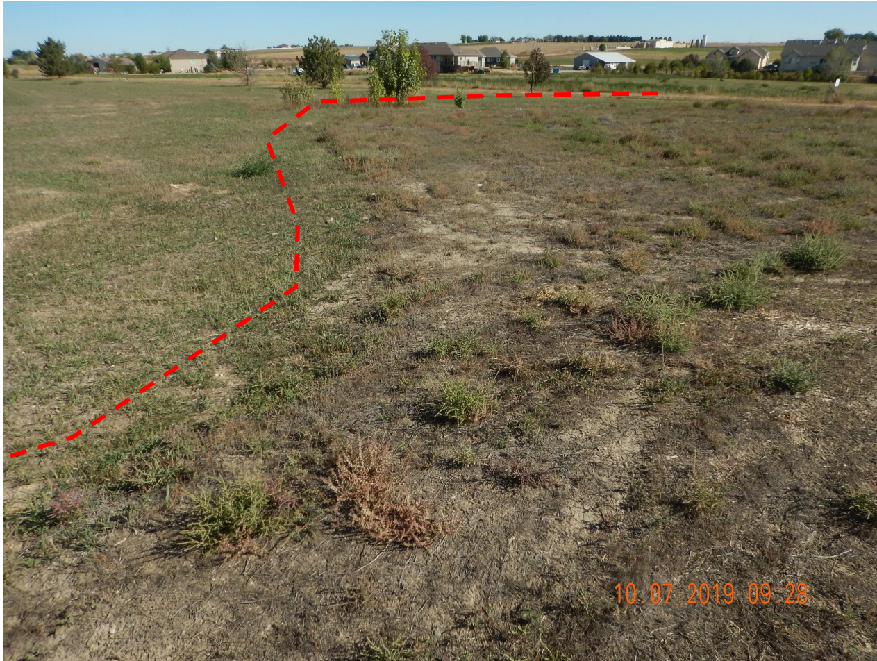
Photo 5. Photo taken from the southwestern tank battery location, facing Northeast. Photo illustrates the Operator failed to properly contour the location to match the surrounding landscape to allow for successful flood irrigation. There appears to be a perimeter ditch along the outside and the location itself is elevated compared to the surrounding landscape. Location is to the right of the red-dashed line.