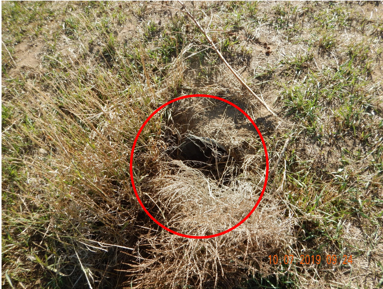
Photo 3. Photo taken of the culvert from the tank battery location that was illustrated in the previous aerial imagery.