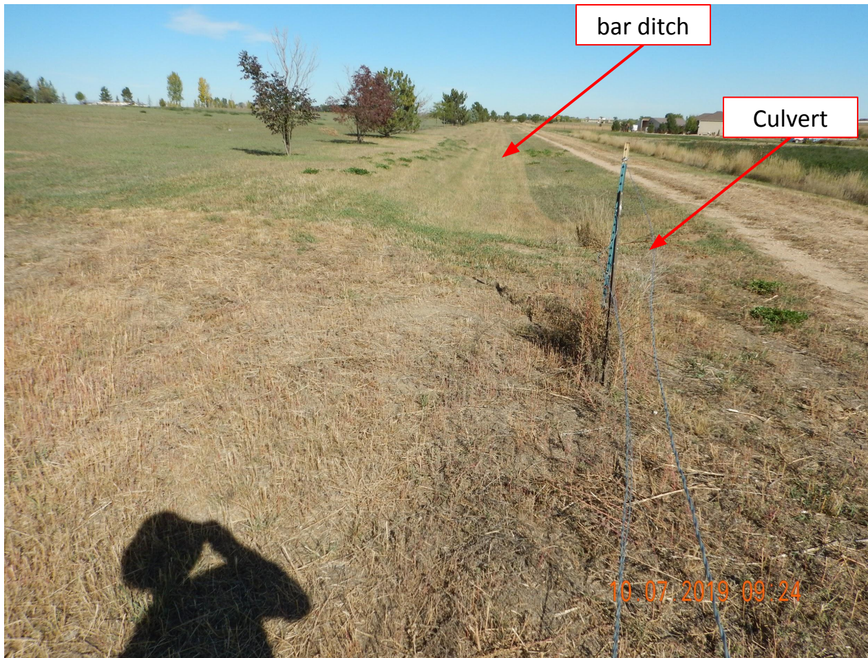
Photo 4. Photo taken from the eastern tank battery location, facing North. Photo illustrates the Operator has failed to remove the culvert and put the bar ditch back in. Bar ditch plays an important role as this area is flooding irrigated.