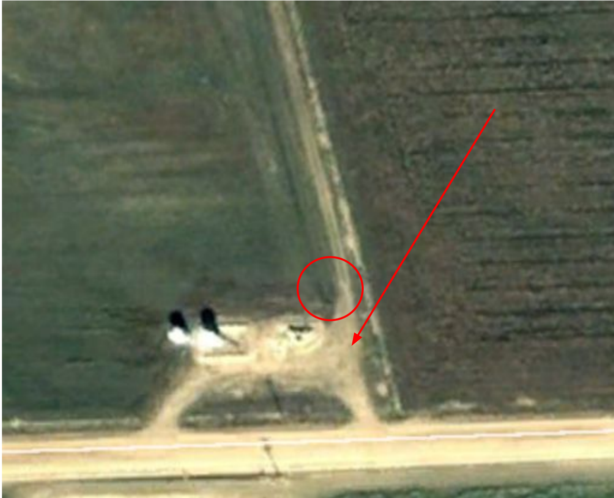
Photo 2. Google Earth aerial imagery taken 10/7/2004. Imagery is illustrating that an additional access (red arrow) was installed along the eastern perimeter of the location; therefore, a culvert (red circle) was installed and a section of the bar ditch along the eastern perimeter of the location was removed. As of 10/7/2019, Operator has failed to remove the culvert (orange circle) and put the bar ditch back in.