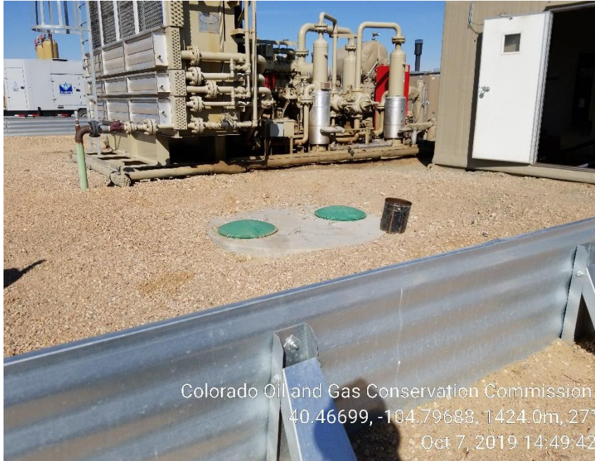
Photo 29: Buried vault WITHOUT signage/ bucket of unknown contents