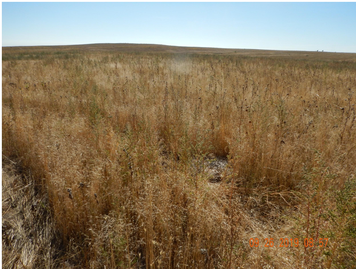
Photo 1. Photo taken from the approximate central location, facing East. Photo illustrates weed maintenance is needed, as Kochia and a high abundance of cheatgrass were observed. The presence of desirable species was observed underneath the weeds.