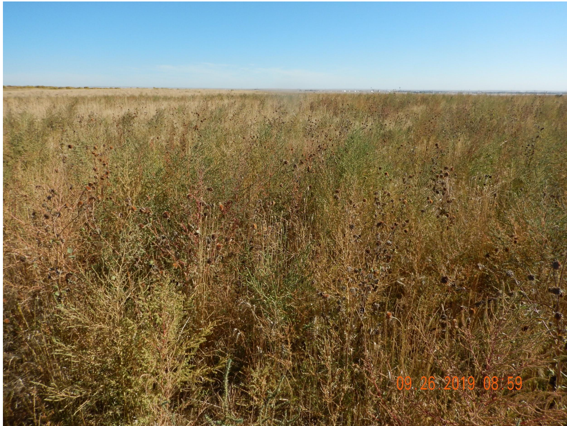
Photo 2. Photo taken along the southern location, facing North. See comments under Photo 1.