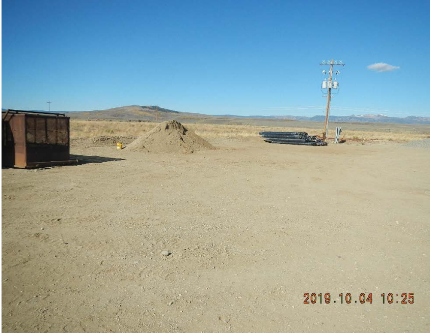
Equipment and soil stockpile.