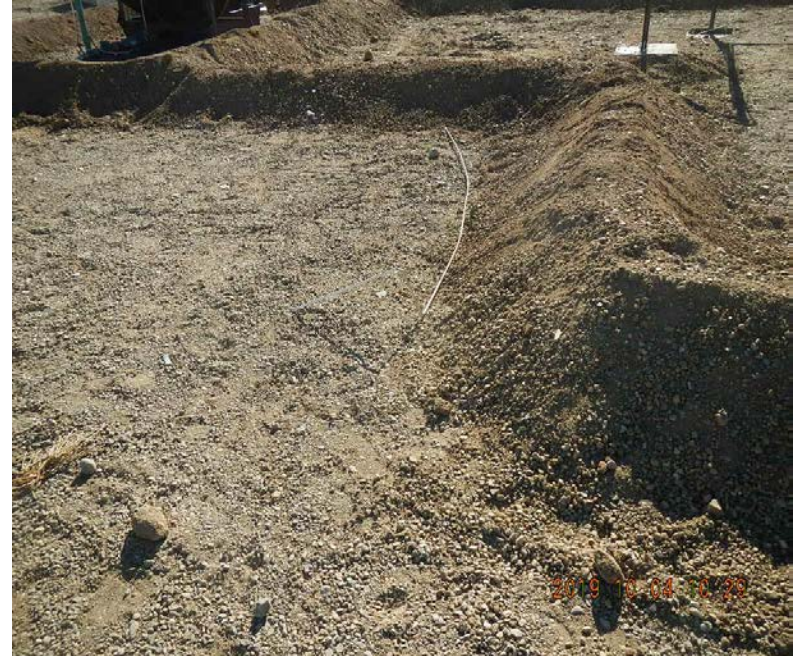
Stainless steel line (trash/debris).