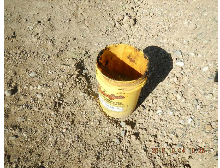
5-gallon pail with oily rag.