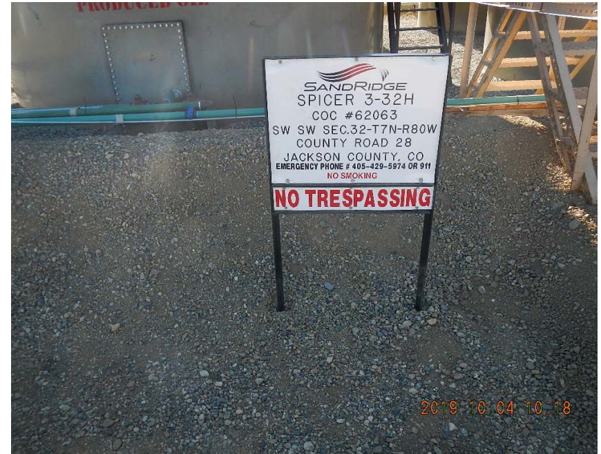
Tank battery rebuilt.