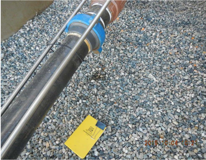
Leaking hammer union between the two southern most tanks.