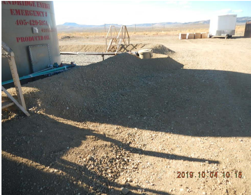
Line and bermed tank battery, view is to the South.