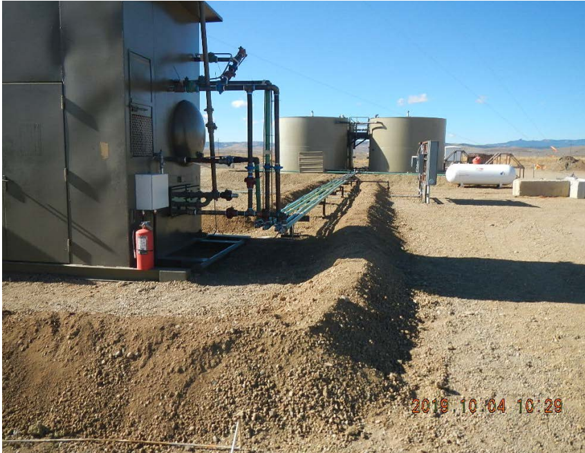
View is looking east, piping within secondary containment.