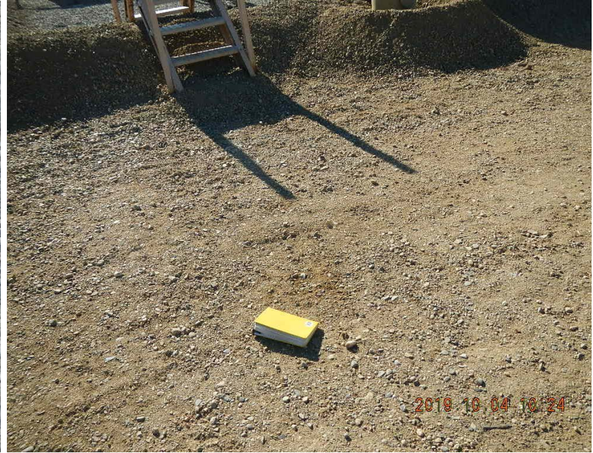
Apparent oily stained soil near the northwest corner of the tank battery.