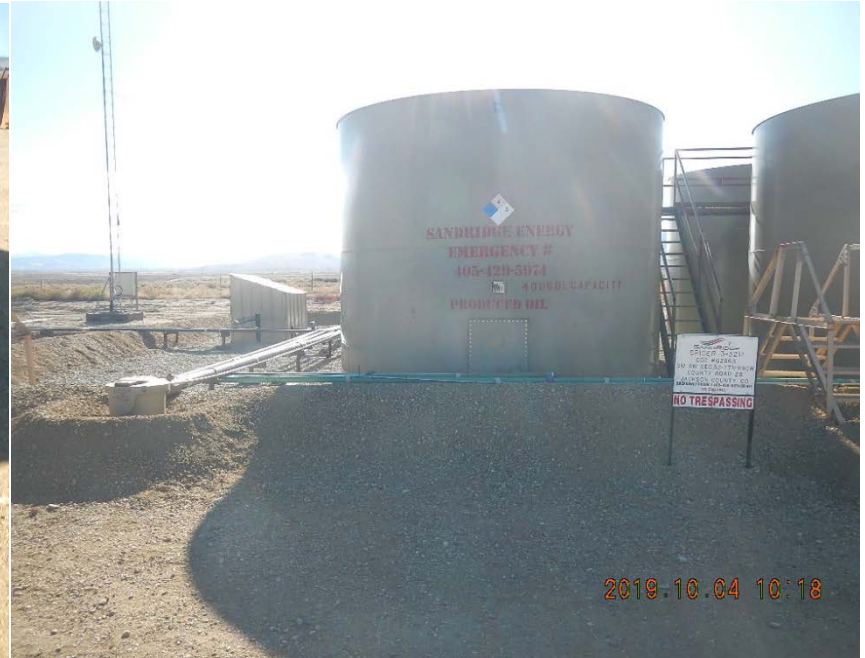
Lined bermed tank battery.