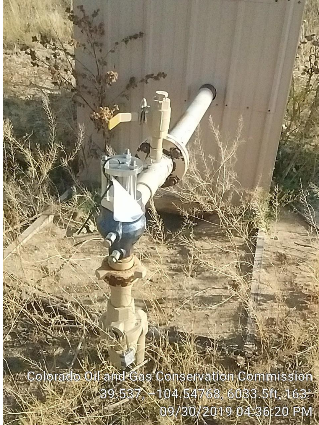
Anadarko Third Creek gas sales line LO/TO.

Colorado Oil and Gas Conservation Commission 39-537, -104.54768, 6033.5ft, 163° 09/30/2019 04:36:20 PM