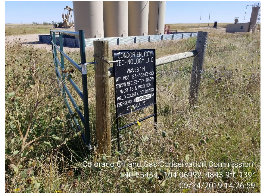
Photo 4 – Sign at Entrance does not reflect current Operator or 24 hour Emergency Contact Info.