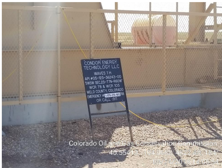
Photo 5 – Sign at Pumping Unit does not reflect current Operator or 24 hour Emergency Contact Info.