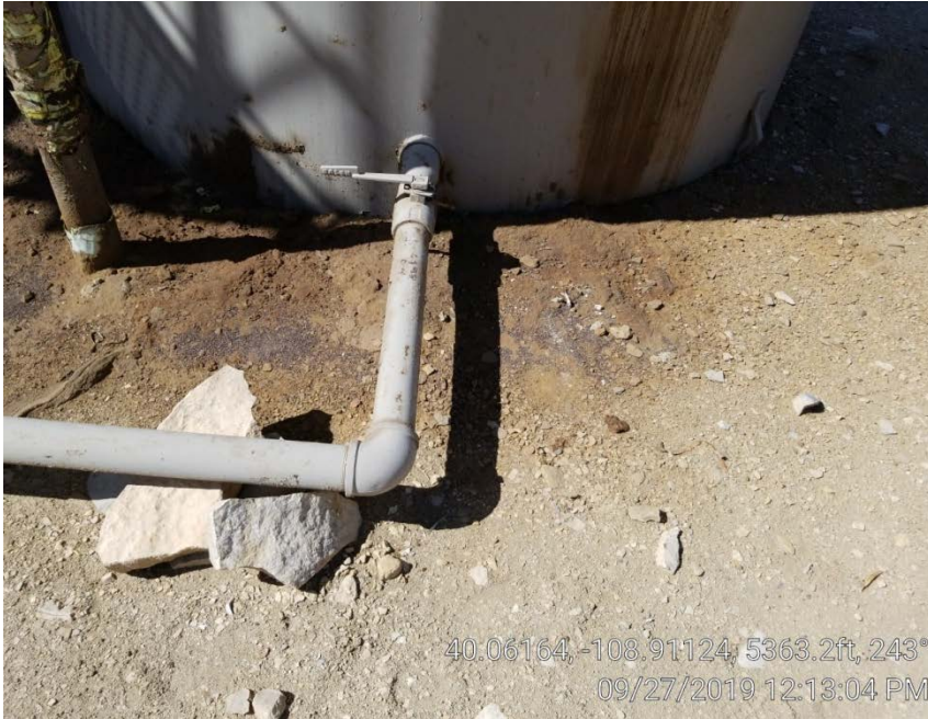
Photo 4. Stained soil at tank battery.