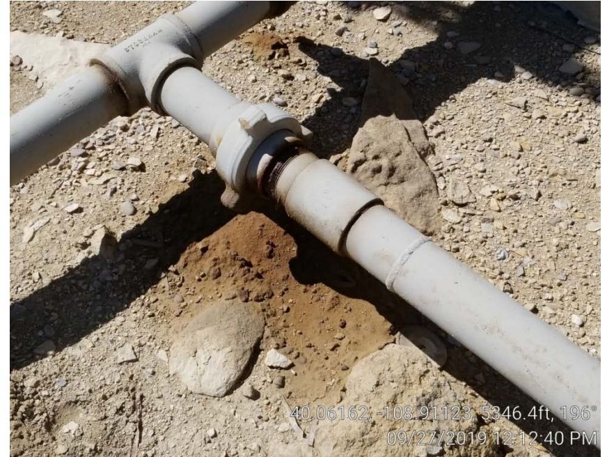
Photo 5. Stained soil at tank battery.