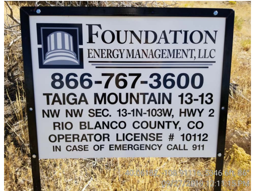
Photo 3. Sign at entrance to location.