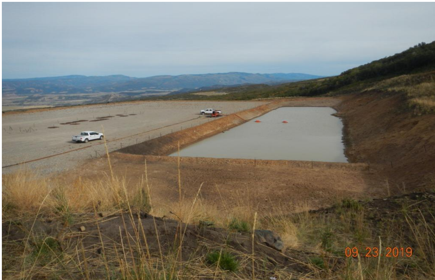
Photo#2: Overview of Location from top of topsoil stockpile to Southeast.