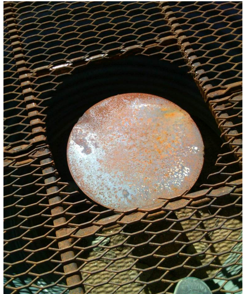
Photo#26: Conductors set; not covered to prevent ingress by wildlife.