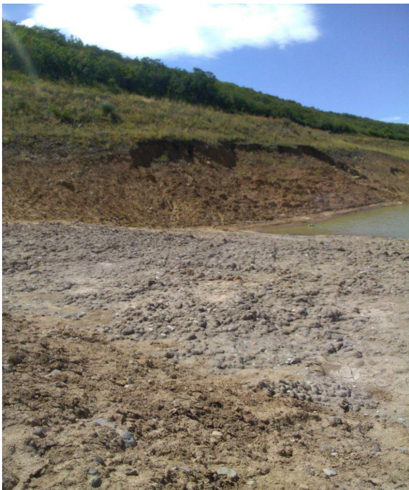
Photo#23: View over cuttings at Southeast end of trench to cut slope.