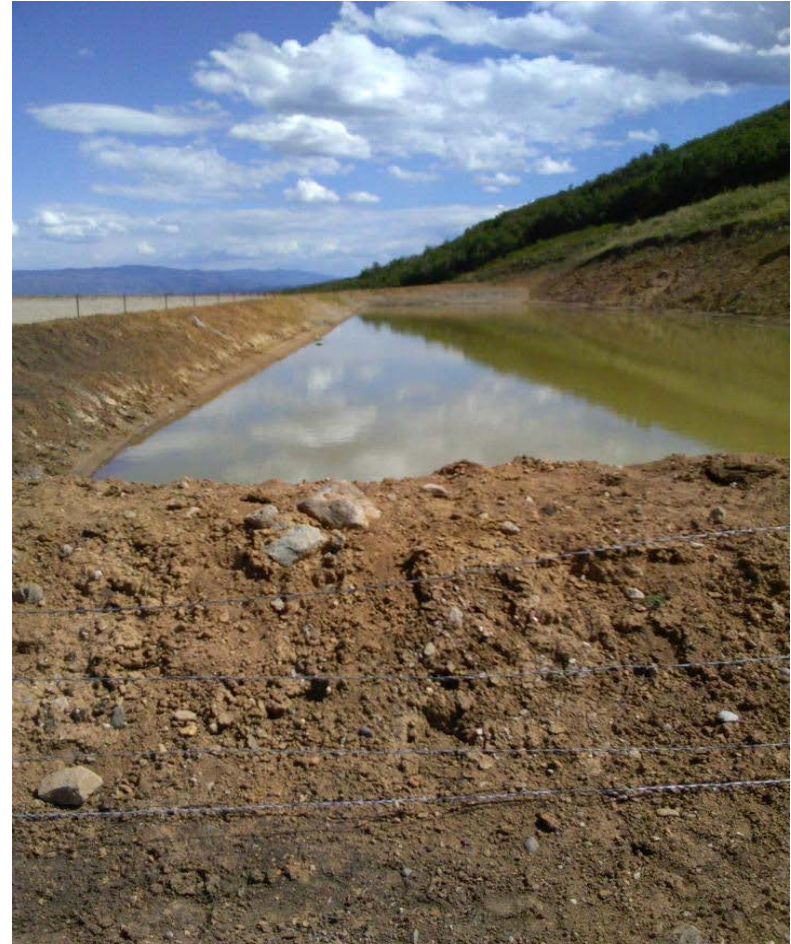
Photo#19: View of cuttings trench from Northwest to Southeast end.