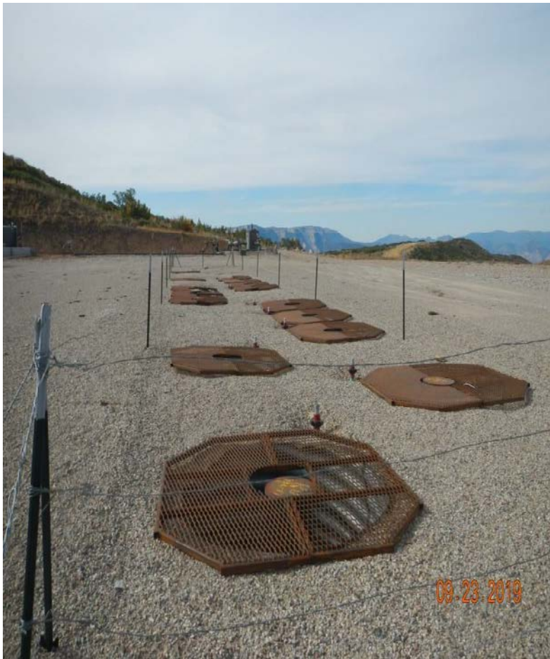
Photo#25: Conductors set; not covered to prevent ingress by wildlife.