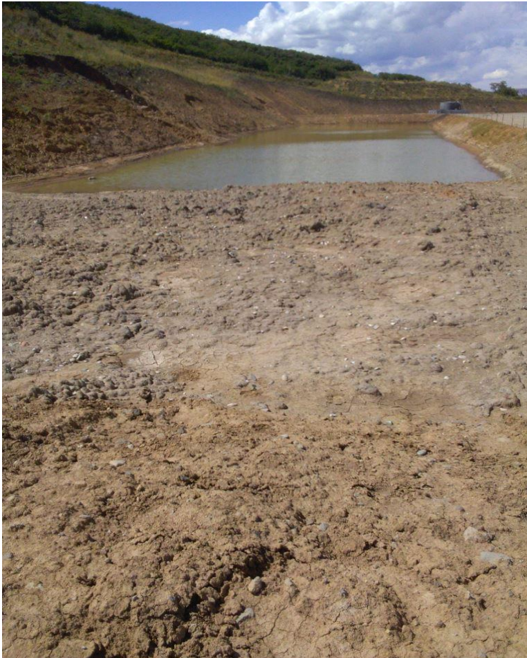
Photo#18: View of cuttings trench from Southeast to Northwest end. Conductor cuttings in foreground.