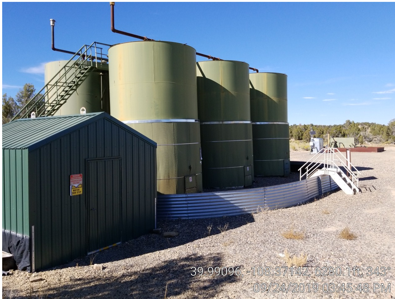
Photo 2. Equipment building, tank battery, meter building, and separator.