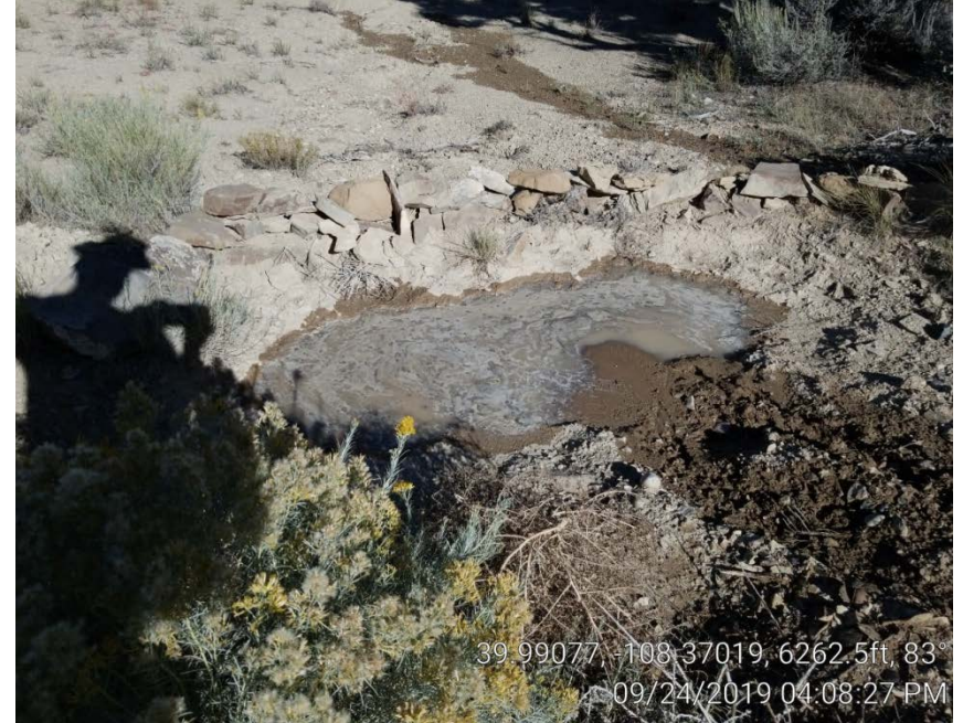
Photo 8. Fluid flow into retention 'pond'.