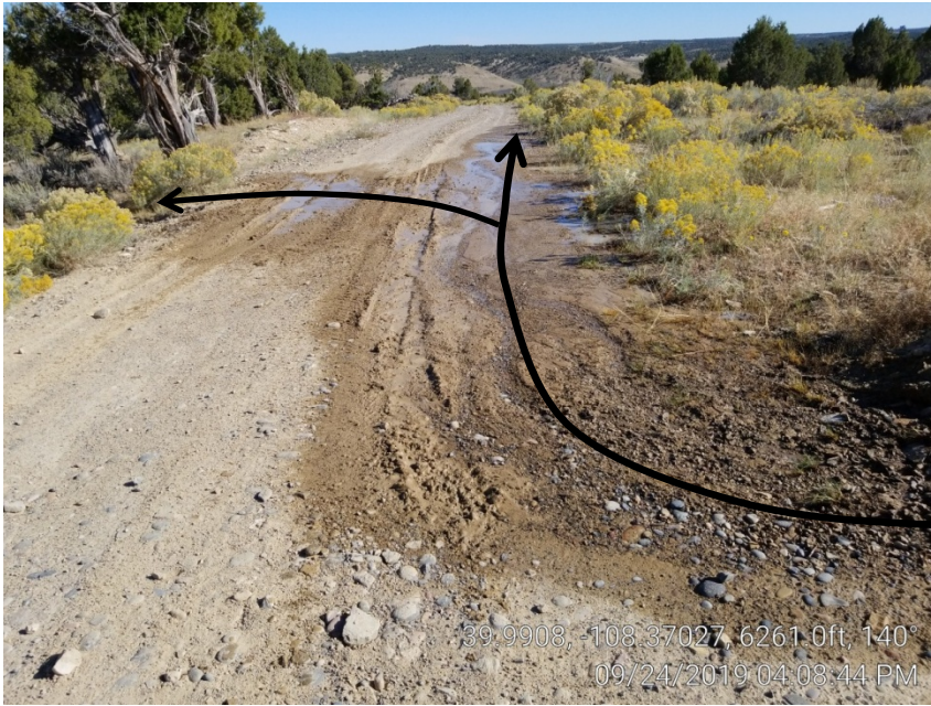
Photo 7. Fluid flowing down road.