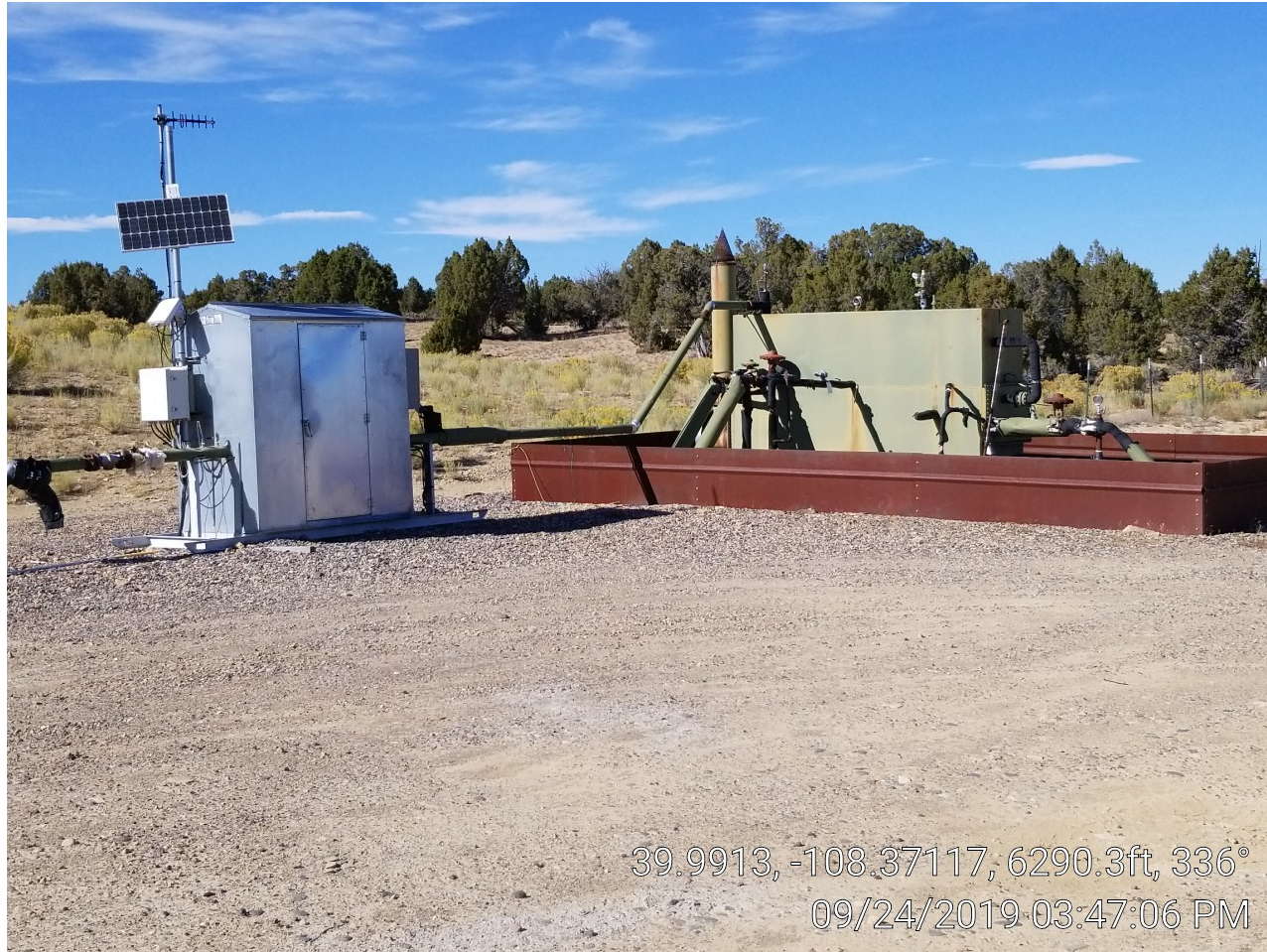
Photo 3. Meter building & separator.