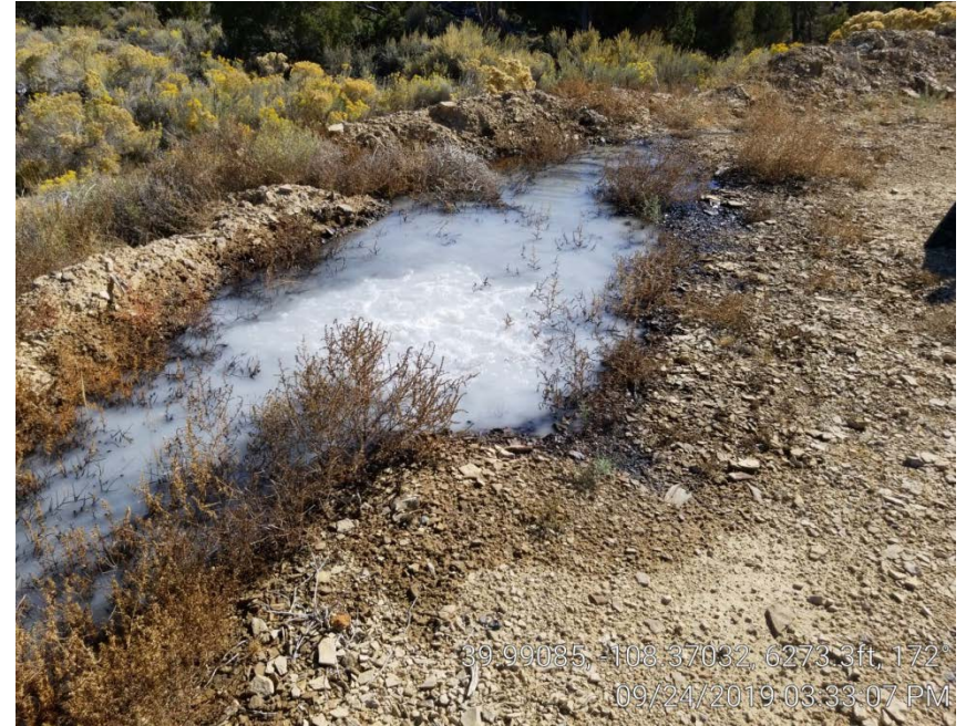
Photo 6. Active leak next to pig station.