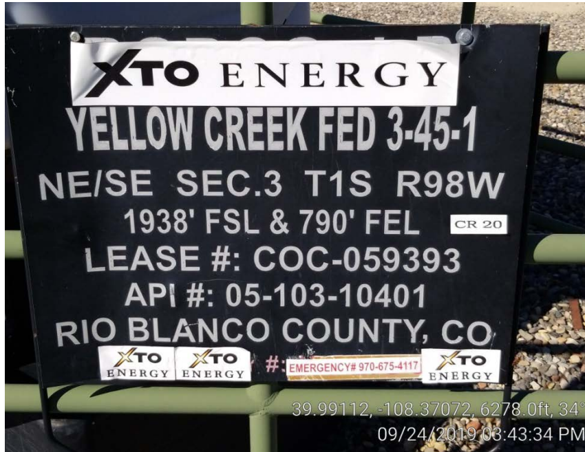
Photo 5. Well head sign.