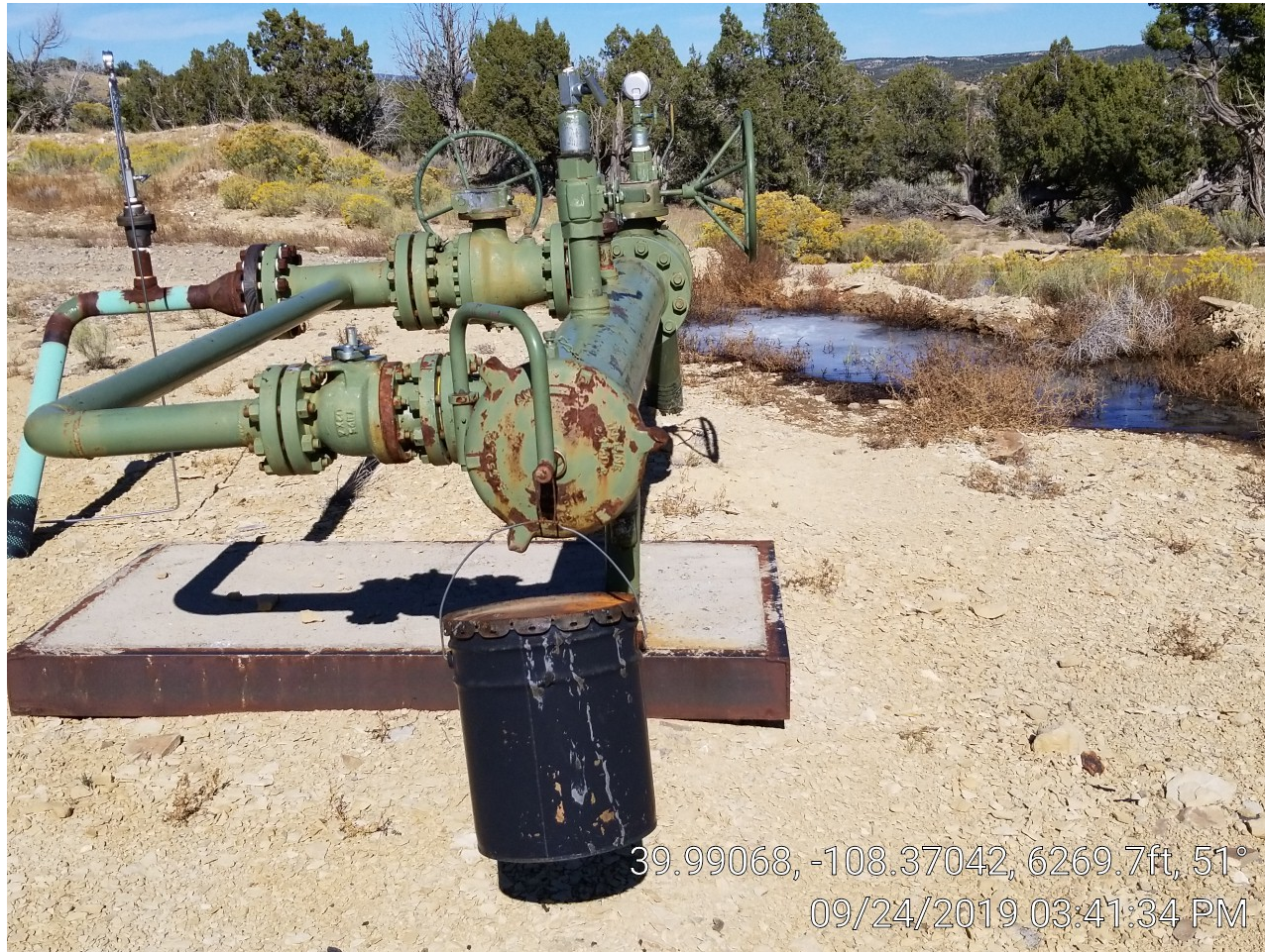
Photo 4. Pig station and active leak.