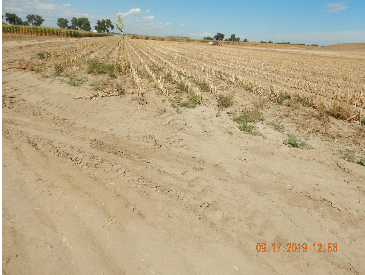
Photo 3. Photo taken from the well/production facility location, facing North. See comments under Photo 1.

Operator indicated this well/production facility location is planned to be used as part of the new Chalk Seeley access road. However, the Operator has only constructed a portion of the new access road- see Photo 4.