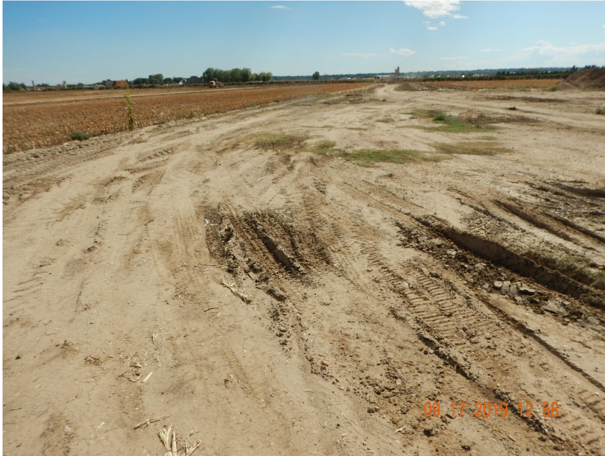
Photo 1. Photo taken from the well/production facility location, facing South. Photo illustrates the Operator has failed to reclaim the location per Rule 1004.