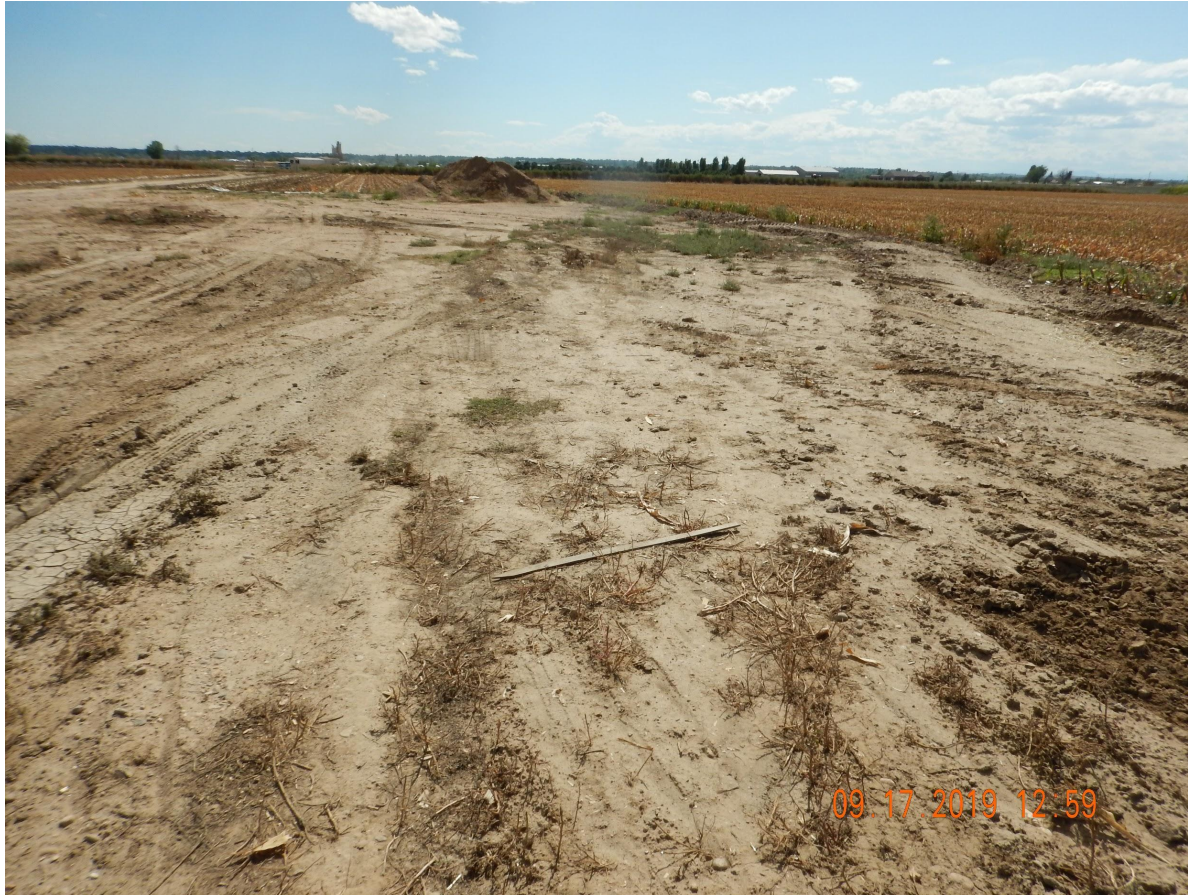
Photo 2. Photo taken from the well/production facility location, facing South. See comments under Photo 1.