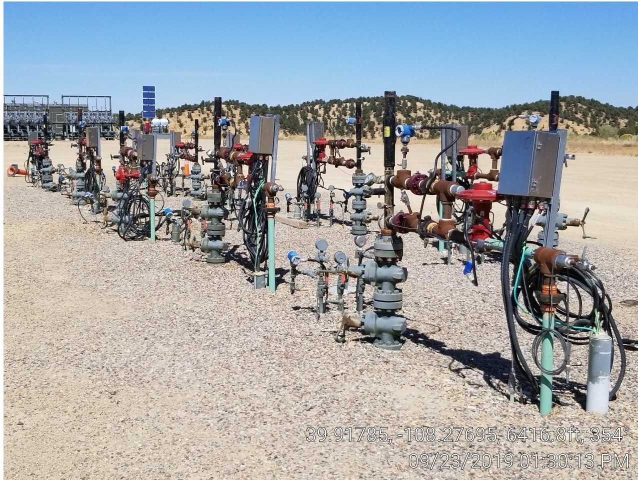
Photo 2. Wells.