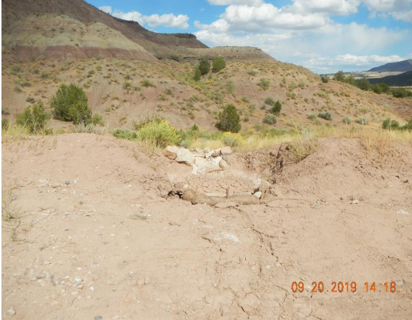
Check dam across from wells has wash damage