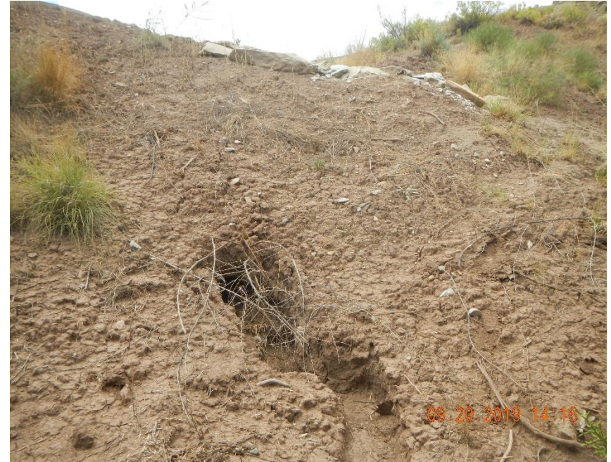
Storm water channel in check dam behind tank battery.