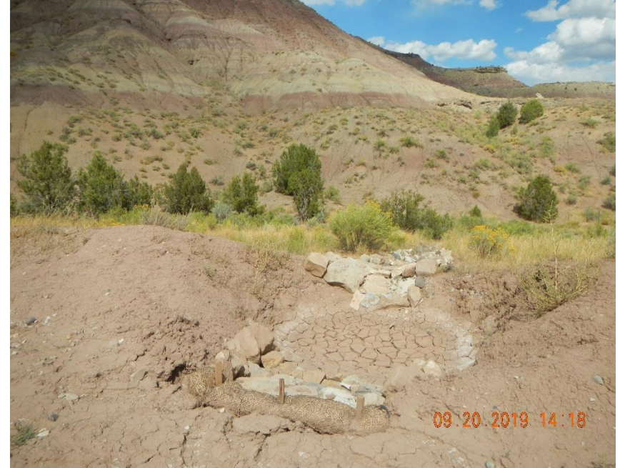
Check dam across from wells has wash damage