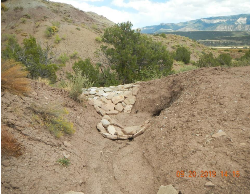
Storm water channel in check dam behind tank battery.