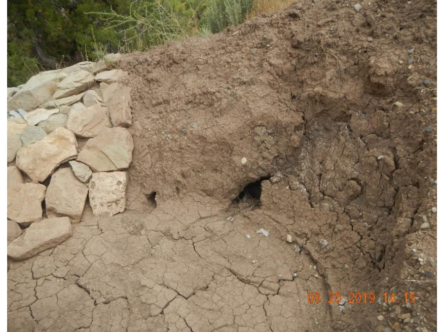
Storm water channel in check dam behind tank battery.