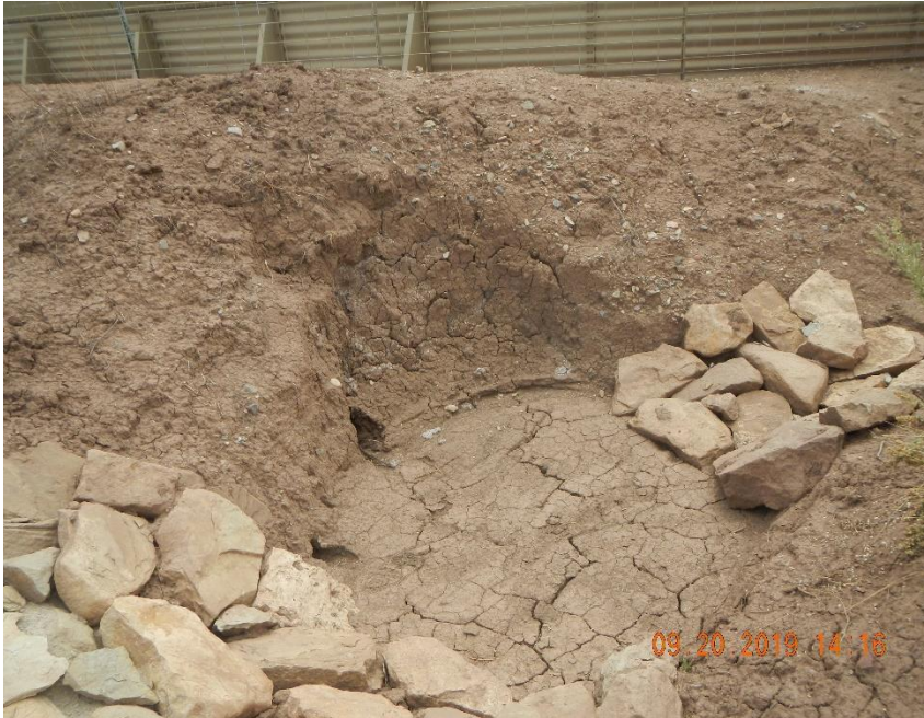
Storm water channel in check dam behind tank battery.