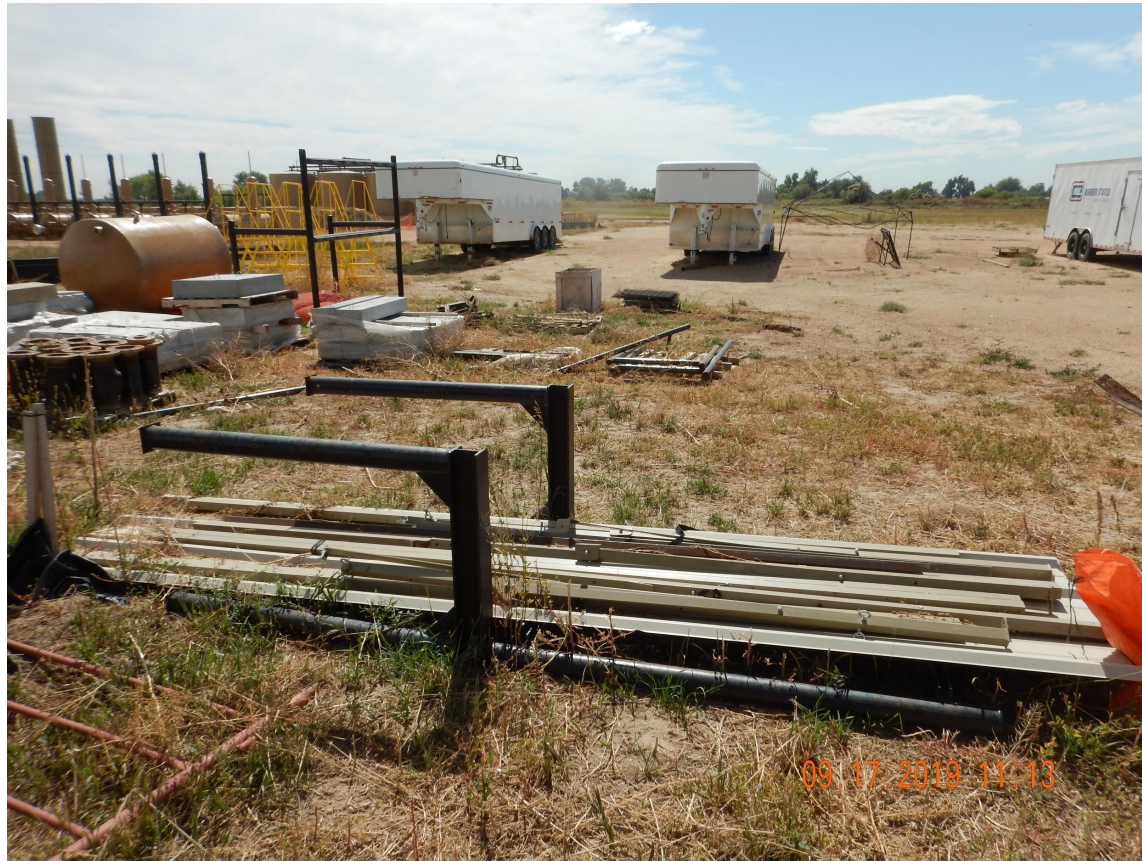
Photo 7. Photo taken from the southeastern well location, facing South. Photo illustrates unused equipment being stored on location.