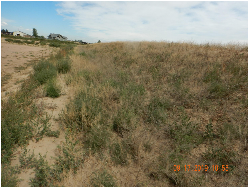
Photo 1. Photo taken from the southern topsoil stockpile, facing North. Photo illustrates Operator has failed to prevent weed establishment on the topsoil stockpile per Rule 1002.c. Also, this topsoil stockpile is from the well location. Operator has failed to salvage topsoil from the production facility. Refer to photos 10-12.