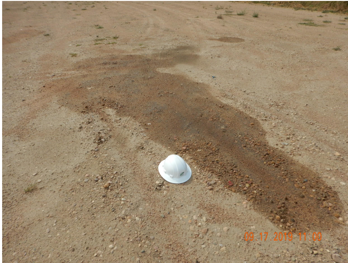
Photo 4. Photo taken from the northern well location. Photo illustrates a localized area of staining that the Operator has failed to clean up per Rule 907.e.