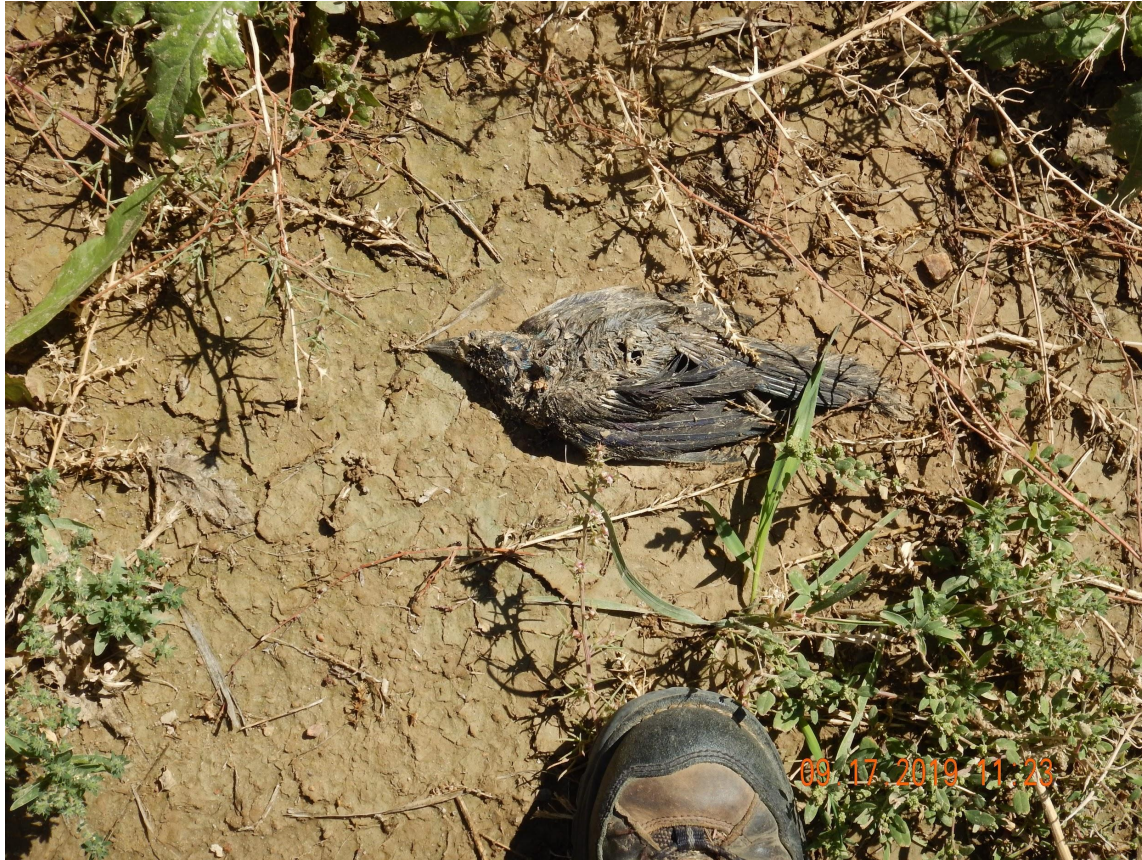
Photo 13. Photo taken from the excavated area. Photo illustrates a dead bird.