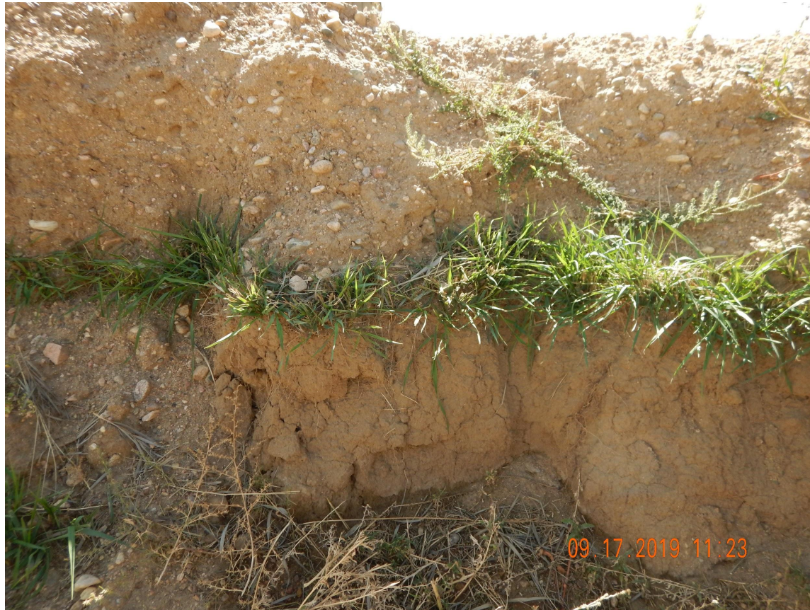
Photo 12. Photo taken from the excavated area within the production facility. Photo illustrates ~2 feet of material was placed on top of the original contour without first salvaging topsoil. Smooth brome is shown growing out from the original contour which demonstrates the Operator didn't salvage any topsoil.