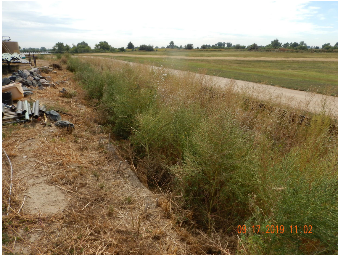
Photo 6. Photo taken from the southern well location, facing East. Photo illustrates unused equipment be stored on location and unmanaged weeds.