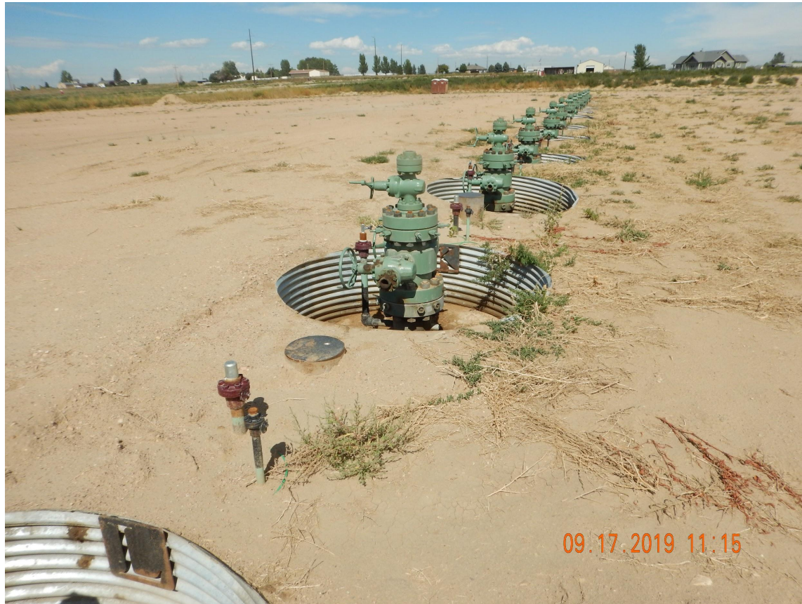
Photo 8. Photo taken from the wellhead area, facing North. Operator has failed to put cellar covers around the wellheads for public safety per Rule 605.c. This is also a safety hazard for wildlife.