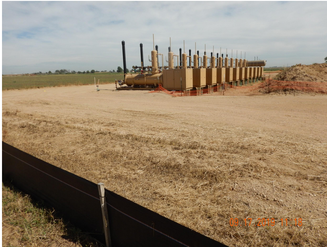
Photo 10. Photo taken from the western production facility, facing East. COGCC staff has evidence from the previous inspection and current conditions to illustrate the Operator failed to salvage topsoil from the production facility. There was no observed topsoil stockpile around the production facility.