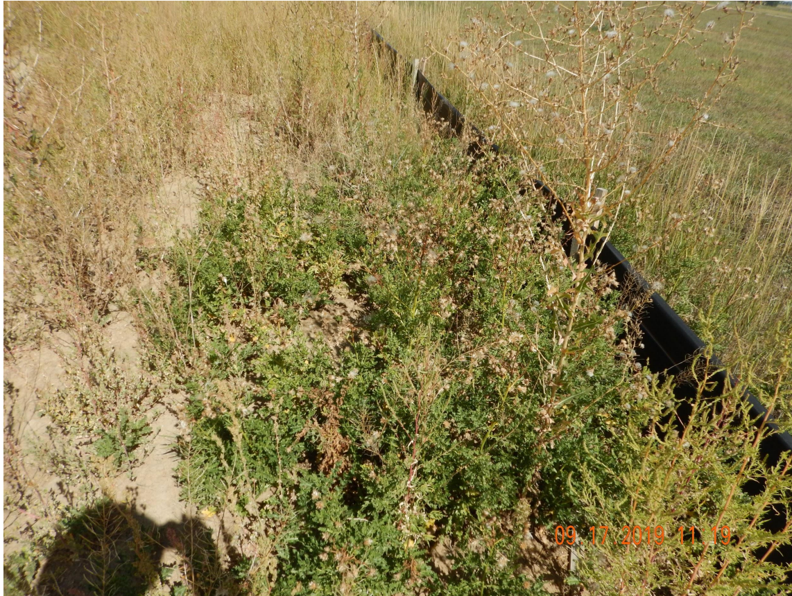
Photo 9. Photo taken from the southeastern perimeter of the well pad, facing North. Photo illustrates unmanaged Canada thistle.