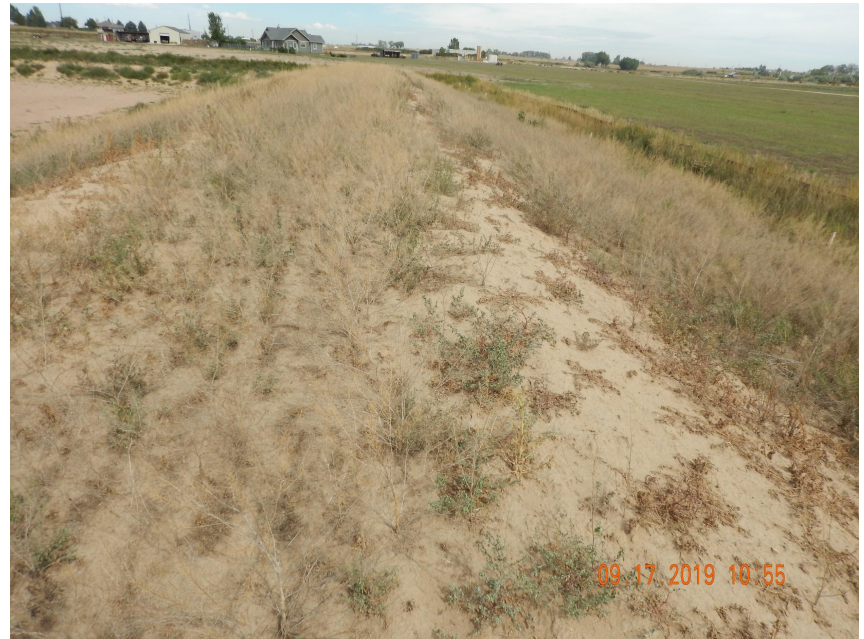
Photo 2. Photo taken from the southern topsoil stockpile, facing North. See comments under Photo 1.