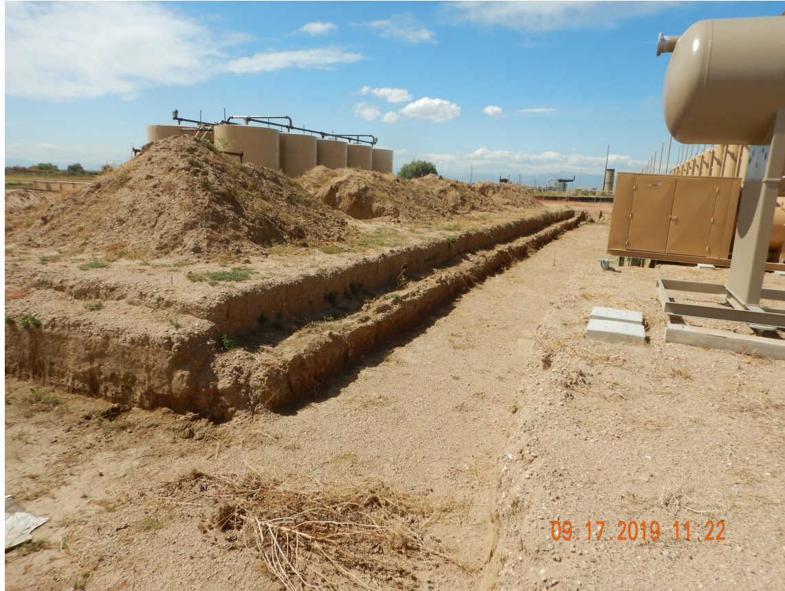
Photo 11. Photo taken from the excavated area within the production facility, facing West. Refer to the following photo demonstrating the Operator didn't salvage any topsoil from the production facility.