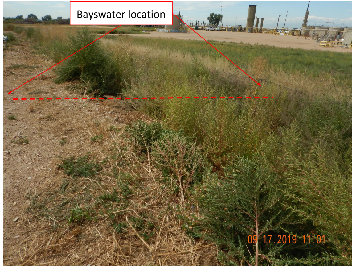
Photo 5. Photo taken from the western well location, facing Southwest. See comments under Photo 3 regarding weeds.