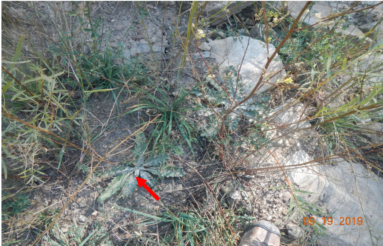
Photo 2. There are Scotch thistle rosette that need to be controlled.