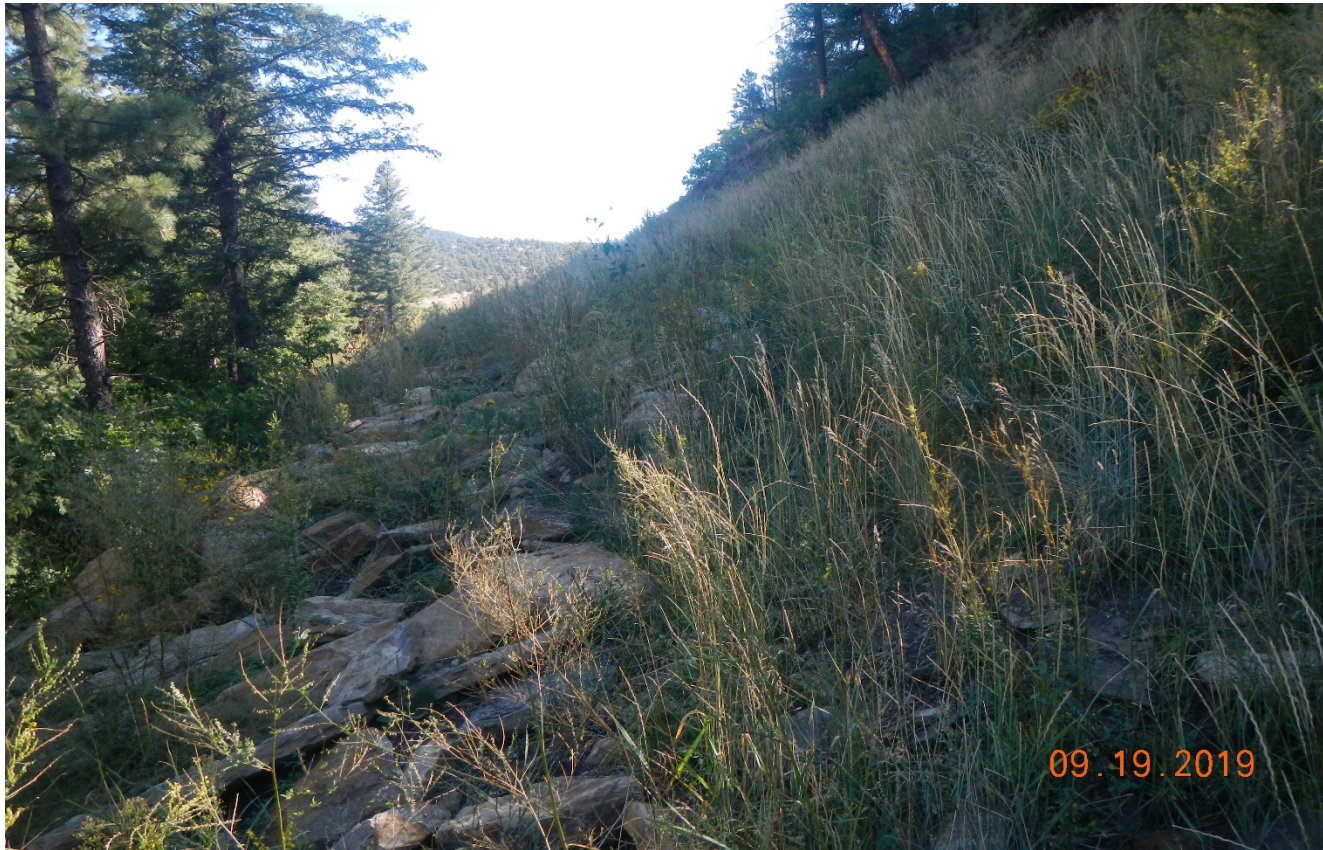
Photo 4. Facing northeast along the reclaimed access road. Vegetation is establishing well.