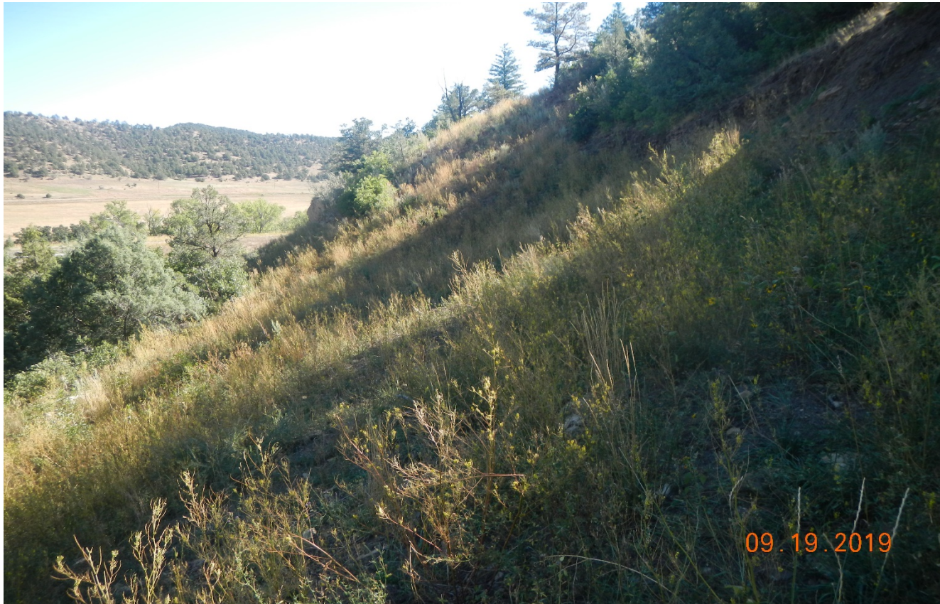
Photo 6. Facing northeast along the reclaimed access road. Vegetation is establishing well. There is a dominance of Yellow clover in this area.