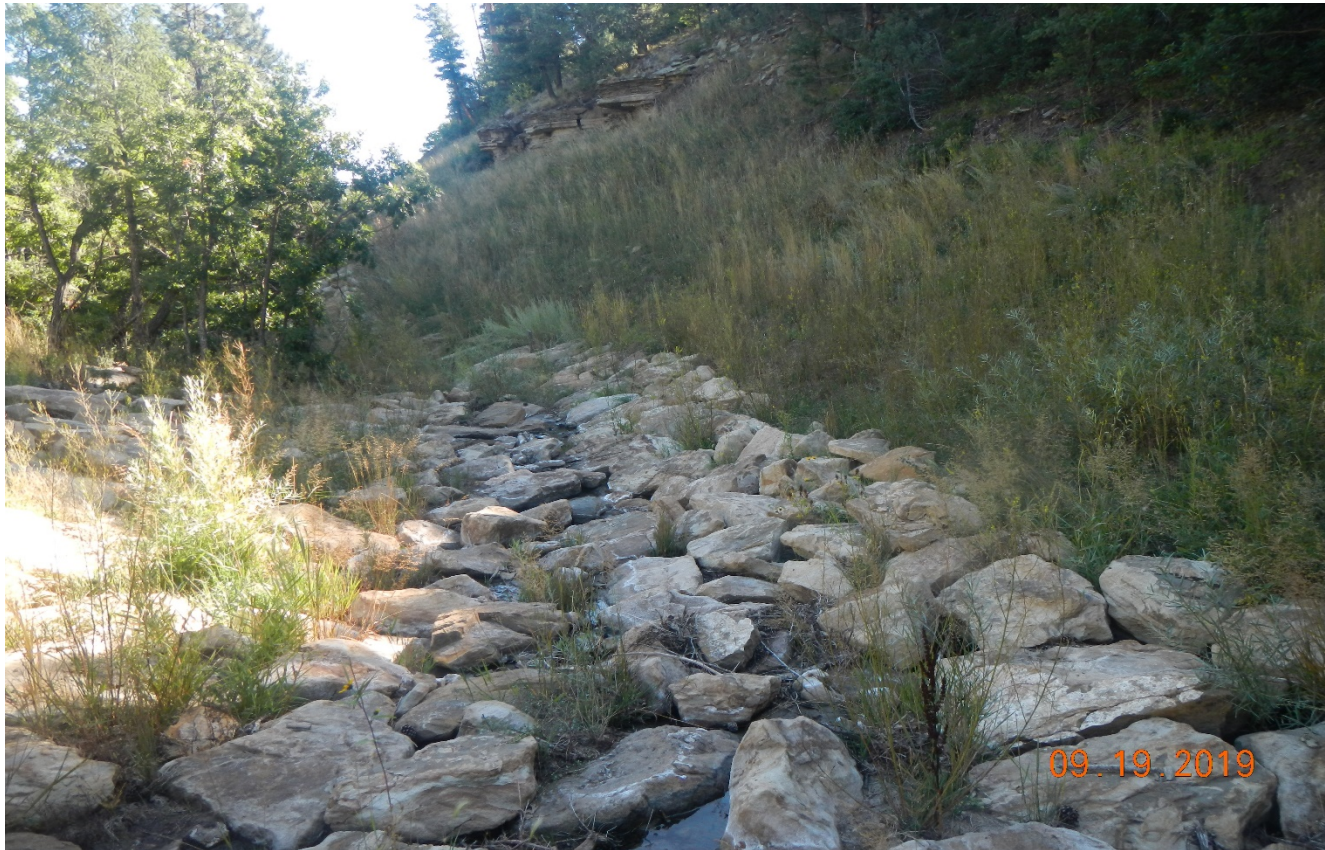
Photo 3. Facing east toward the reclaimed access road from the bottom of the canyon.