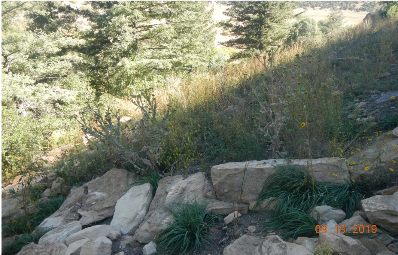
Photo 5. There are noxious weeds along the road which have developed seed heads.