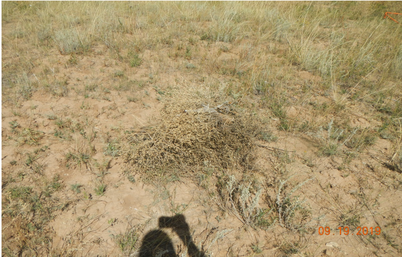
Photo 2. There is a small pile of knapweed that appears to have been cut. The knapweed has seed heads and must be cut, bagged, removed, and treated.