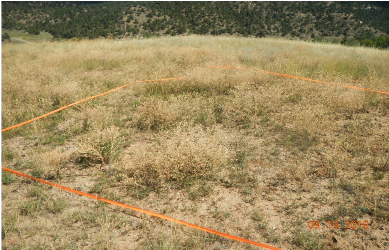
Photo 1. Facing north at the location. There is an orange tape square at the location. There are numerous noxious weeds (Diffuse knapweed) throughout the site.