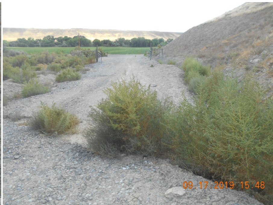
Weeds and erosion inside gate. Looking S.