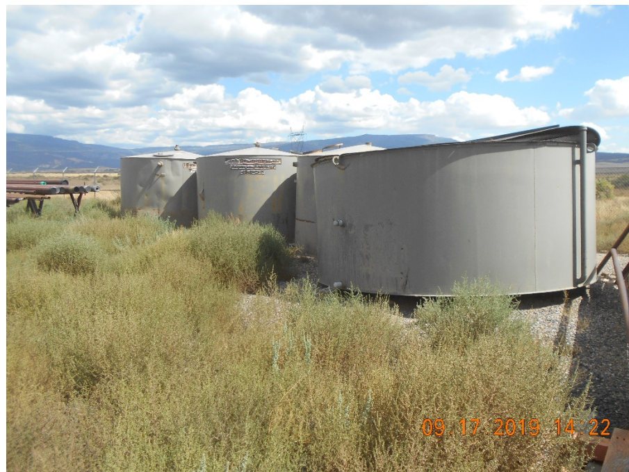
Unused well location prod Water/ Crude oil tanks