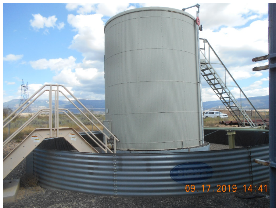
300 bbl tank with metal berms. Looking NE No labels.