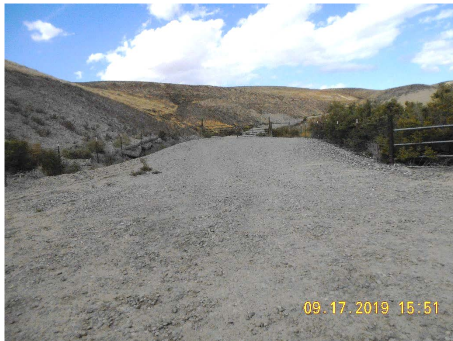
Gate at entrance of access road off Kannah Creek rd. Looking N.