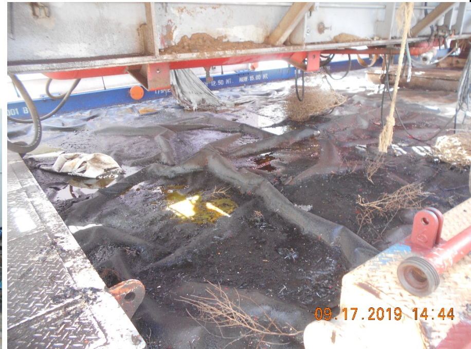
Accumulated oil and debris on matting under draw works.