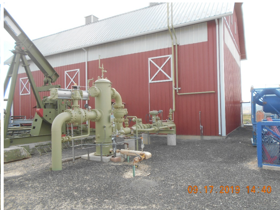
NE side of compressor building looking S.