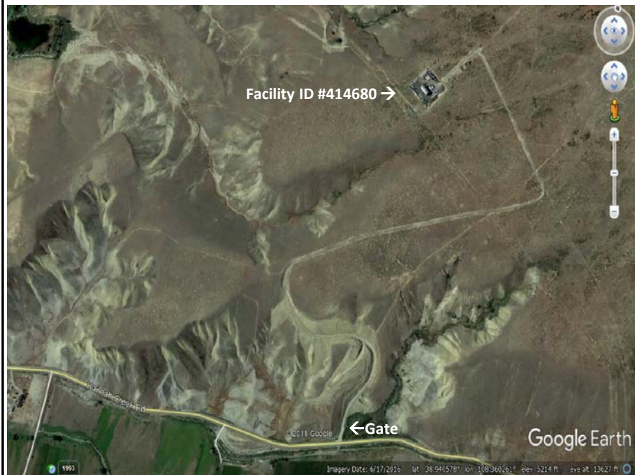
Google Earth view of Facility and access road off Kannah Creek Rd.