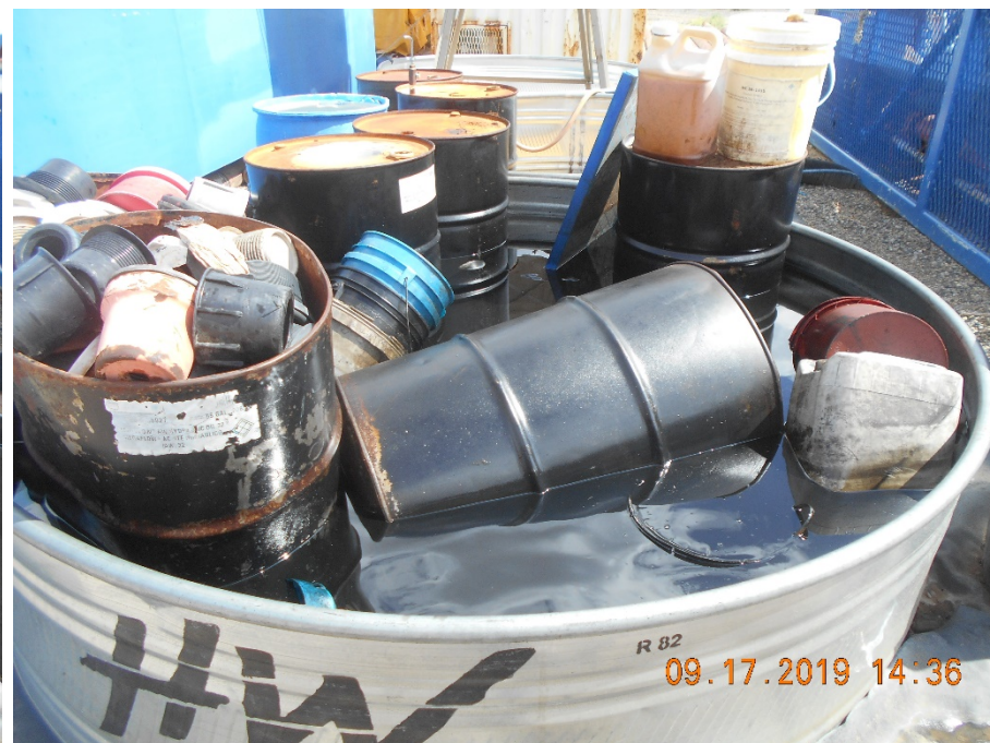
Storage of barrels of unknown chemicals. 4" freeboard in tank. Oil on water.