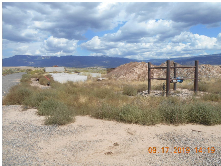
Gathering line riser, soil pile, cement barricades. Located outside fenced area on access road NE of facility. View from entrance gate looking NE.