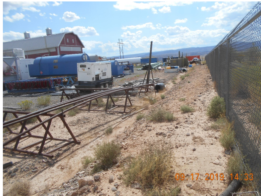
NW corner of fenced area looking SW