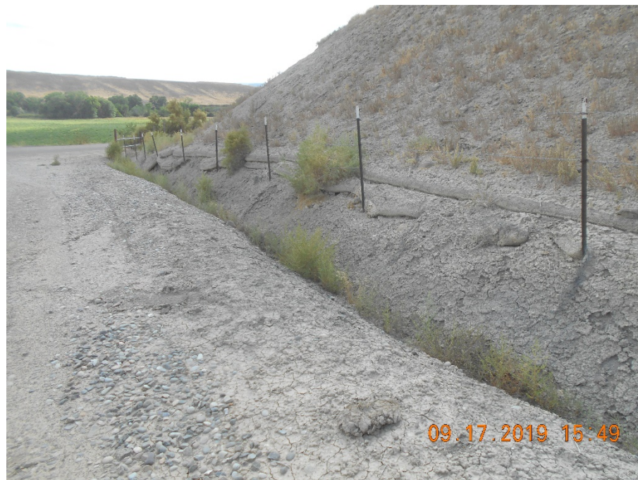
Waddles at entrance on W side. Looking S.