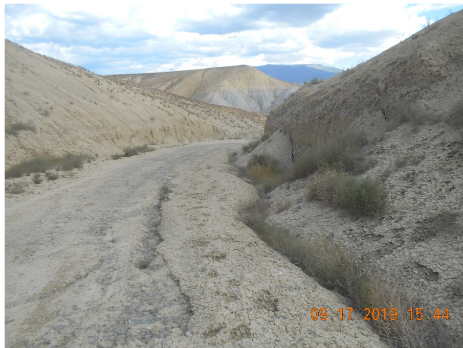
Erosion on access road. Looking E.