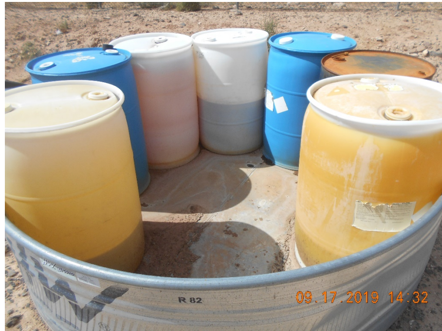
Storage of barrels of unknown chemicals.