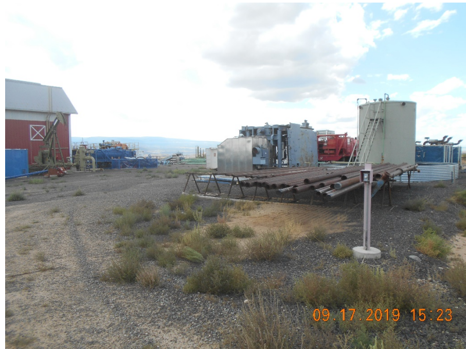
Inside entrance gate looking W.