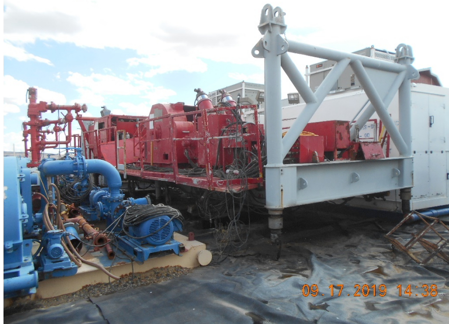
Rig equipment on matting with no containment.