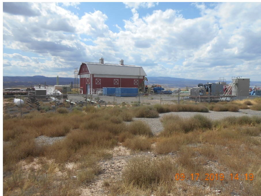
Overview of facility from outside fence . NE corner looking SW