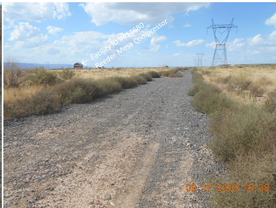
Weeds along access road. Looking NW.