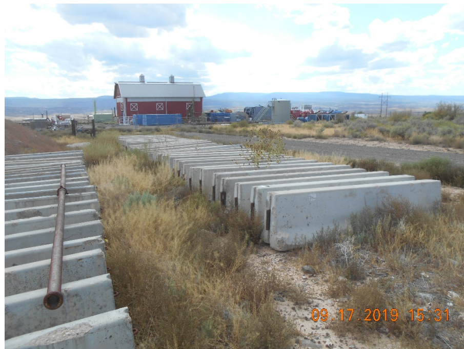
Collection of cement barricades. Located outside fenced area on access road NE of facility. Looking SW.