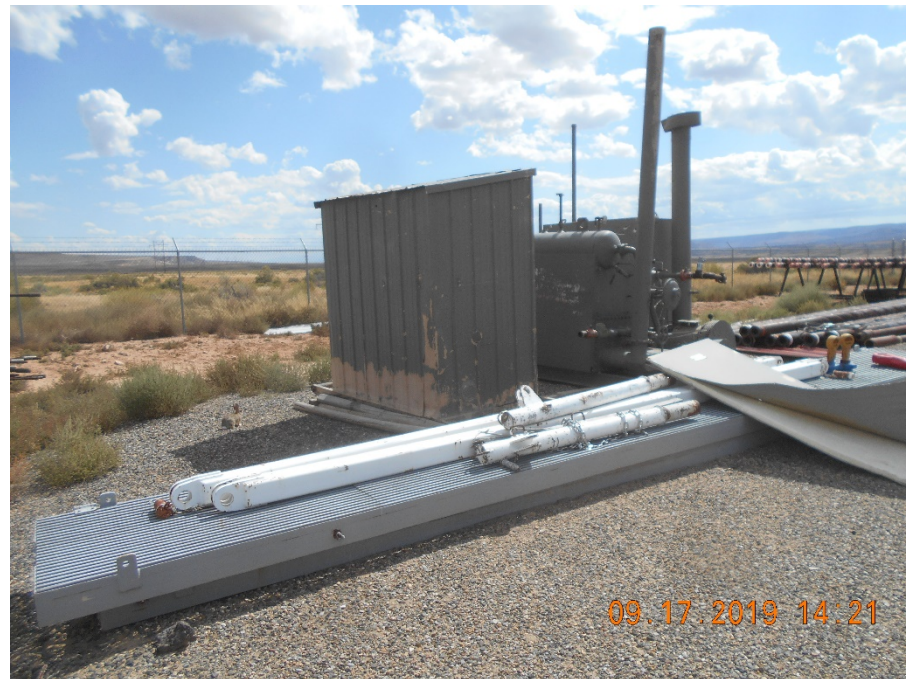
Unused well location separators and meter housings.