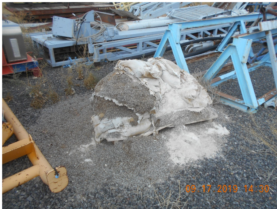
Sacks of drilling chemicals.