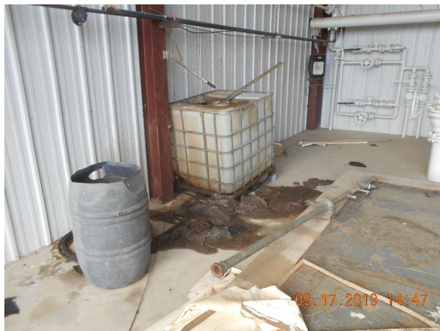
Storage of totes of unknown chemicals inside compressor building