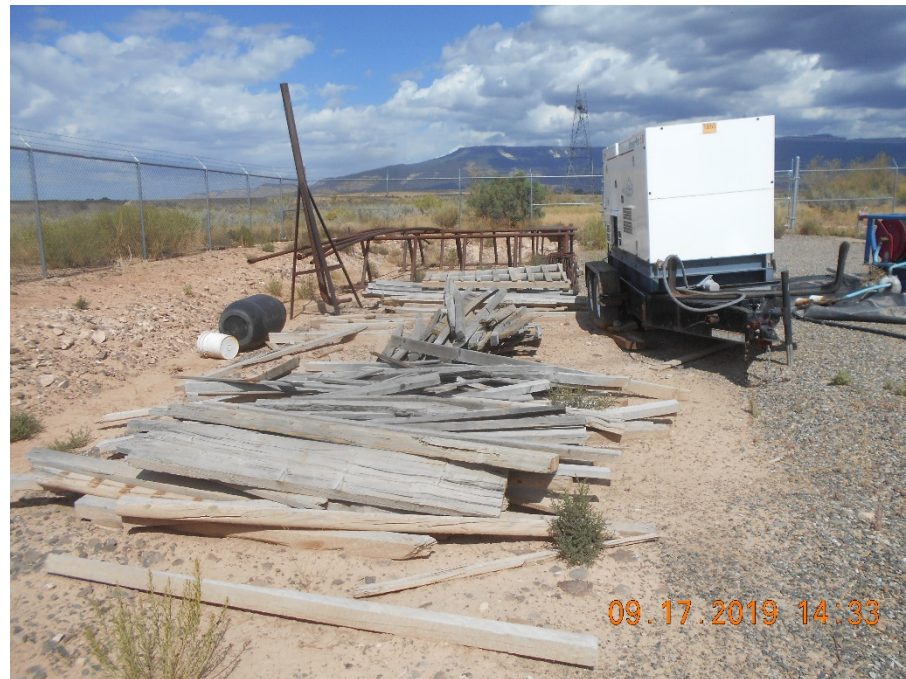
Scrap timbers and trash