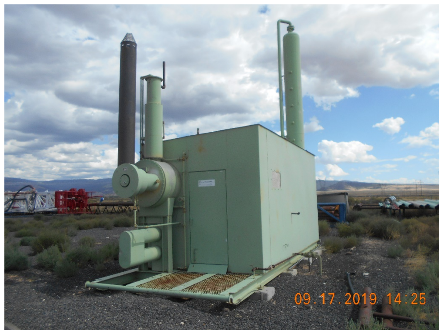
Separator/Dehydrator located near SE corner of facility. Looking SE.