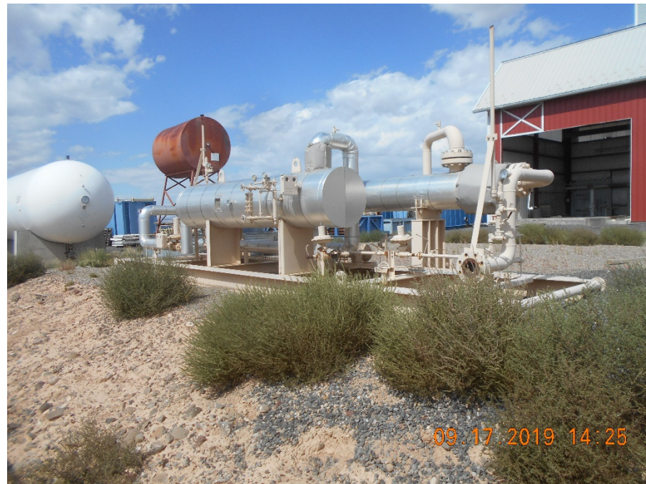
JT skid on SW edge of facility. Looking NW.