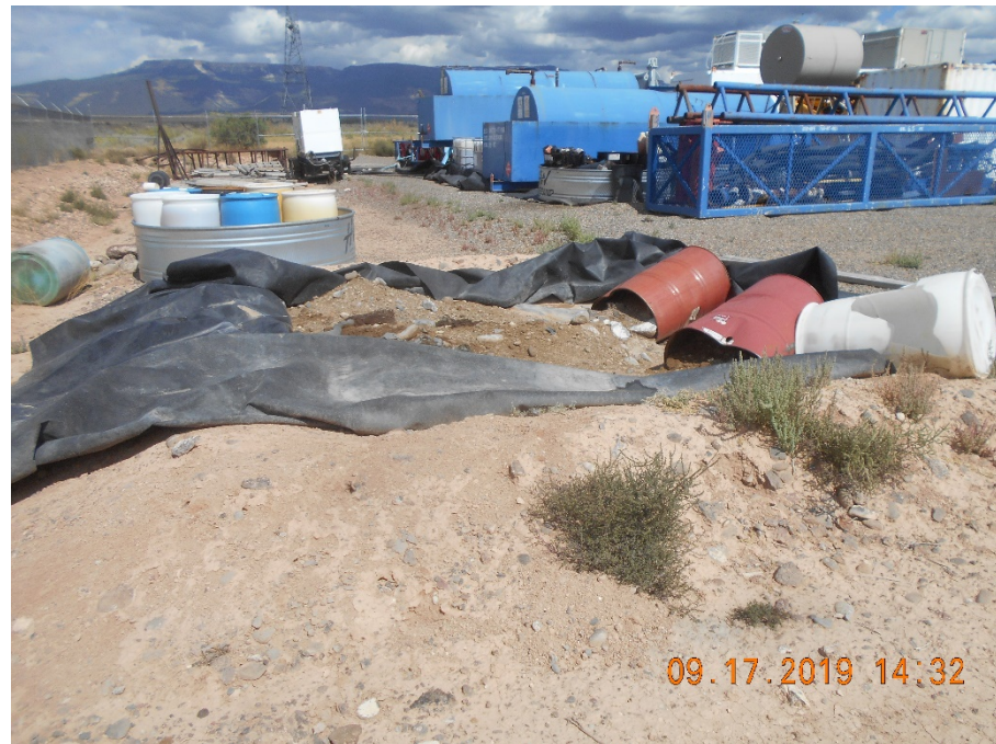
Contaminated soil containment.