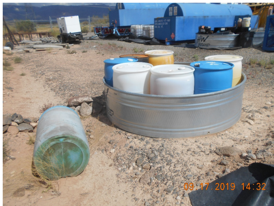
Storage of barrels of unknown chemicals.