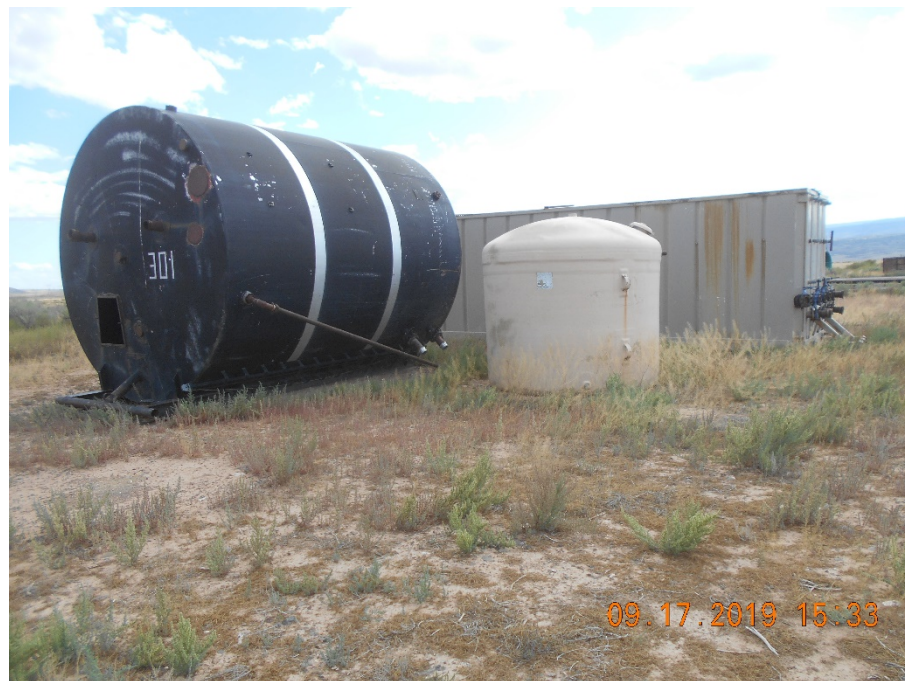
Tanks of various styles. Located outside fenced area on access road NE of facility. Looking SW.