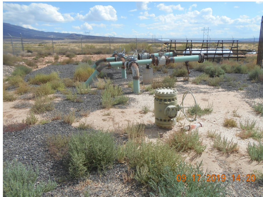
Gathering line risers inside NE corner of facility fenced area. Looking SE.