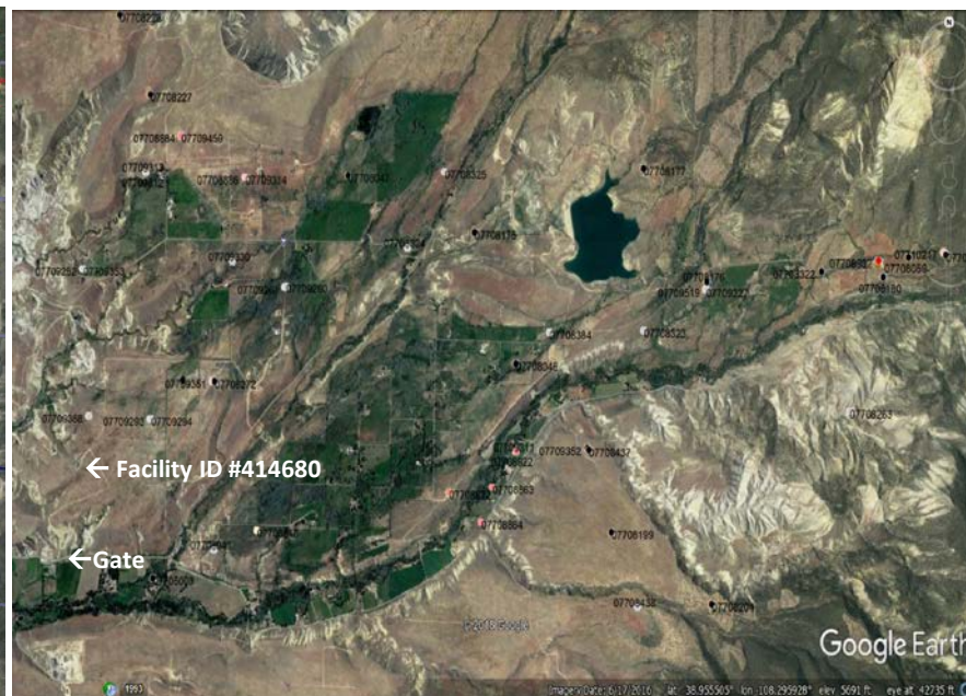
GoogleEarth view of Kannah Creek area. Image date 6/17/2016