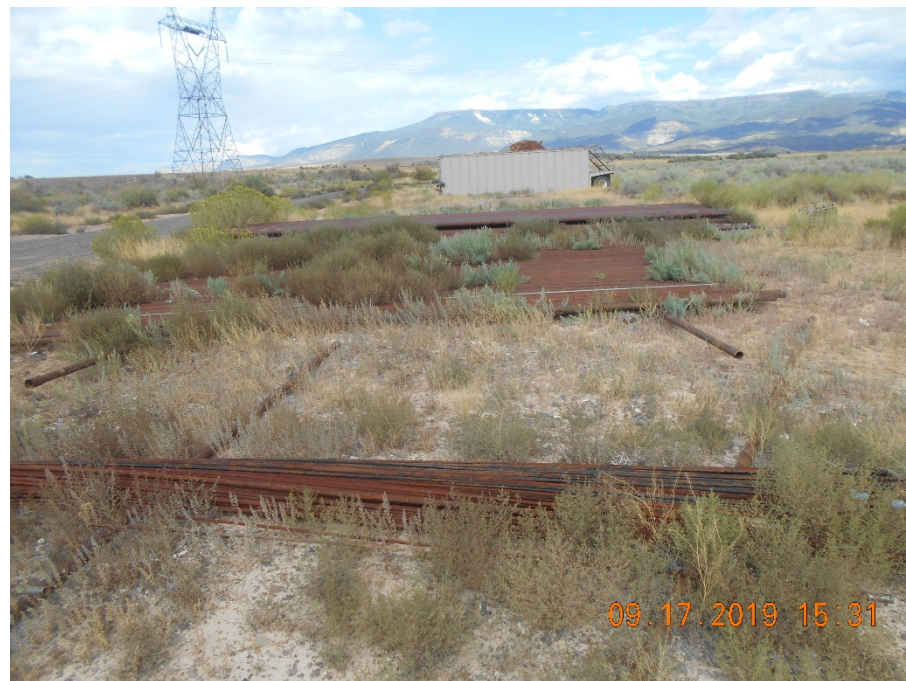
Various strings of tubing, casing and sucker rods. Located outside fenced area on access road NE of facility. Looking NE.