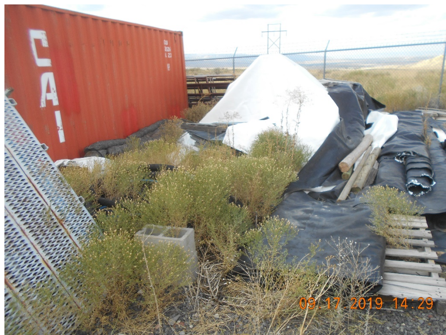
Rolls of liner materiel. Weeds