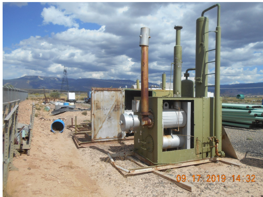
Unused well location separators