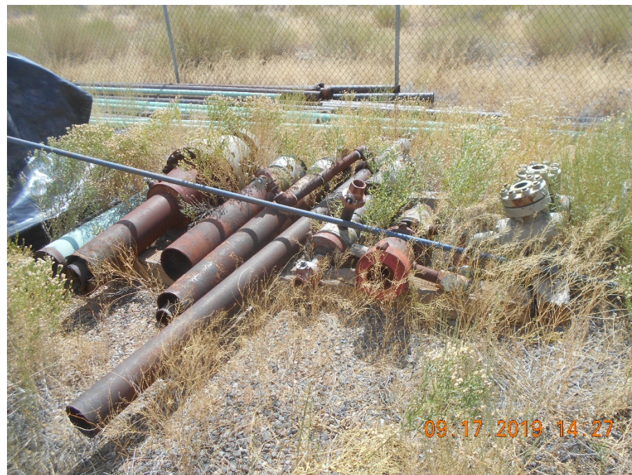
Assorted wellheads and pipe.