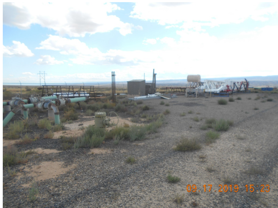
Inside entrance gate looking SE.