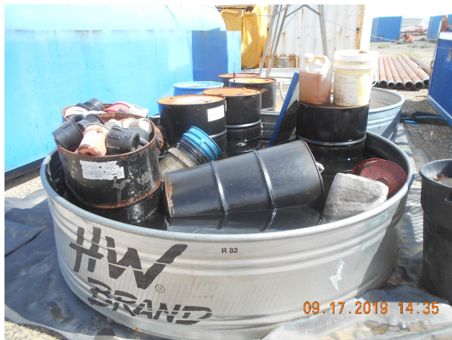
Storage of barrels of unknown chemicals.