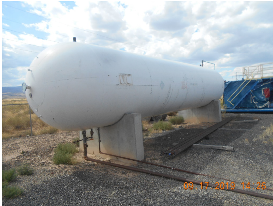
18,000 gal bullet tank on SW edge of facility. Looking W.