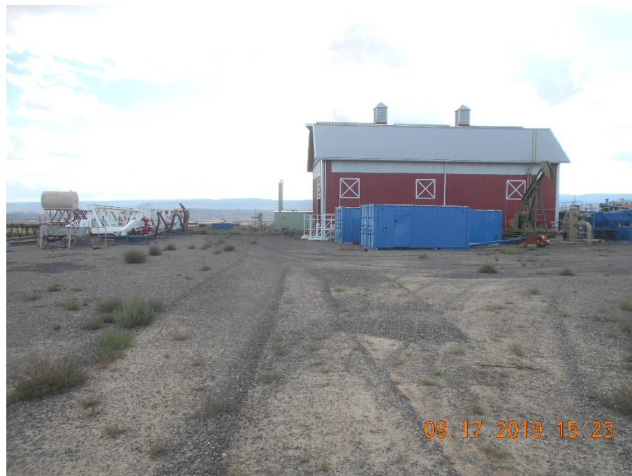
Inside entrance gate looking SW.