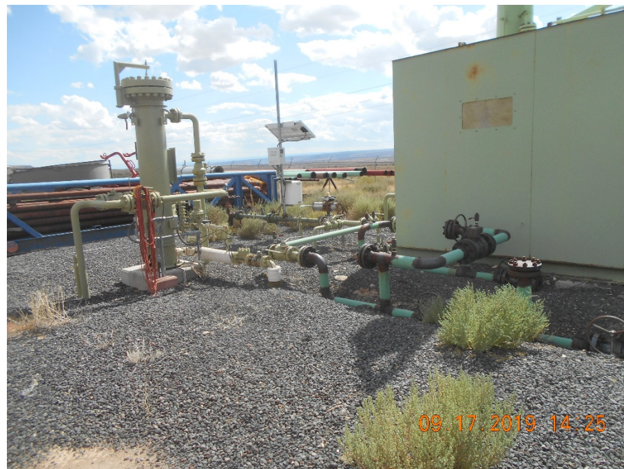
Separator/Dehydrator located near SE corner of facility. Looking S.