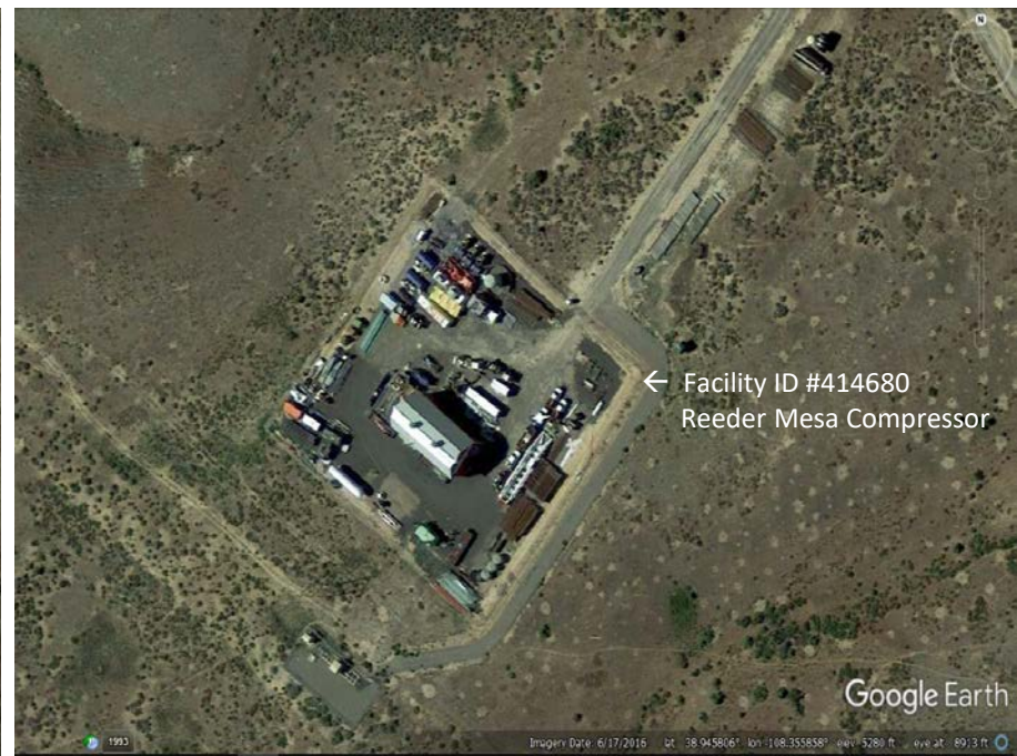
Google Earth view of Facility