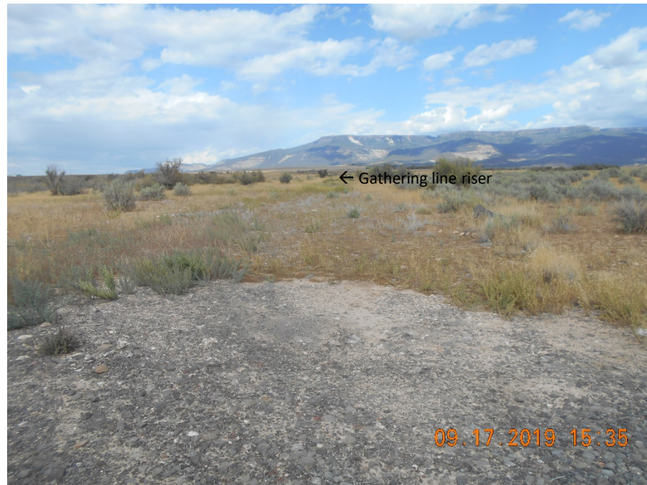
Gathering line right of way . Looking NE.