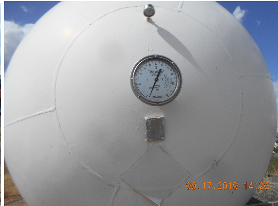
Gauge on 18,000 gal bullet tank on SW edge of facility