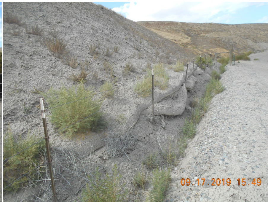
Gate at entrance of access road off Kannah Creek rd. Looking N. Eroded and failing wattles on W side.