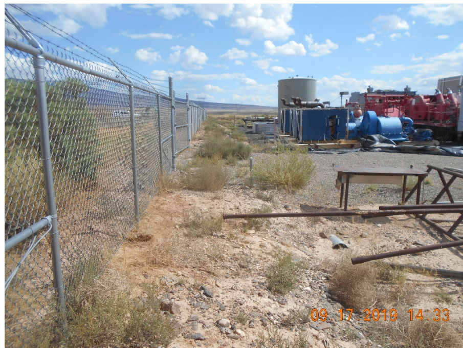
NW corner of fenced area looking SE