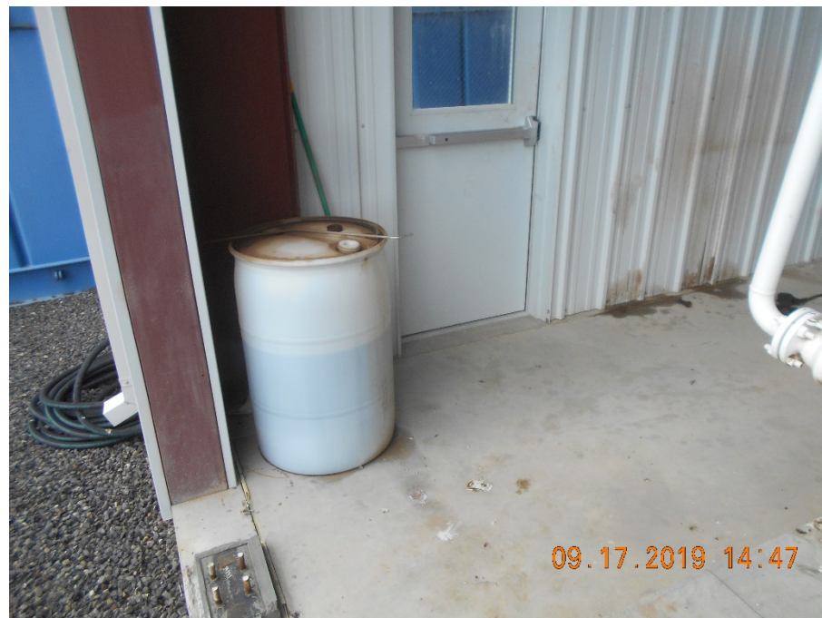
Barrels of unknown chemicals inside compressor building