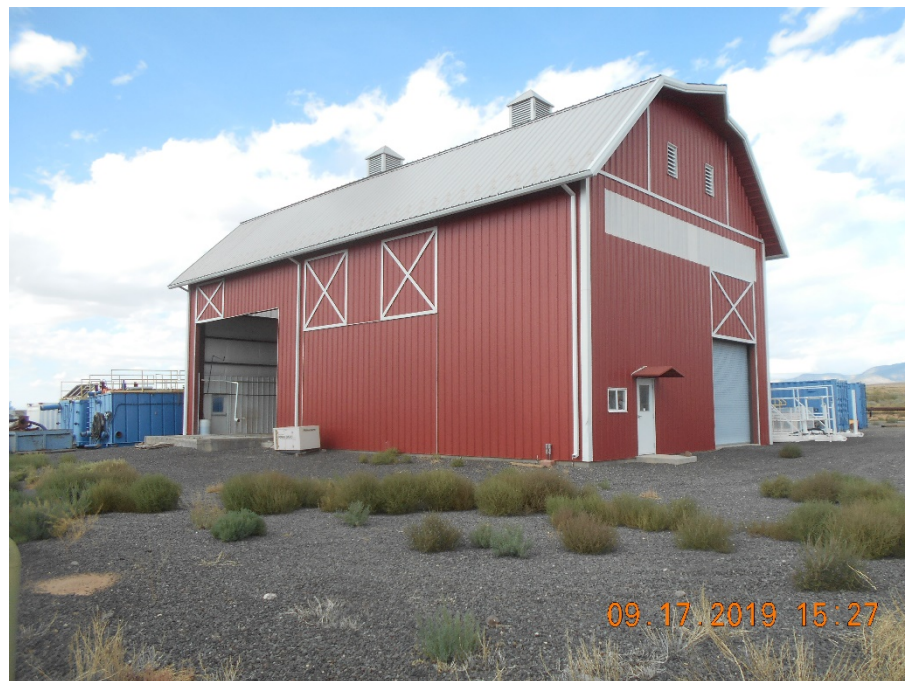
SW side of compressor building looking N. No compressor inside