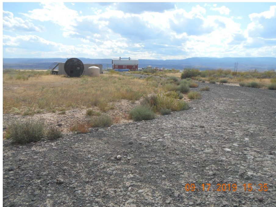
Approach to facility at gathering line crossing. Looking SW.