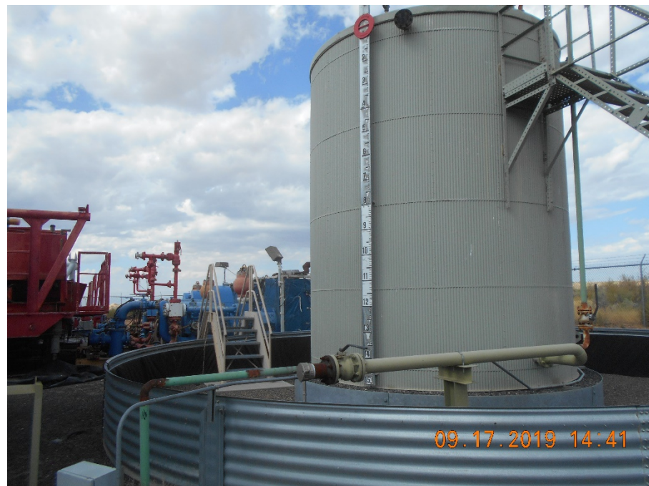
300 bbl tank with metal berms. Looking NW No labels.