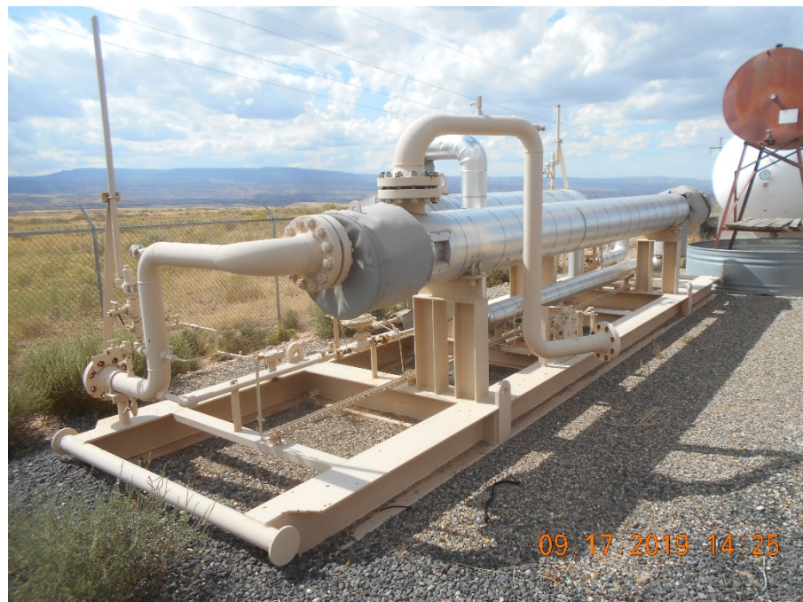
JT skid on SW edge of facility. Looking W.