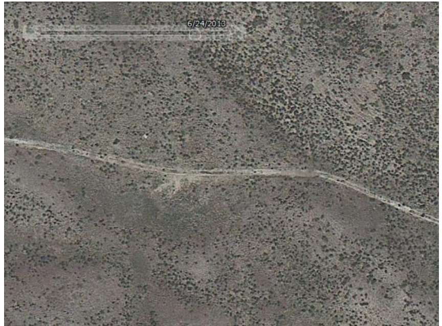
Photo 20: 2013 Google earth Aerial imagery. Photo shows access road, and area where erosion degradation was observed. See photo 15,16.