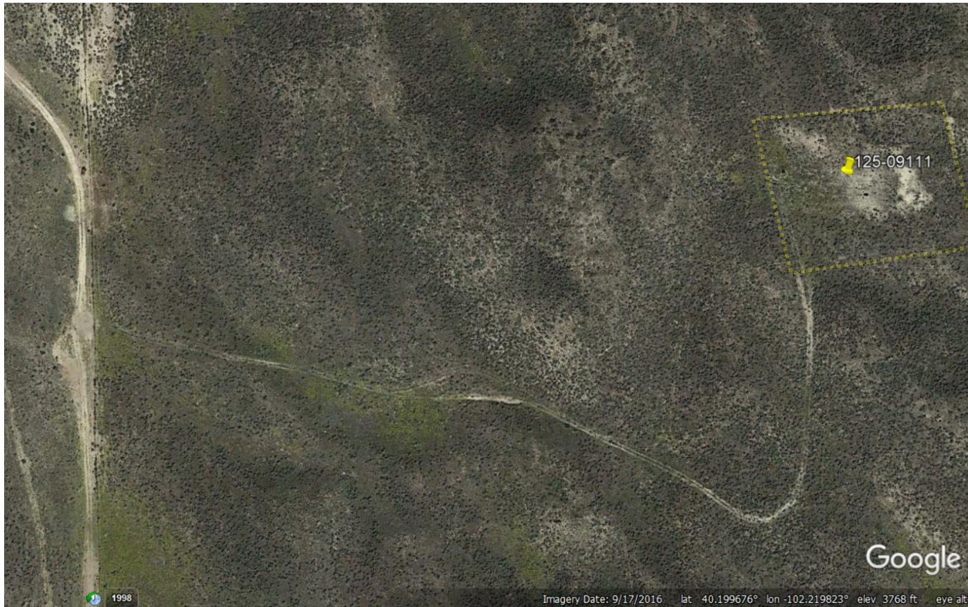
Photo 1: Most recent Google Earth aerial imagery (2016). Photo shows location and access road. Majority of access road has revegetated and is not immediately obvious in the field. Yellow dotted line shows area of initial pad disturbance based on the aerial image.