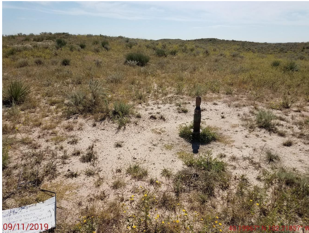
Photo 6: Photo taken from the south of the well, facing south. See comments under photo 4.