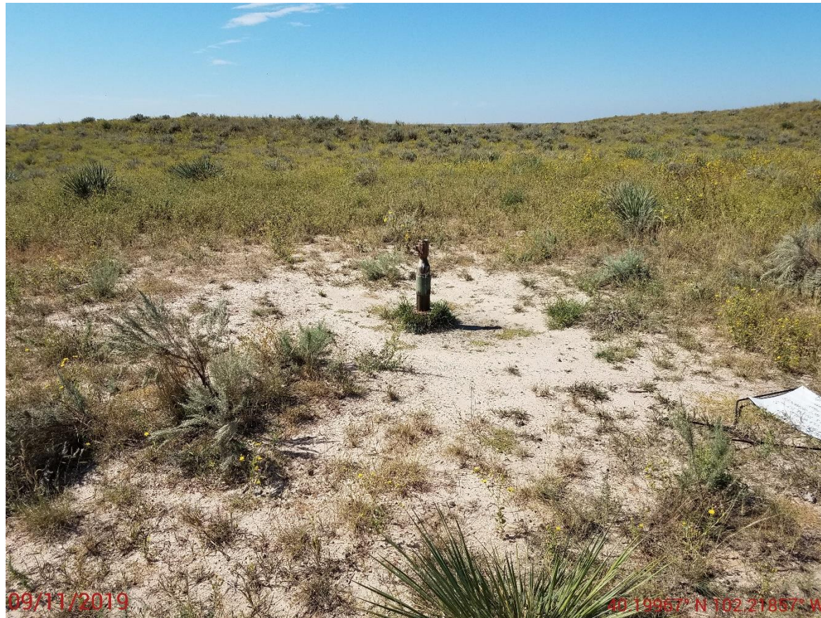
Photo 7: Photo taken from the south of the well, facing west. See comments under photo 4.