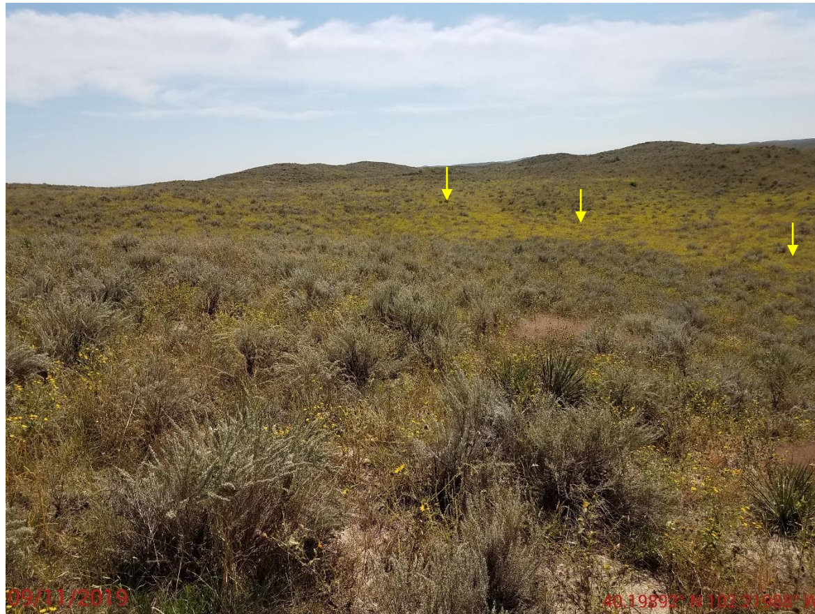
Photo 14: Photo taken from the adjacent lands west of the location. Photo shows the access road (yellow) to the location. Majority of access road has revegetated and was not immediately obvious in the field.