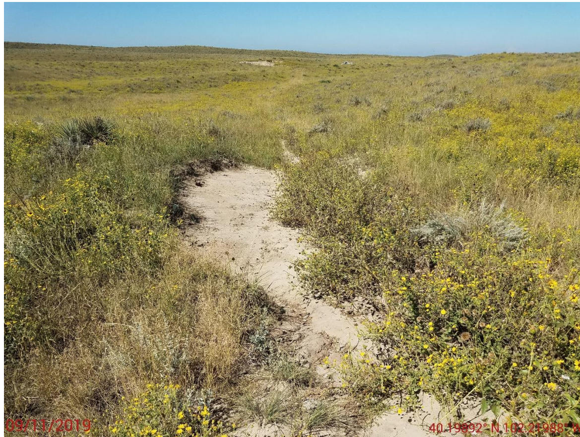
Photo 15: Photo taken from the access road, facing west. Photo shows erosion degradation along access road. See photo 13.