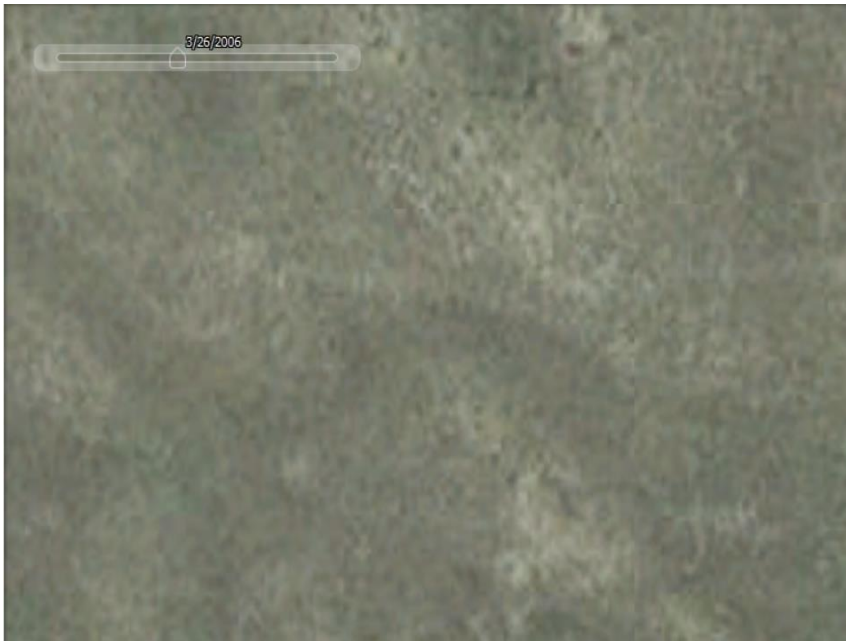
Photo 19: 2006 Google Earth aerial imagery. Photo shows areas prior to oil and gas disturbance. Note: No erosion degradation along the path of the access road is evident.