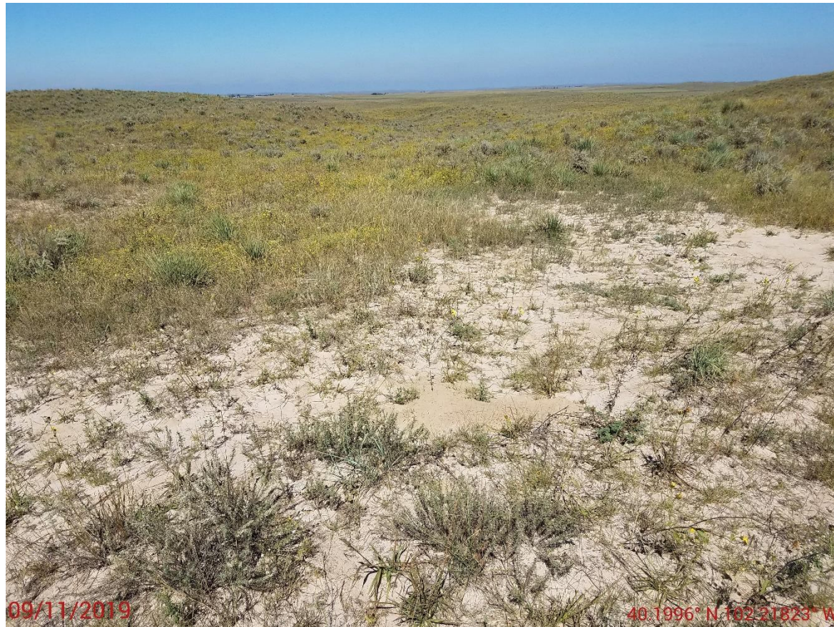
Photo 11: Photo taken from the southeast areas of the location. Photo shows areas where vegetation has not re-established as uniformly as the rest of the location. Areas to the east are predominantly exposed soils.