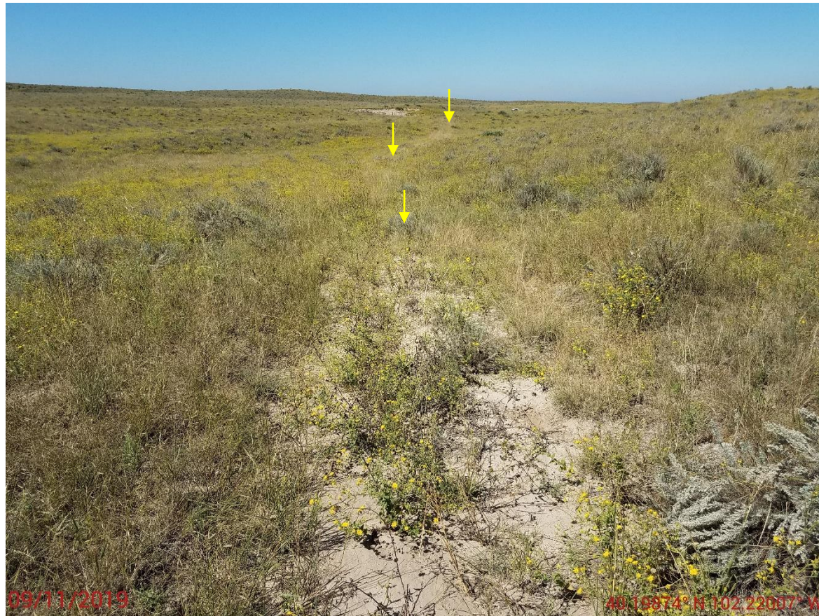
Photo 17: Photo taken from the access road, facing east. Photo shows the access road (yellow) to the location. Majority of access road has revegetated and was not immediately obvious in the field.