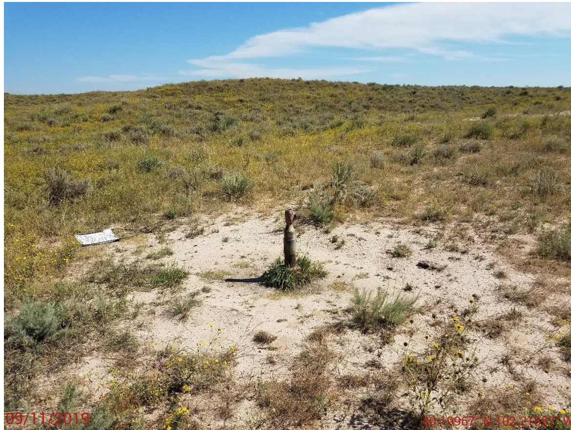
Photo 5: Photo taken from the south of the well, facing east. See comments under photo 4.