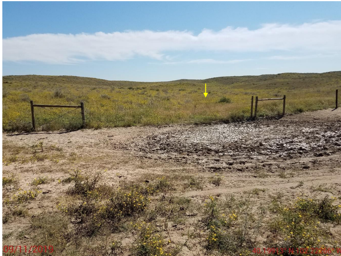
Photo 18: Photo shows area where the location's access road intersect with the main north/south access road.