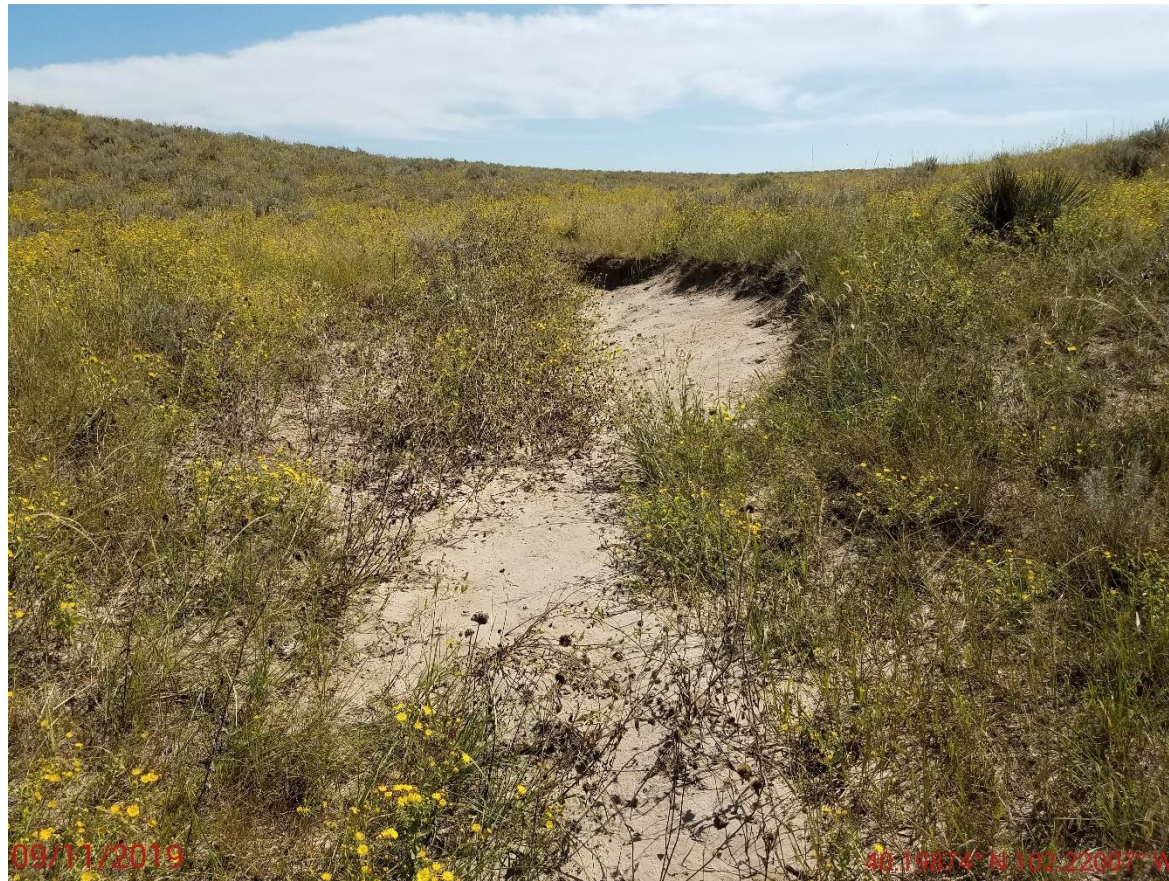
Photo 16: Photo taken from the access road, facing east. Photo shows erosion degradation along access road.