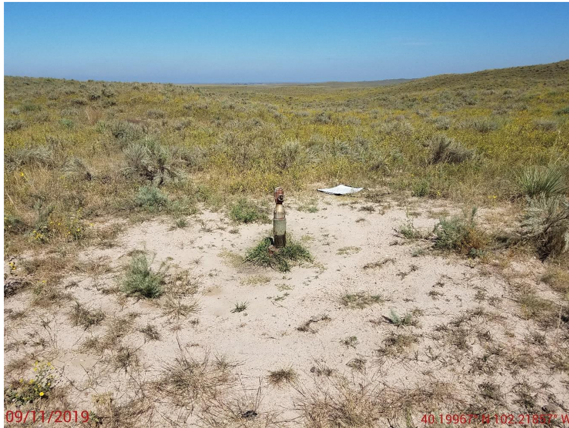
Photo 4: Photo taken from the south of the well, facing north. Photo shows well and pad. With exception to areas east and southeast of the well, the majority of the initial disturbance area has revegetated.