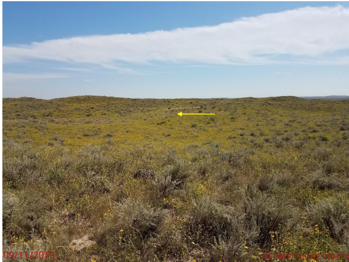
Photo 2: Photo taken from the west of the location, facing east. Photo provides an overview of the location. Arrow shows well location.