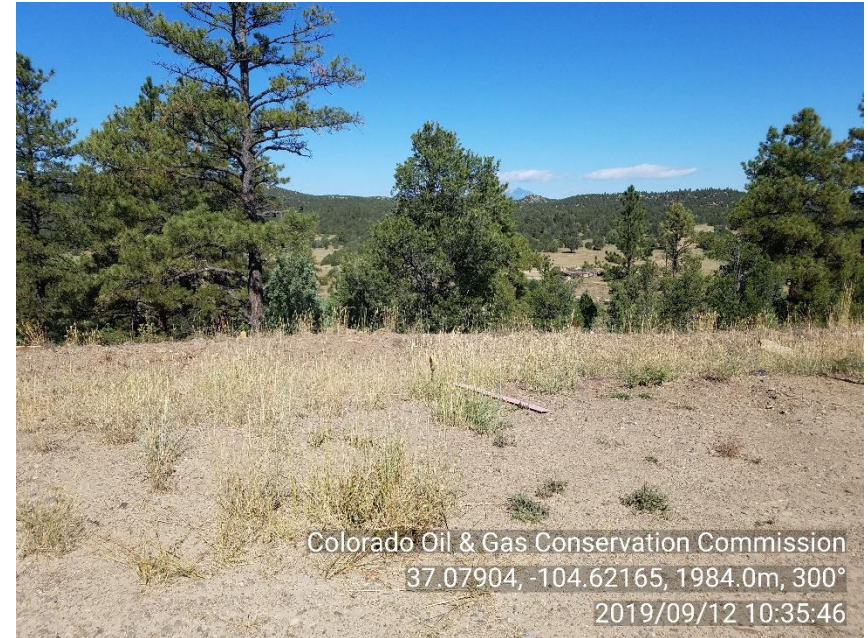
PHOTO 10: GUY LINE ANCHOR MARKER IS DOWN. Install proper guy line markers per Rule 1003.a