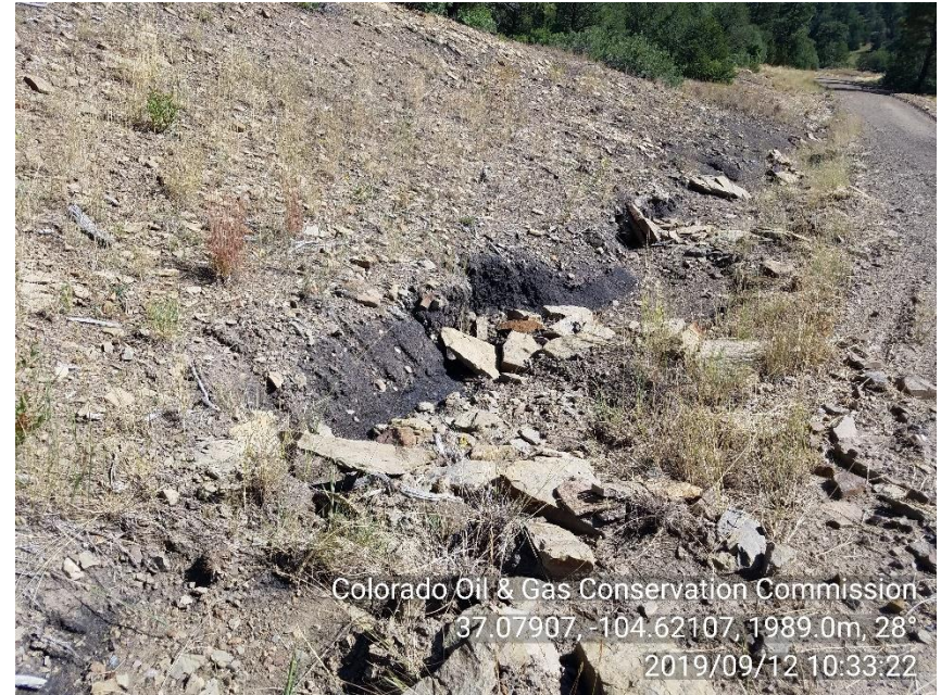
PHOTO 6: BMP'S HAVE FAILED AND APPEARS TO HAVE BEEN INSTALL IMPROPERLY. REPAIR EROSION REPAIR THE BMP'S THAT HAVE FAILED AND INSTALL MORE BMP'S TO COMPLY WITH RULE 1002.f. CA DATE 10-12-19