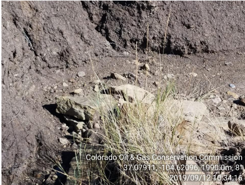
PHOTO 9: IMAGE OF OTHER IMPACTED AREAS ALONG ROW PERTAINING TO CA NOTED IN PHOTO 6.