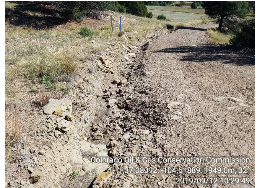
PHOTO 3: DITCH ON ROW NORTHEAST OF LOCTION IS ERODING NO BMP'S IN PLACE TO PREVENT DITCH FROM ERODING. REPAIR EROSION AND INSTALL BMP'S TO PREVENT MORE EROSION, COMPLY WITH RULE 1002.f. CA DATE 10-12-19