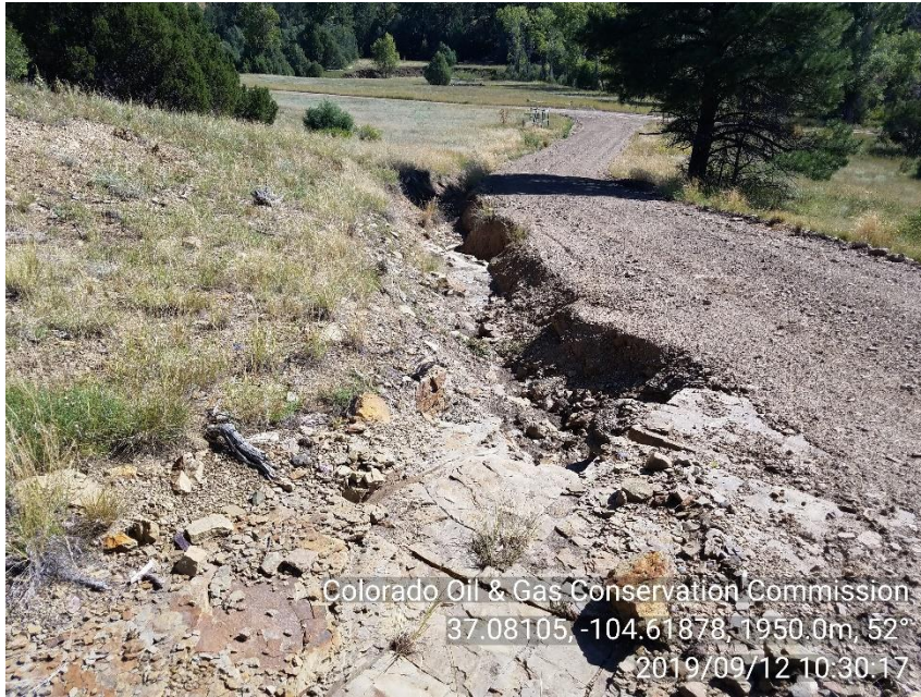
PHOTO 5: IMAGE OF OTHER IMPACTED AREAS ALONG ROW PERTAINING TO CA NOTED IN PHOTO 3.