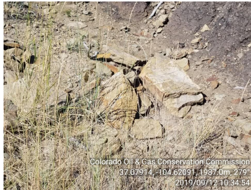
PHOTO 8: IMAGE OF OTHER IMPACTED AREAS ALONG ROW PERTAINING TO CA NOTED IN PHOTO 6.