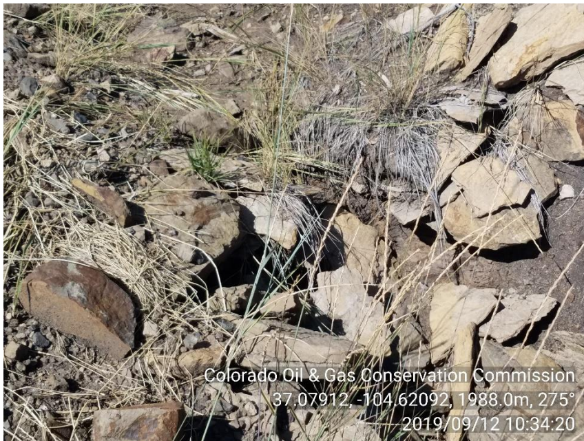
PHOTO 7: IMAGE OF OTHER IMPACTED AREAS ALONG ROW PERTAINING TO CA NOTED IN PHOTO 6.