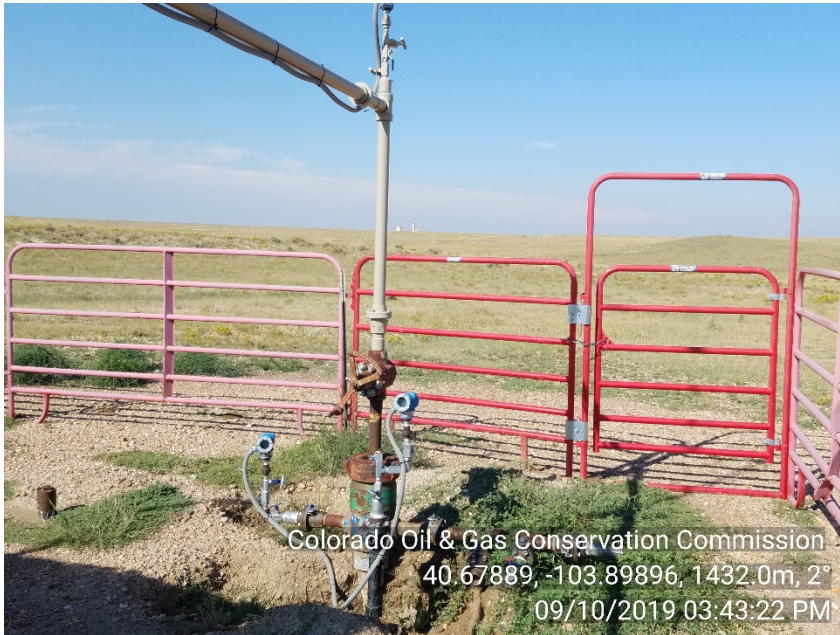
Photo #1 Lilli Unit 8-7 (05-123-13911) UIC - Injection Wellsite UIC Annual Inspection Not Injecting - Gas Shut-In | SI Weeds