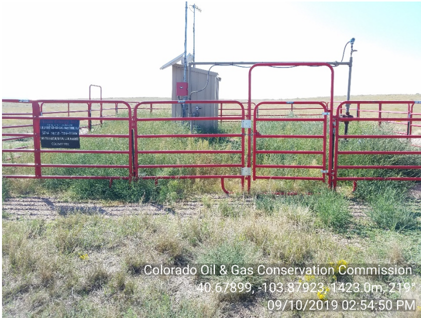
Photo #1 Lilli Unit 8-8 (05-123-13862) UIC - Injection Wellsite UIC Annual Inspection Not Injecting - Gas Shut-In | SI Weeds