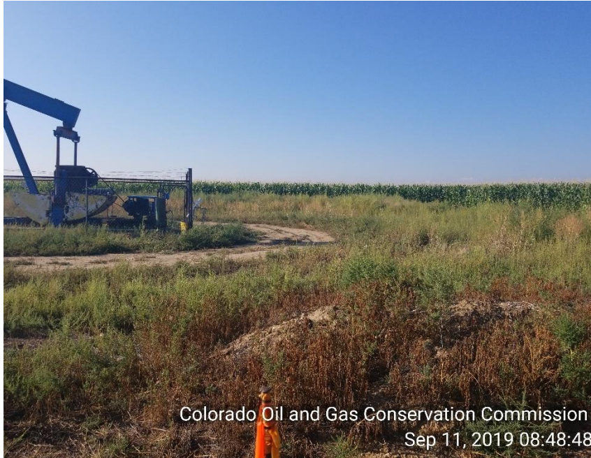
Photo 11 Weeds on location