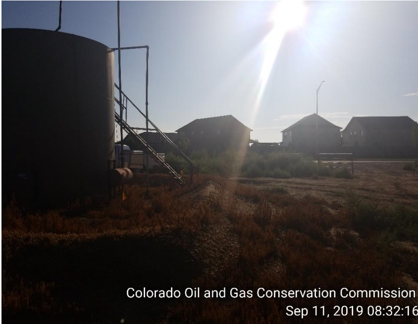
Colorado Oil and Gas Conservation Commission Sep 11, 2019 08:32:16