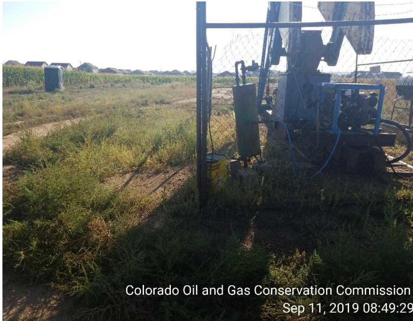
Colorado Oil and Gas Conservation Commission Sep 11, 2019 08:49:29