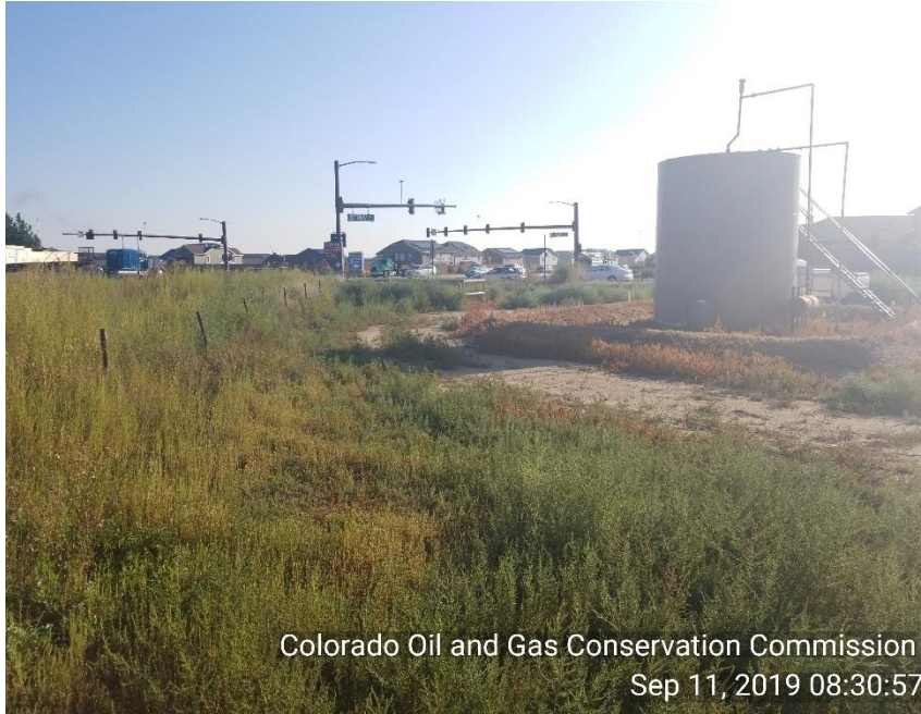
Photo 5 Weeds on location