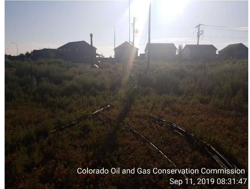
Photo 6 Weeds on location