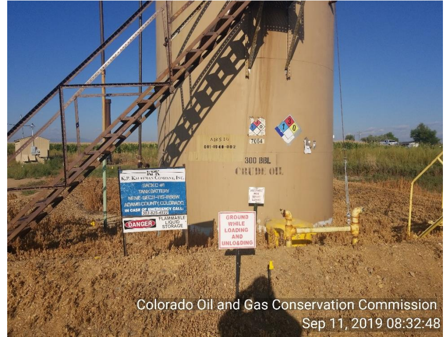
Colorado Oil and Gas Conservation Commission Sep 11, 2019 08:32:48