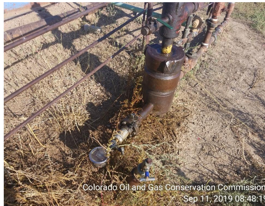
Photo 10 Stained soil around WH