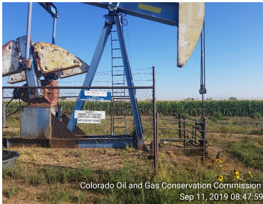
Photo 9 PU, WH and well head sign