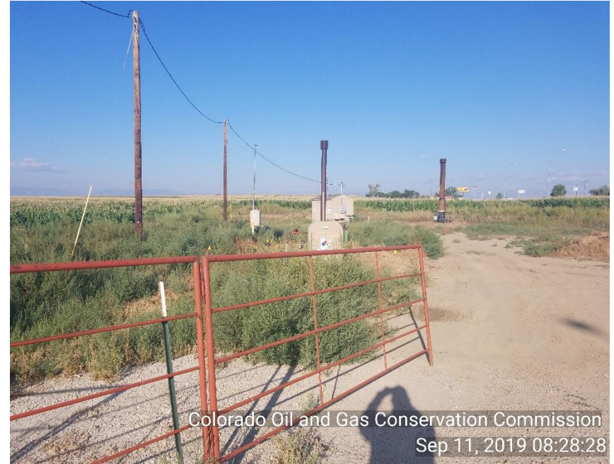
Photo 1 entrance to location. WEEDS. Gauge hatch and Pressure relief valve venting. See video