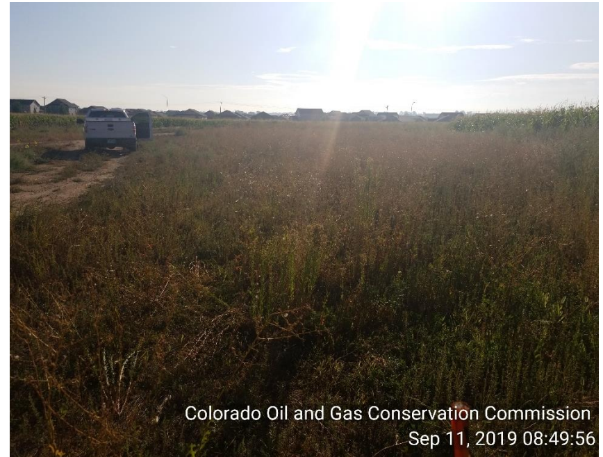
Colorado Oil and Gas Conservation Commission Sep 11, 2019 08:49:56