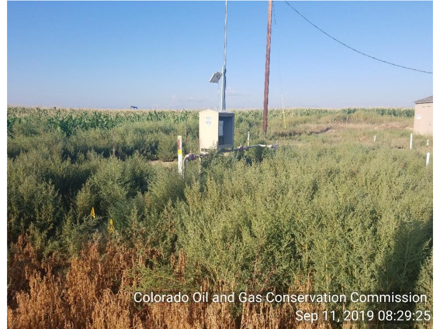
Photo 3 fuel gas to burner on separator is closed

Colorado Oil and Gas Conservation Commission Sep 11, 2019 08:29:25