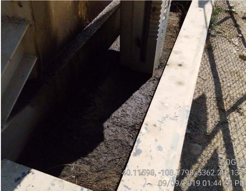
Photo 4. West side of pump jack.