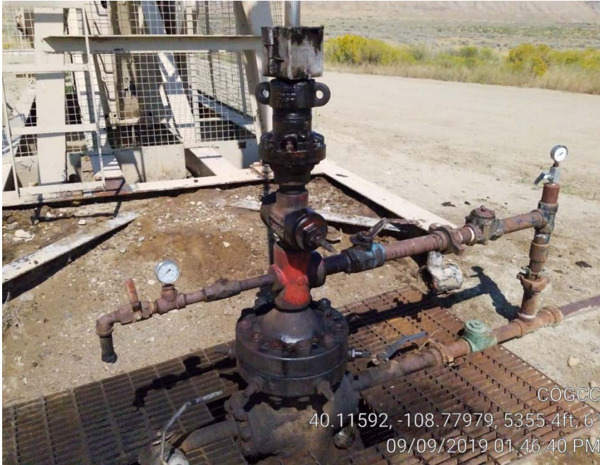
Photo 2. Well head & front of pump jack.