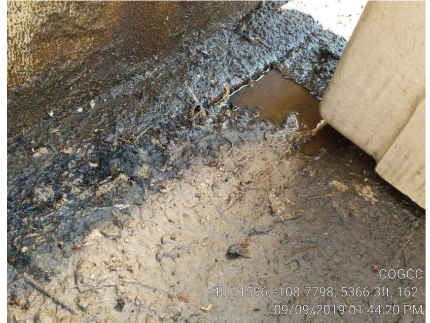
Photo 5. West side of pump jack & standing fluid on ground.