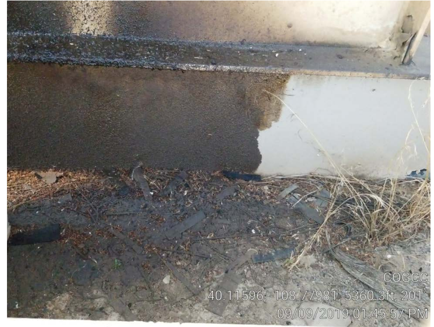
Photo 3. East side of pump jack.