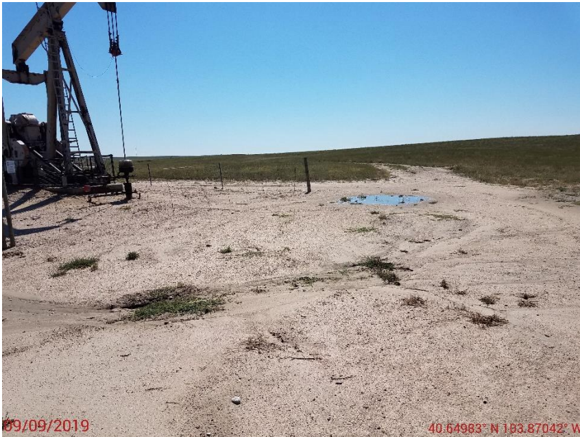
Photo 9: Photo taken from the northeast end of the location, facing southwest. See comments under photo 8.