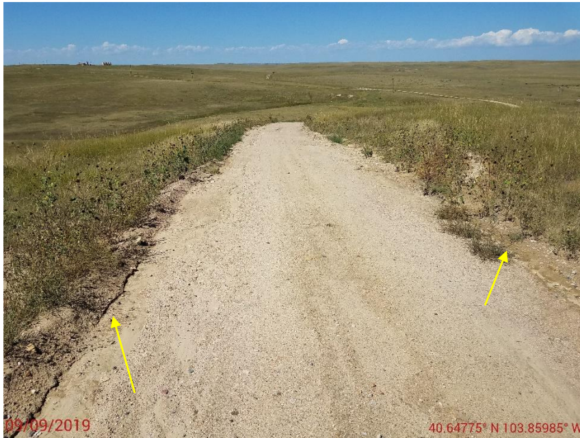
Photo 1: Photo taken from the main access road, facing northwest. Photo shows stormwater runoff has caused erosion degradation and sediment transport off the road.