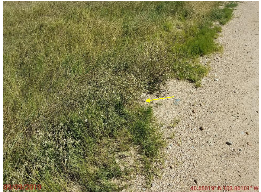
Photo 4: Photo shows noxious weeds (Diffuse knapweed, white flowers) remains evident along access road.