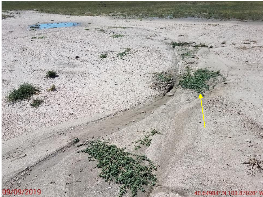
Photo 11: Photo taken from the north end of the location. Photo shows stormwater erosion and noxious weeds (puncture vine)