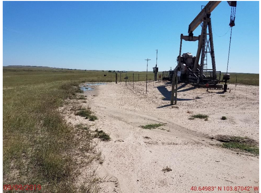
Photo 8: Photo taken from the northeast end of the location, facing south. Photo shows stormwater erosion degradation and ponding on the location. BMPs to allow for sediment laden-free stormwater discharge insufficient or missing.