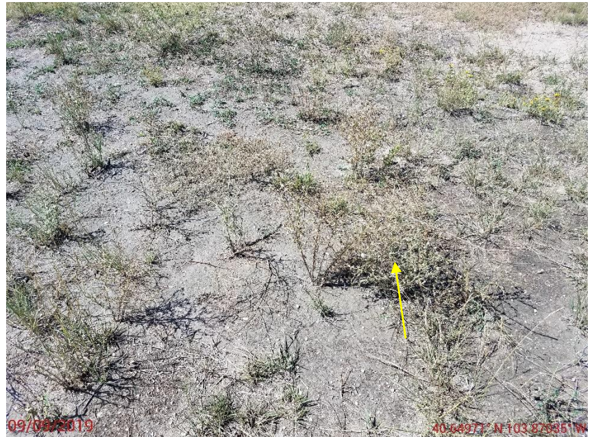
Photo 12: Photo taken from the west end of the location. Photo shows noxious weeds (diffuse knapweed, white flowers) remains evident on location.