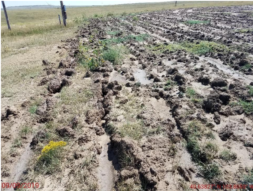
Photo 3: Photo taken from the northwest end of the location, facing east. See comments under photo 1.