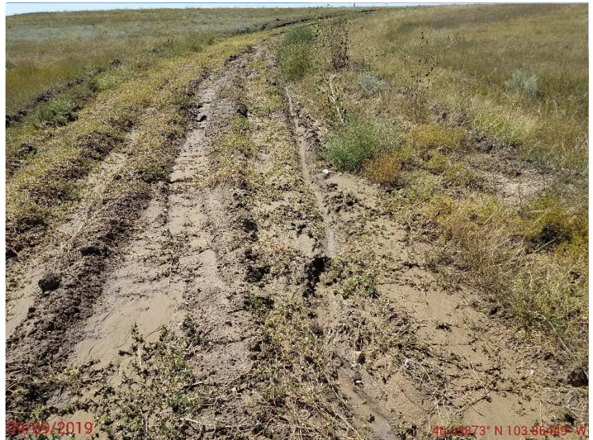
Photo 8: Photo taken from the access road. Photo shows erosion degradation observed on access road. Operator has not installed BMPs on location or access road.