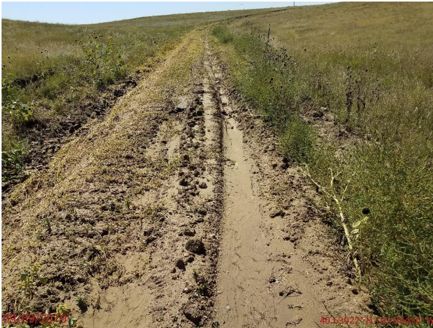
Photo 15: Additional photo of stormwater erosion degradation observed on access road. Areas of gully erosion forming. Photo also shows access road has not been recontoured or graded to that of the adjacent lands.