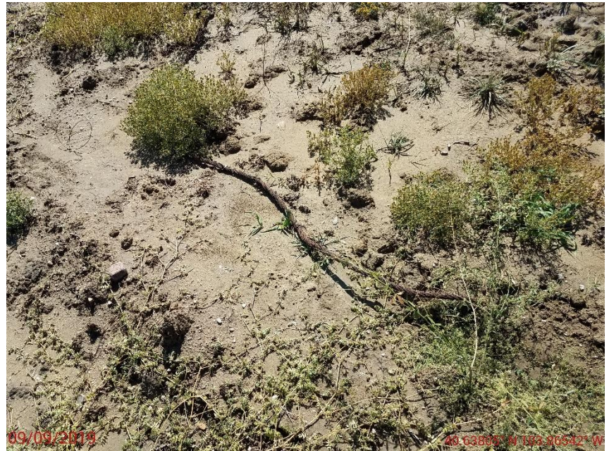
Photo 4: Photo taken from the southeast corner of the location. Photo shows trash debris (cable) remaining on location.