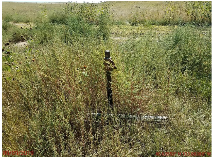
Photo 6: Photo taken from the access road at \sim 40.639486^\circ / -103.864066^\circ . Photo shows a riser remaining along access road; Surface equipment has not been removed.