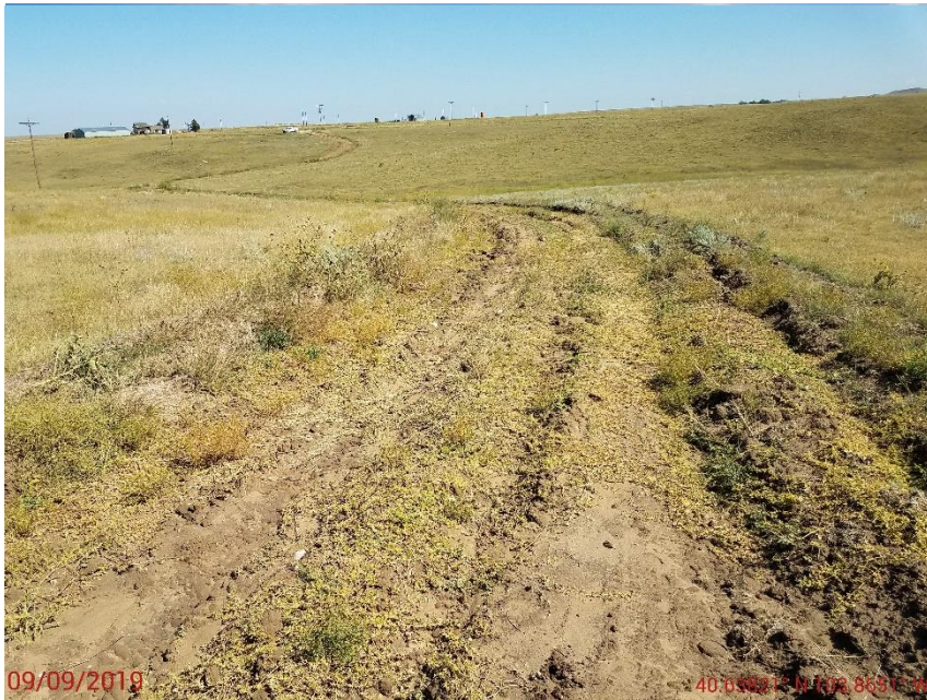
Photo 7: Photo taken from the access road on the east end of the location. Photo shows Tribulus terrestris has established over a majority of the access road.