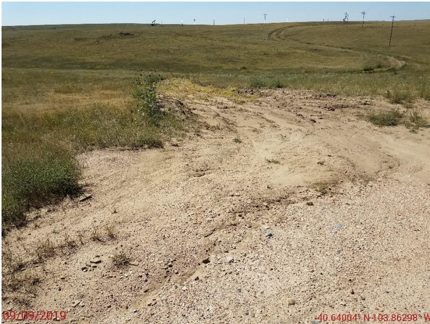
Photo 17: Photo taken from where access road intersects with main road, facing south. Photo shows erosion degradation observed on access road. Operator has not installed BMPs on location or access road.