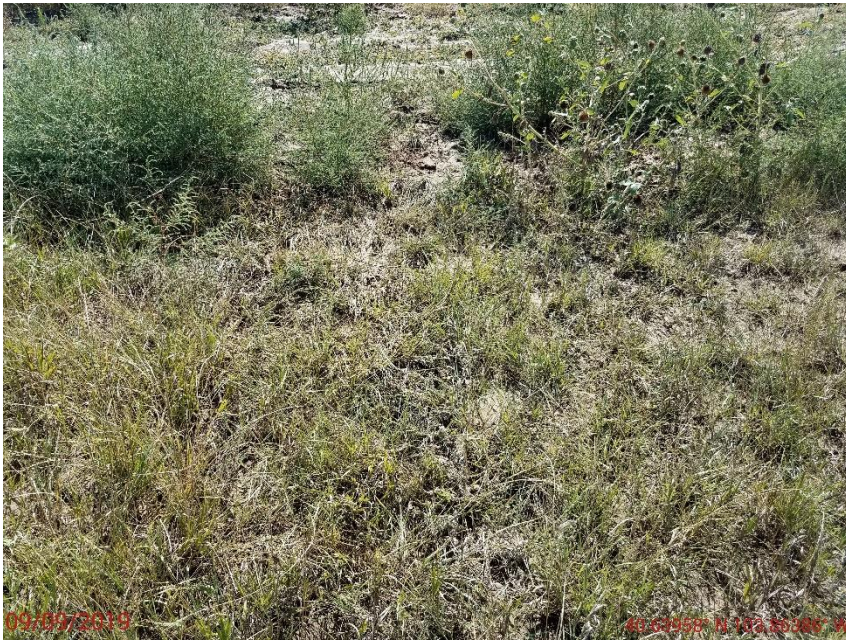
Photo 11: Photo taken from the access road. Photo shows area where stormwater runoff and sediment transport from the disturbance areas are evident.