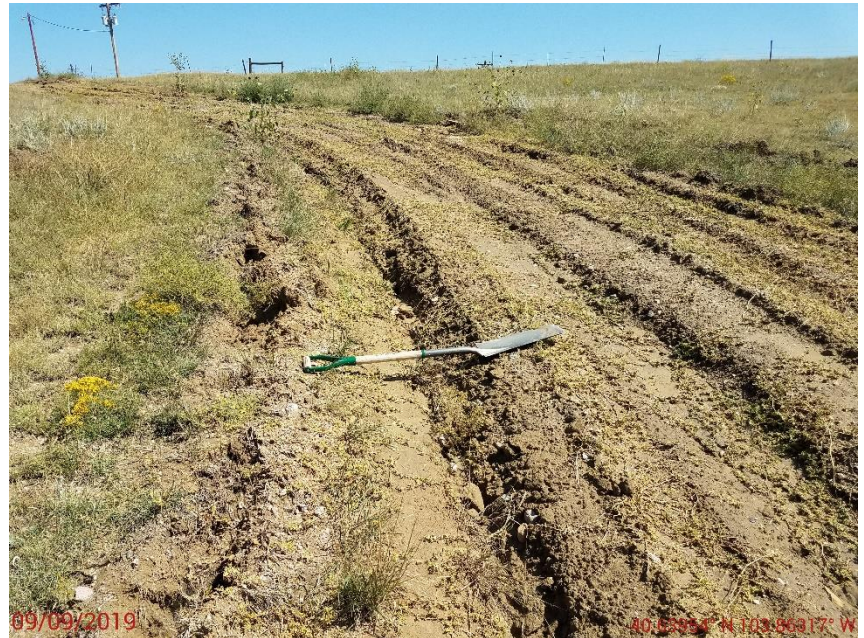
Photo 10: Additional photo of stormwater erosion degradation observed on access road. Areas of gully erosion forming. Shovel for reference.