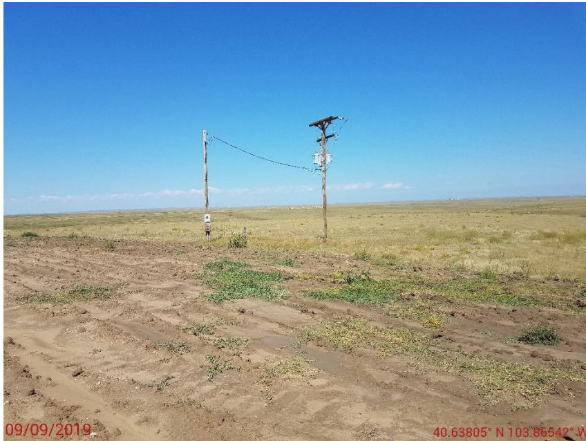
Photo 5: Photo shows utility poles remaining on the north end of the location. Surface equipment has not been removed.