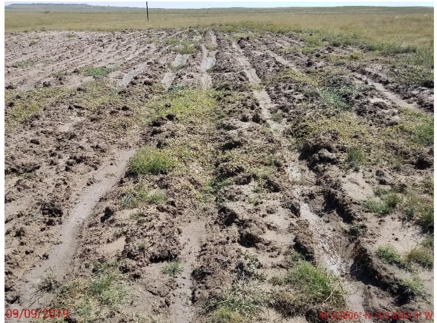
Photo 2: Photo taken from the southwest end of the location, facing east. See comments under photo 1.