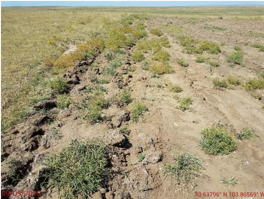
Photo 1: Photo taken from the southeast end of the location, facing west. Photo shows location does not appear to have been cross-ripped in accordance with 1000 series rules; location appears to have been ripped once, in one direction.