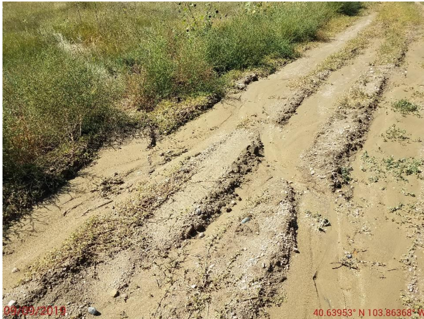
Photo 9: Additional photo of stormwater erosion degradation observed on access road.