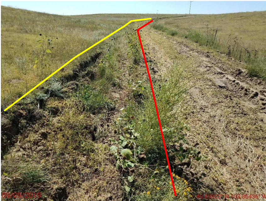
Photo 13: Photo taken from the access road, facing south. Photo shows access road (red) has not been recontoured or graded to that of the adjacent lands (yellow).