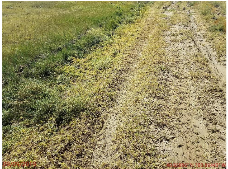
Photo 14: Photo taken from the access road. Photo shows Tribulus terrestris has established over a majority of the access road.