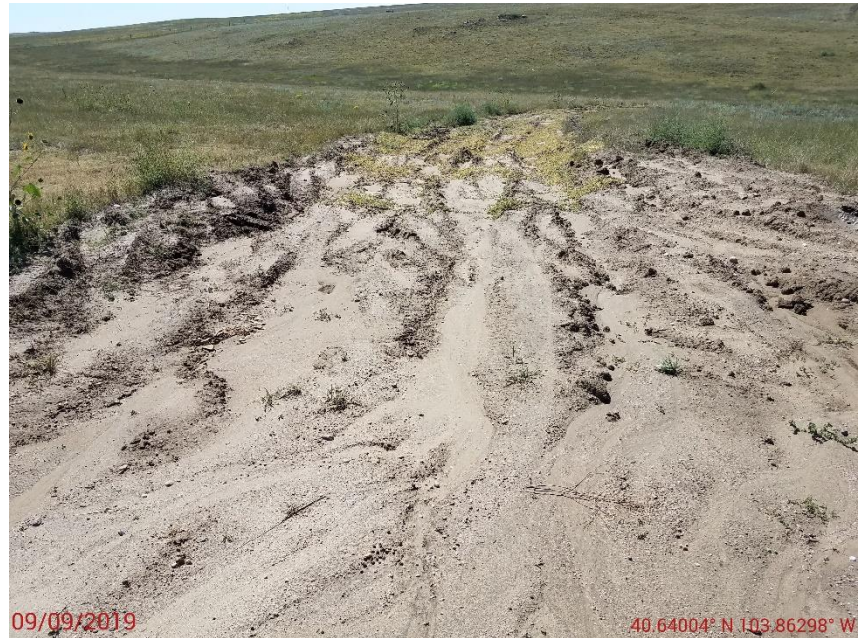
Photo 18: Photo taken from where access road intersects with main road, facing south. Photo shows erosion degradation observed on access road. Operator has not installed BMPs on location or access road.