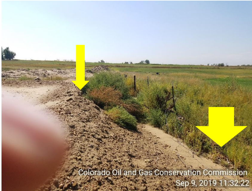
Photo 6 TNK BTRY secondary containment BMP in disrepair sediment being carried of BPM and into field. WEEDS.