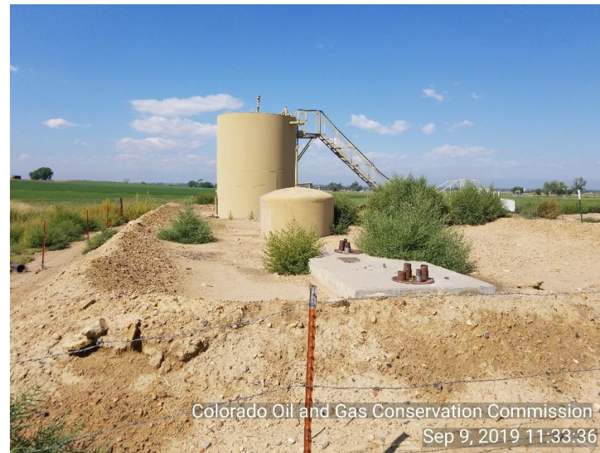
Photo 4 TNK BTRY WEEDS.