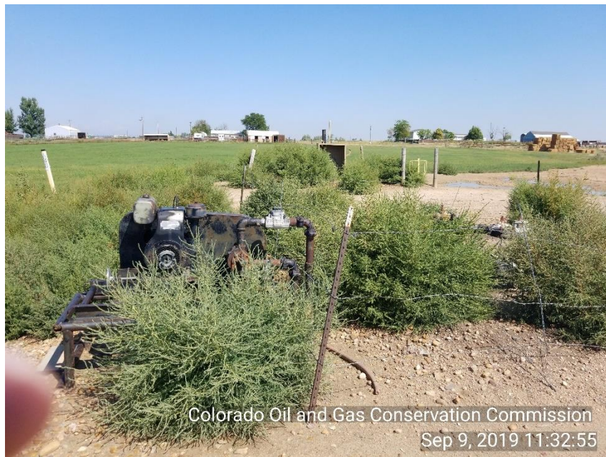
Photo 7 Re-circ pump WEEDS.