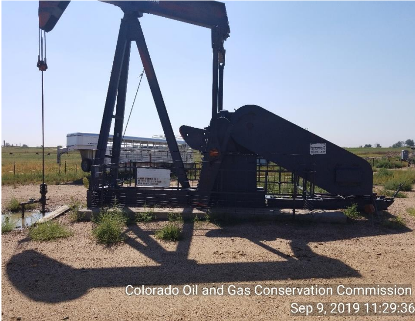
Photo 1 WH sign faded not legible. Well head can visible see and hear what appears to be gas leaking in and around packing.