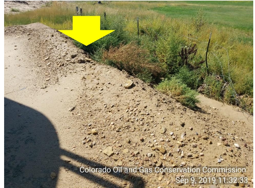
Photo 7 TNK BTRY secondary containment BMP in disrepair sediment being carried of BPM and into field. WEEDS.