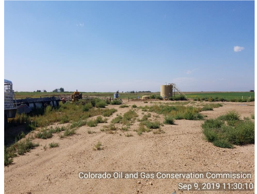
Photo 2 location pic WEEDS .