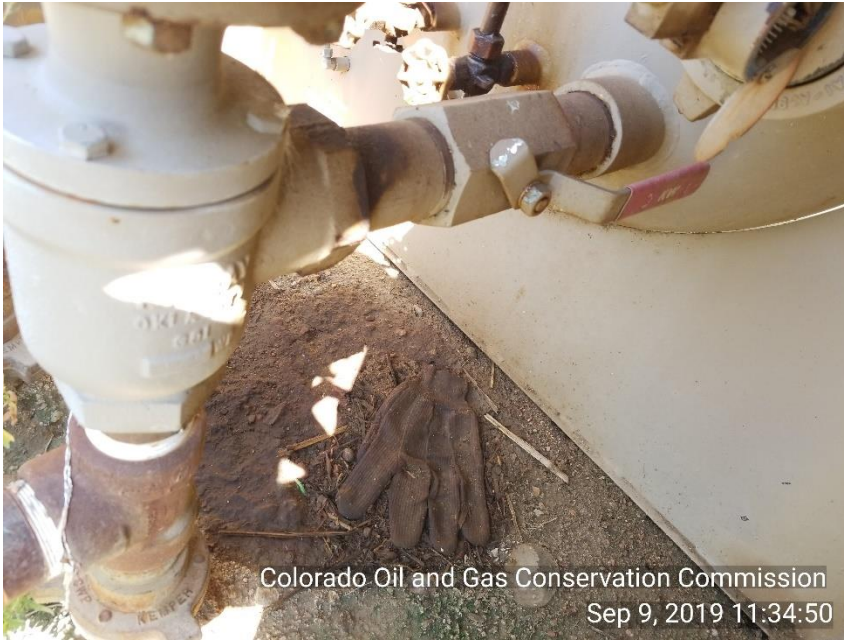
Photo 9 Mechanical issue and stained soil inside separator.