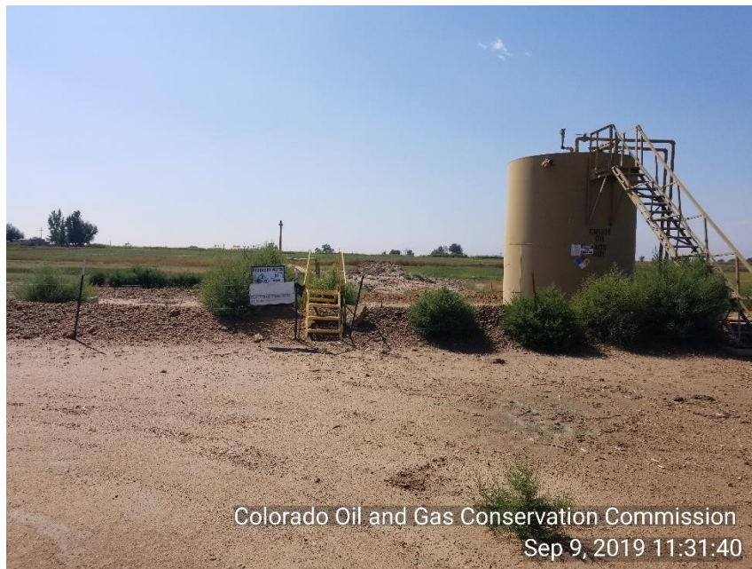
Photo 5 TNK BTRY. BTRY sign faded not legible. WEEDS.