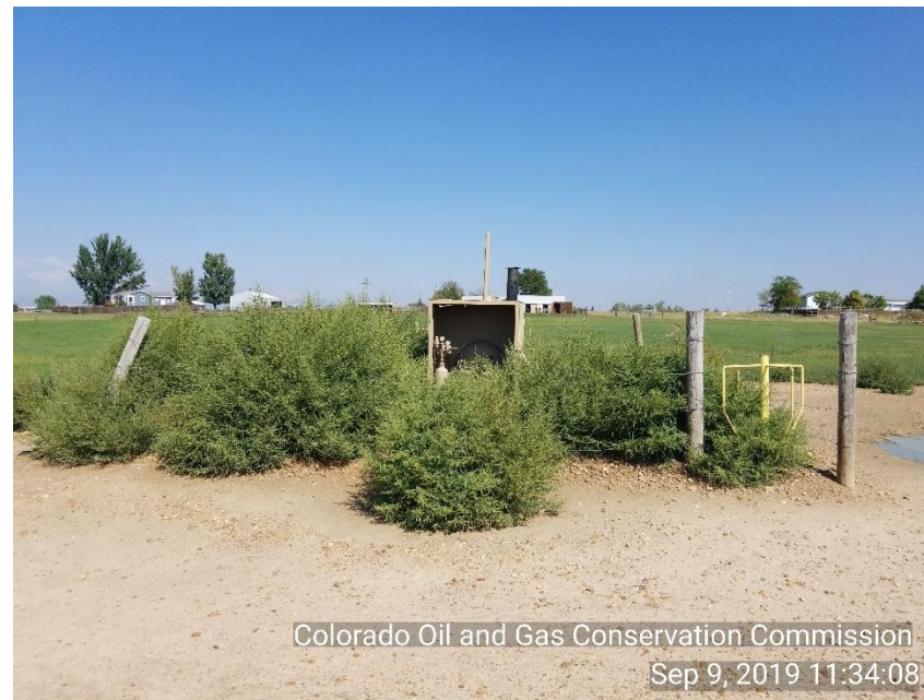
Photo 8 Separator WEEDS.