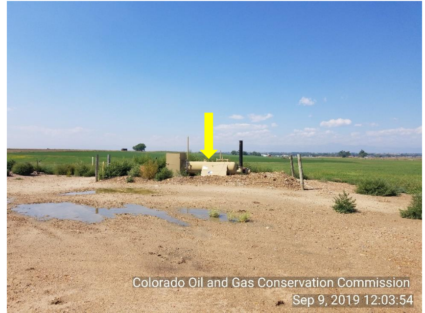
Photo 10 Trash: Separator door laying on ground next to separator. WEEDS.