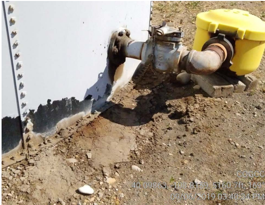
Photo 12. Stained soil next to tank.