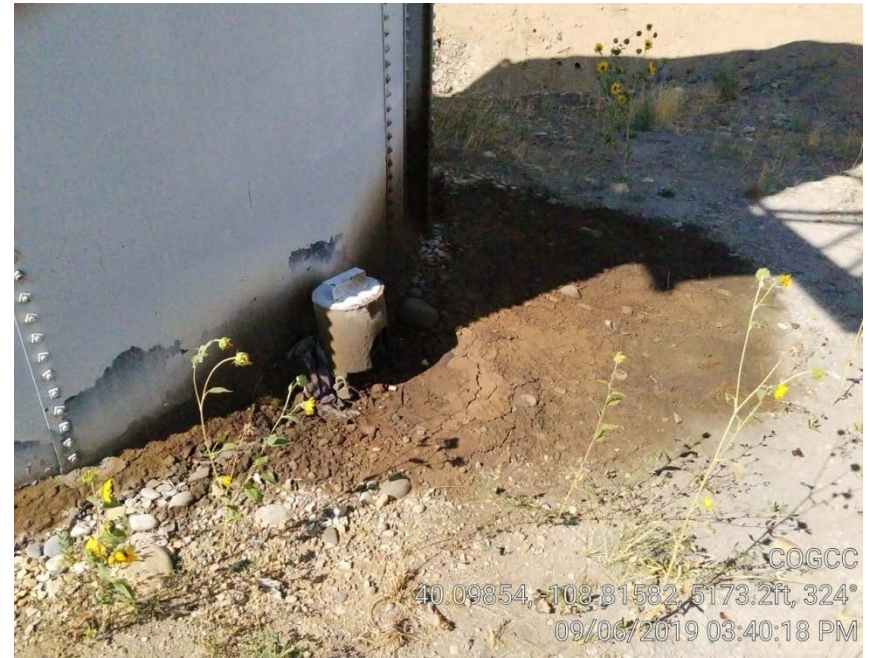
Photo 11. Stained soil next to tank.