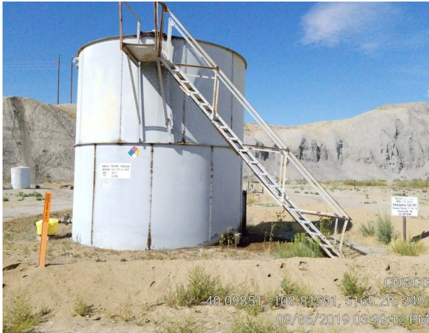
Photo 10. Tank battery.