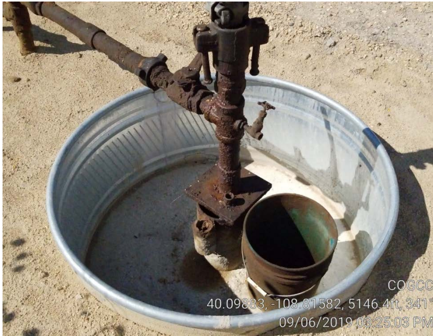
Photo 4. Well head - Stagner 2.