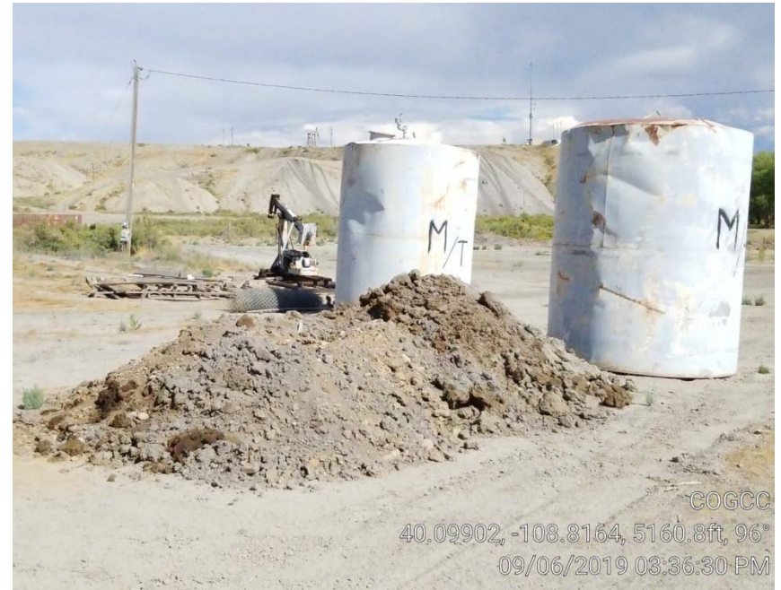
Photo 13. Dirt pile with stained soil.