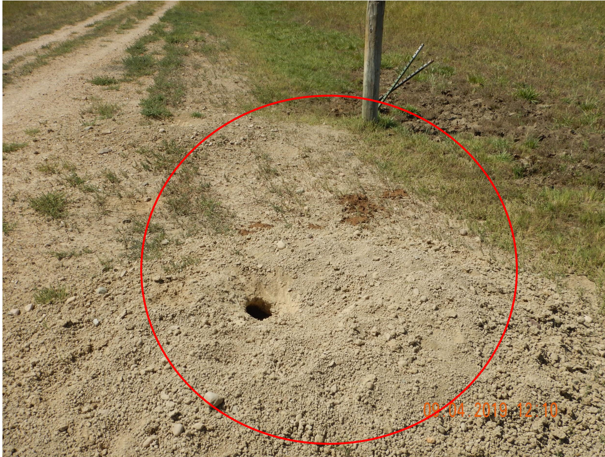
Photo 4. Photo taken from the northern location, facing West. Photo illustrates Prairie dog establishment. See comments under Photo 3.