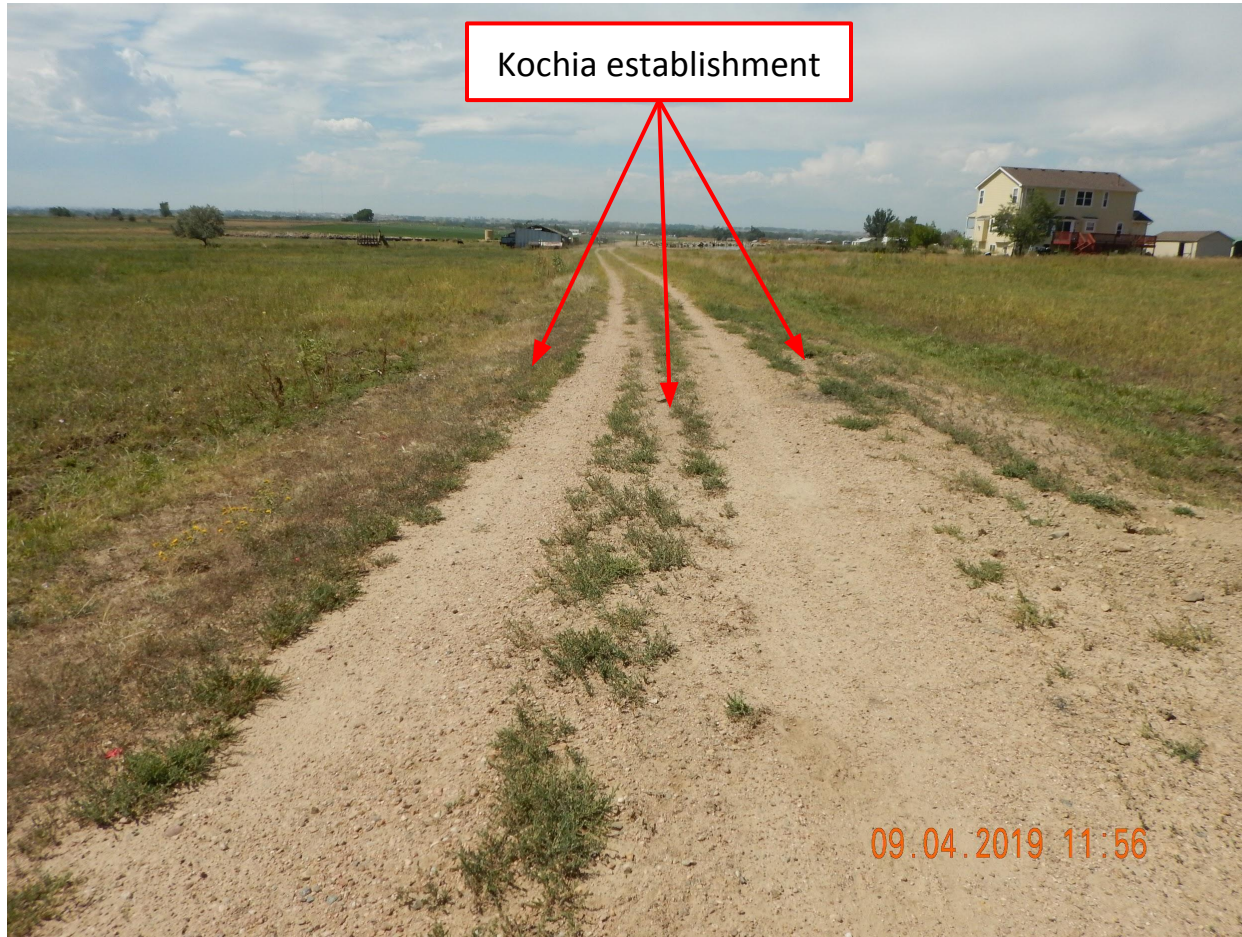
Photo 2. Photo taken from the location, facing West along the access road. Photo illustrates Kochia establishment (darker green vegetation) along the access road. Operator shall perform revegetation activities to comply with Rule 1003 standards.