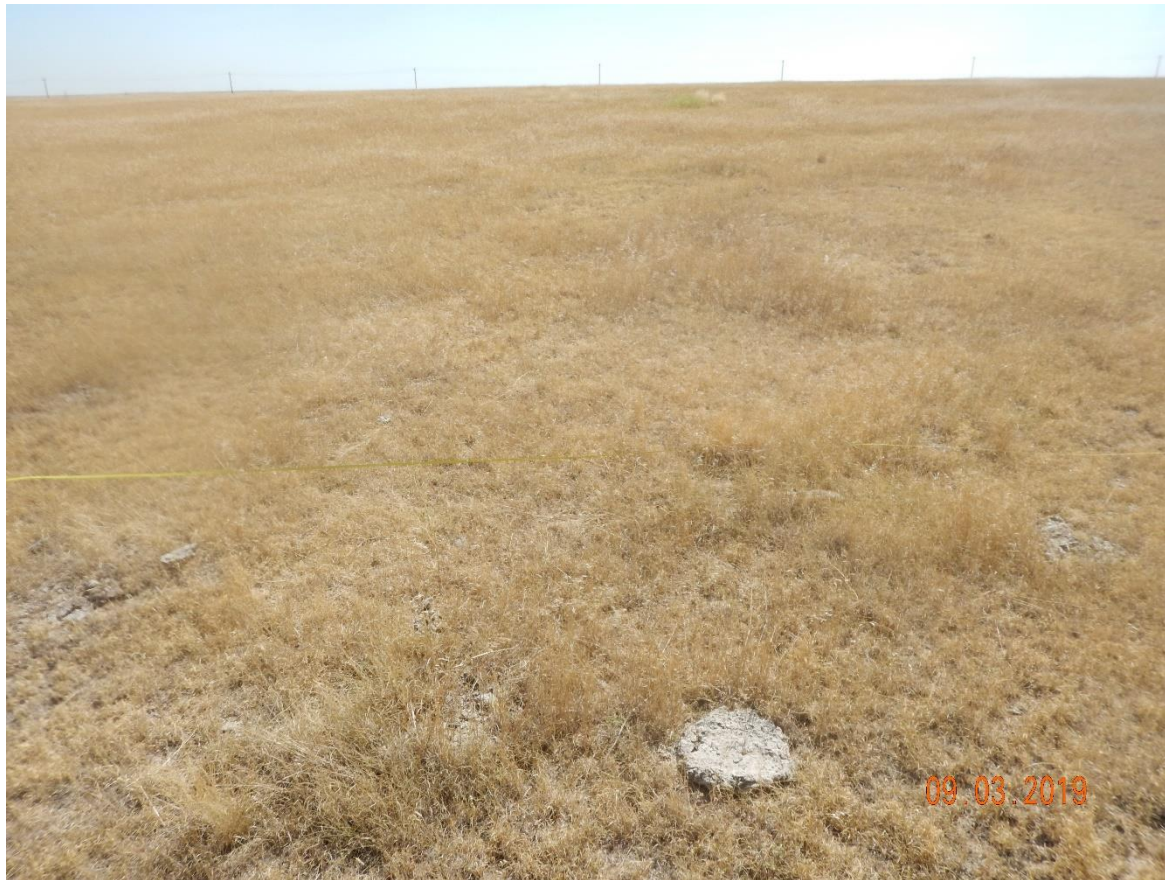
Photo 7: Photo of the 50 th point for the reference area transect, facing south. Photo shows vegetation over the reference area.