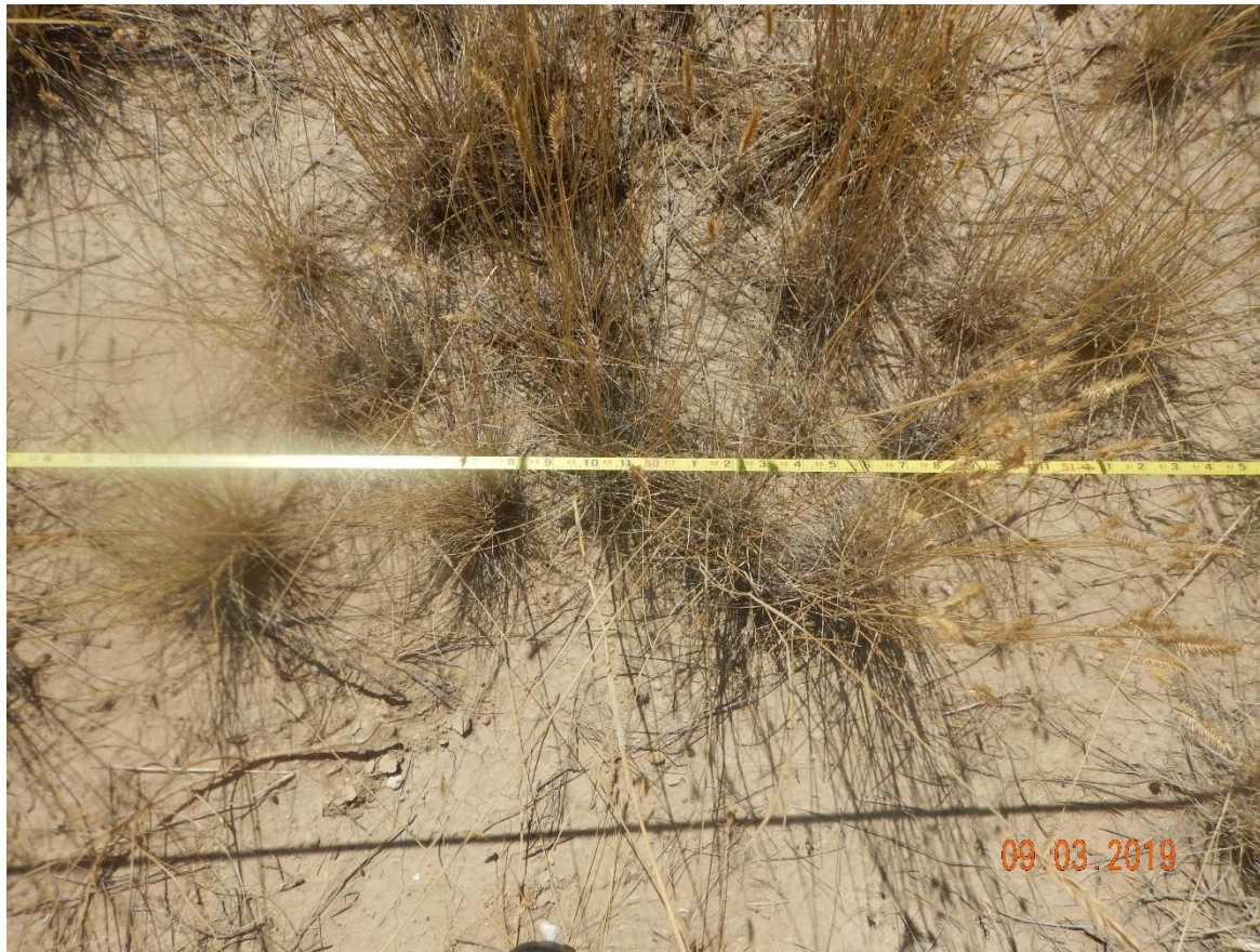
Photo 4: Photo of the 50 th point for the disturbance area transect. Photo shows vegetation over the disturbance area.