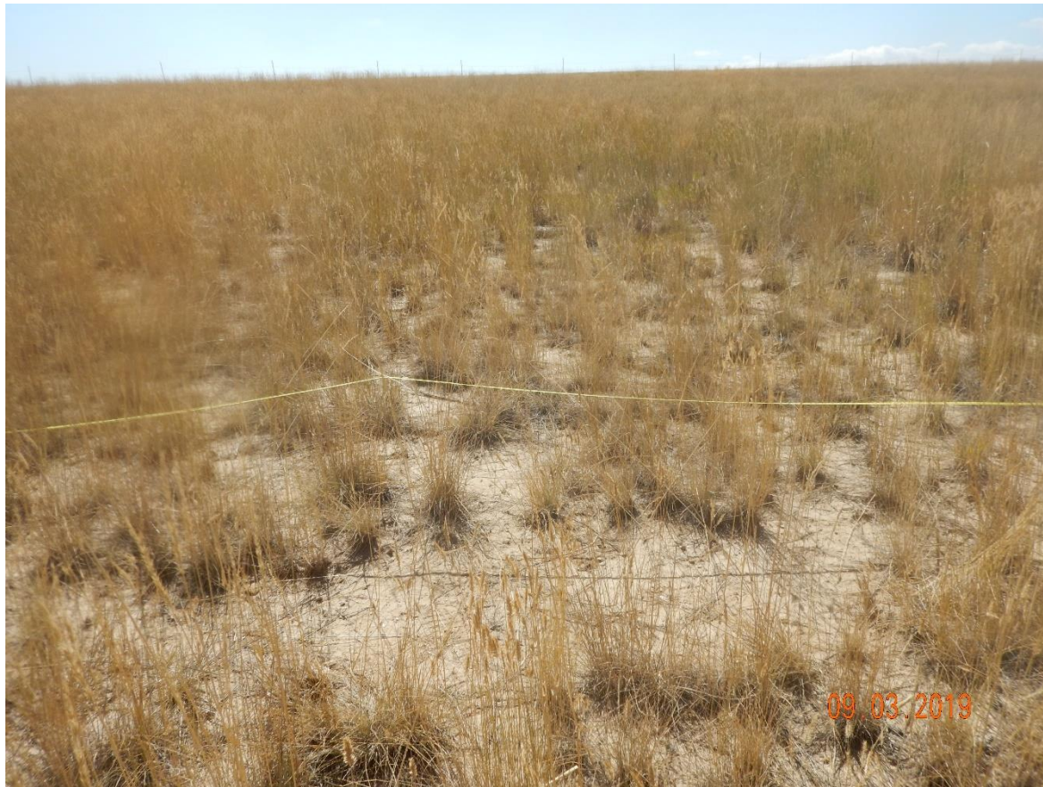
Photo 3: Photo of the 50 th point for the disturbance area transect, facing southwest. Photo shows vegetation over the disturbance area.