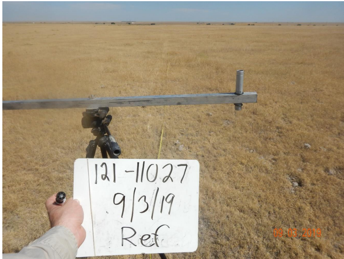
Photo 6: Photo taken from the adjacent reference area, facing east. Photo shows starting point for the reference area transect. Photo shows vegetation over the reference area.