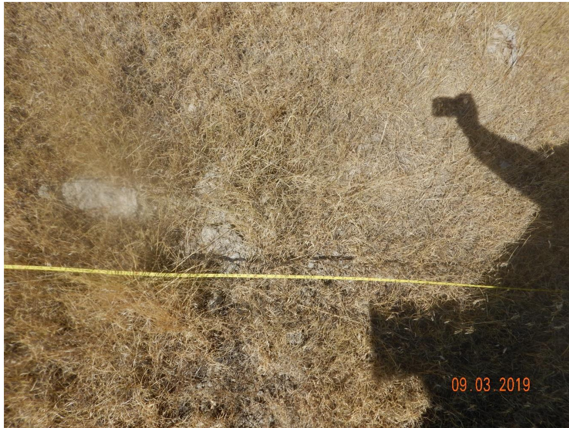
Photo 9: Photo of the 50 th point for the reference area transect. Photo shows vegetation over the reference area.