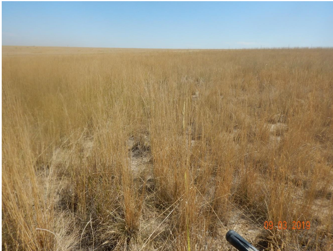
Photo 5: Photo taken from the location, facing southeast. Photo shows end point for the disturbance area transect. Photo shows vegetation over the disturbance area.