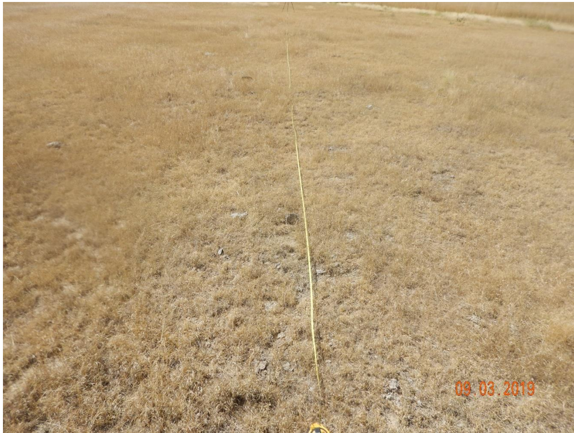
Photo 10: Photo taken from the adjacent reference area, facing west. Photo shows the end point for the reference area transect. Photo shows vegetation over the reference area.