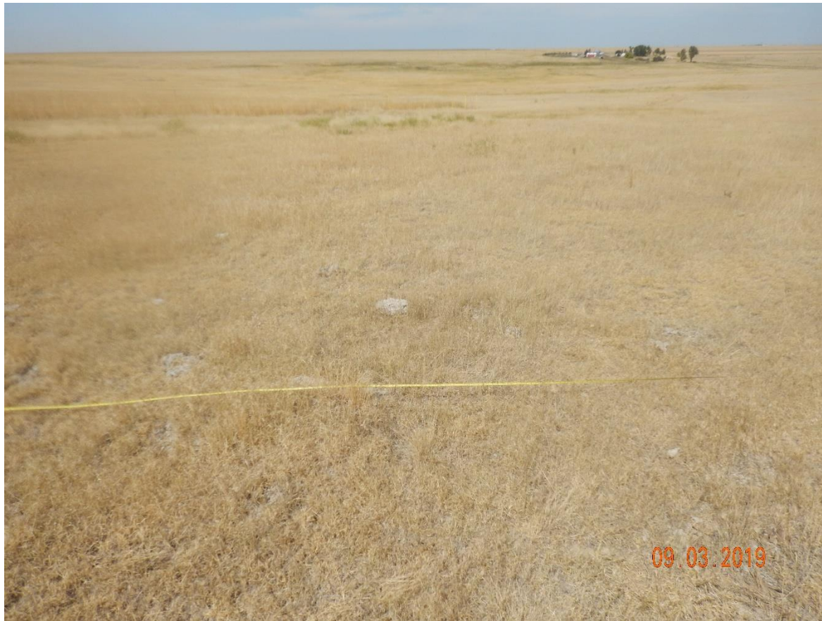
Photo 8: Photo of the 50 th point for the reference area transect, facing north. Photo shows vegetation over the reference area.