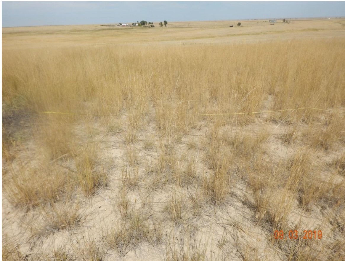
Photo 2: Photo of the 50 th point for the disturbance area transect, facing northeast. Photo shows vegetation over the disturbance area.