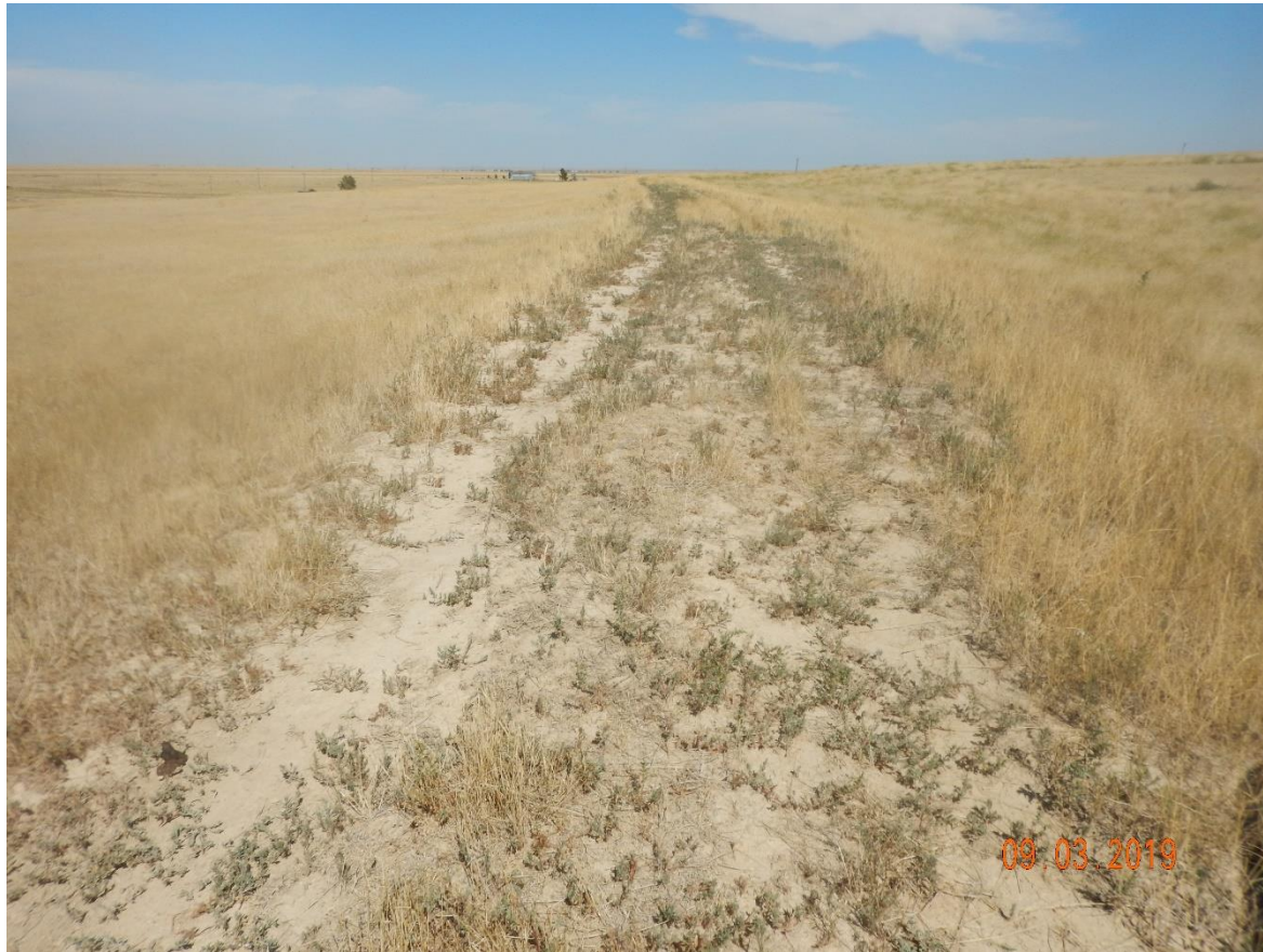
Photo 11: Photo taken from the access road, facing east. Photo shows large sections of the access road remains bare and exposed soil.