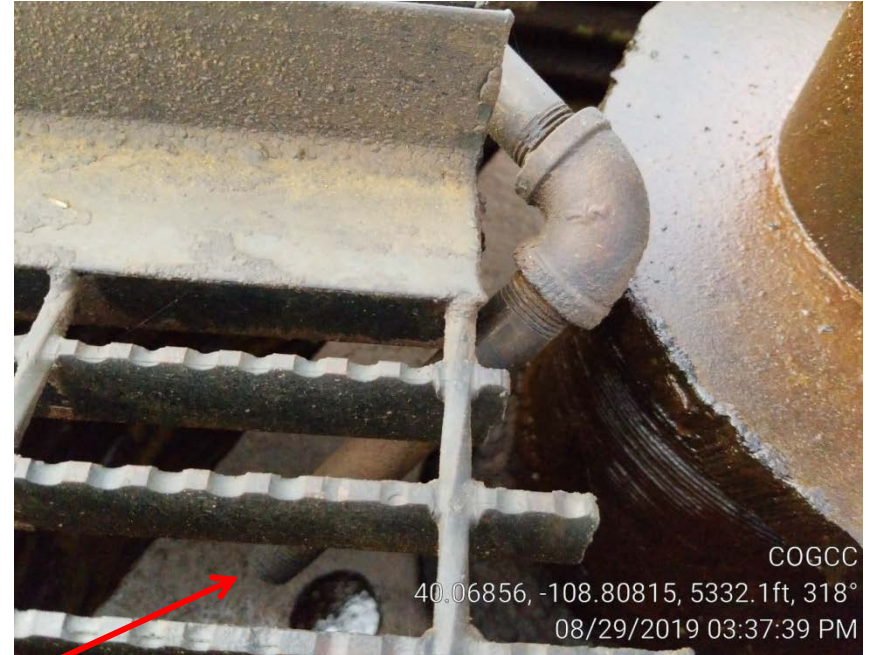
Photo 4. Gas vent pipe at well head.