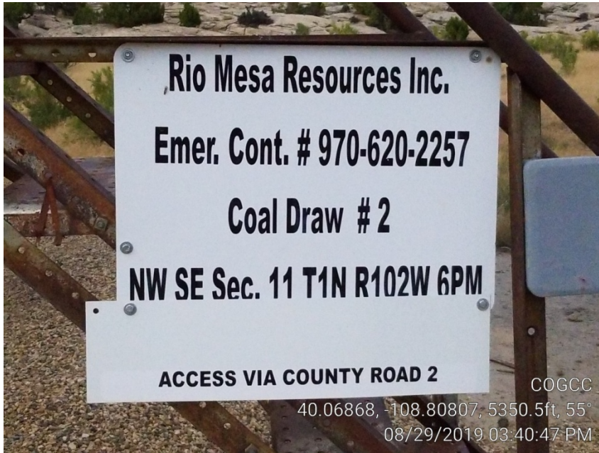
Photo 3. Battery sign