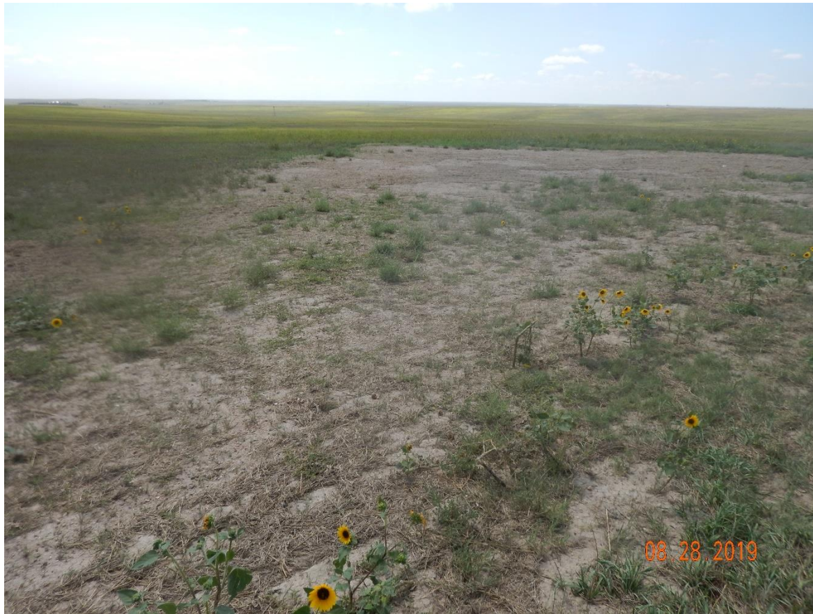
Photo 1: Photo taken from the north end of the location, facing south. Photo shows the reclamation of the location.