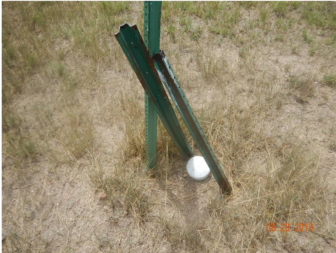
Photo 7: Photo taken from the northeast corner of the location. Photo shows t-posts and a plastic pipe remaining on location.