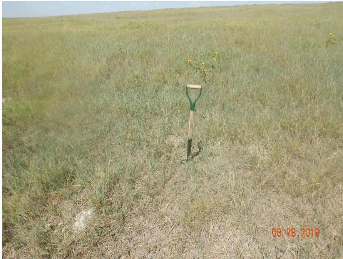
Photo 14.b: Photo taken from the adjacent reference areas. Photo shows reclamation specialist was able to easily penetrate the top 15 inches of soil. Compaction concerns appear evident on location. Reclamation specialist dug a test pit within the reference to compare soils observed on location.