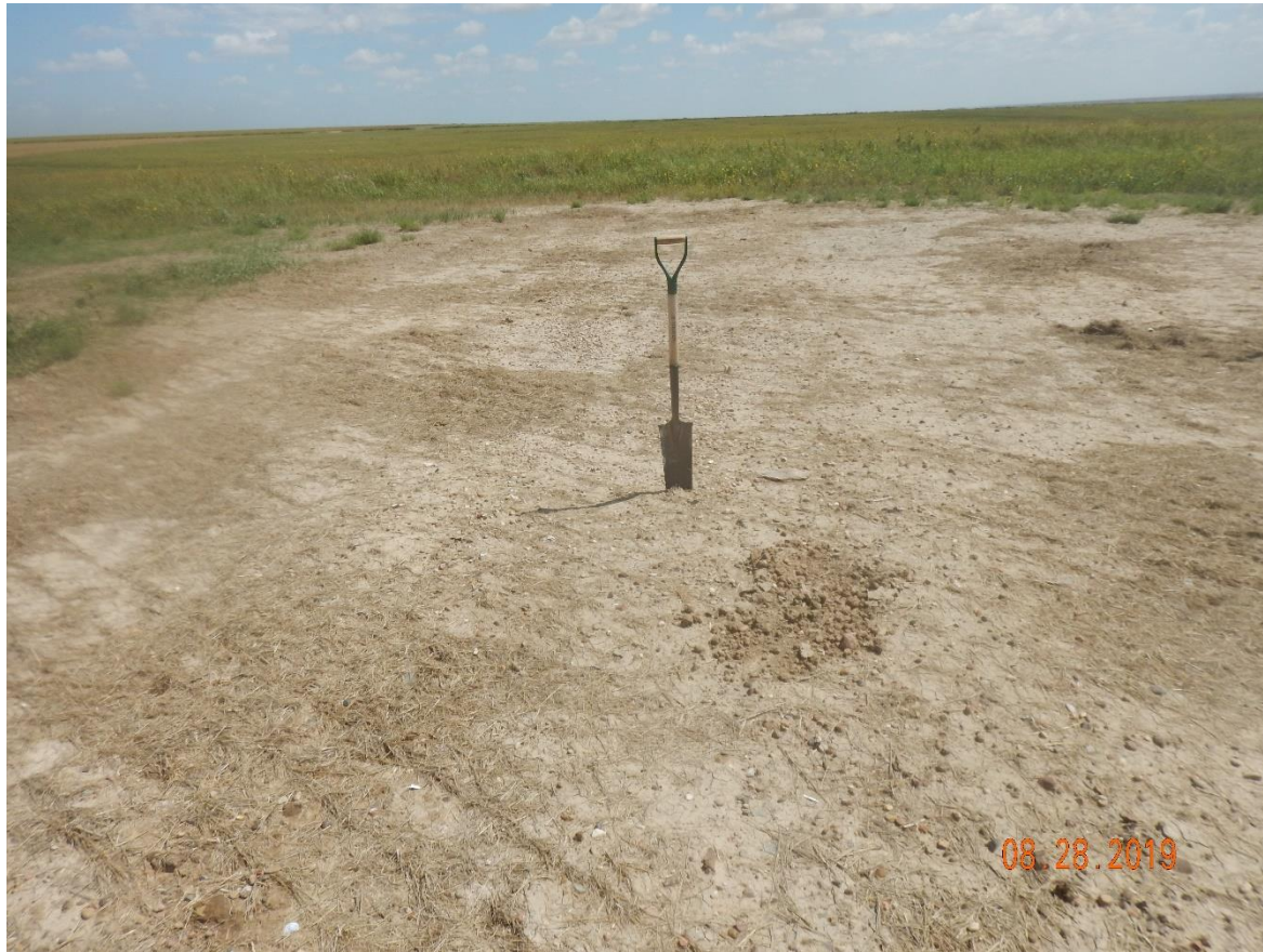
Photo 14: Photo taken from the location. Photo shows reclamation specialist tested the location for compaction concerns. Photo shows reclamation specialist was only able to penetrate the top few inches of soil with east. Compaction concerns appear evident