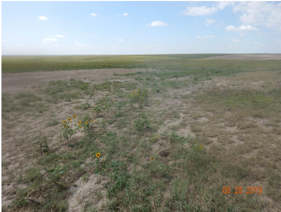
Photo 2: Photo taken from the north end of the location, facing southwest. Photo shows the reclamation of the location.