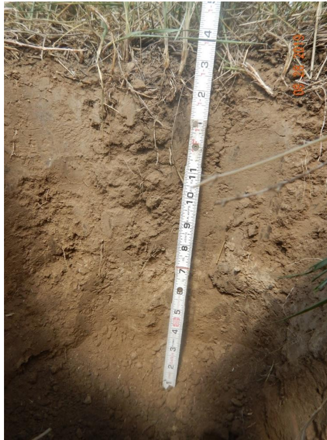
Photo 15: Photo of test pit from the reference area. Photo shows soils observed on the location are not reflective of soils on the adjacent reference area. Soils in the reference did not contain a chemical smell detected in the soils on the location.