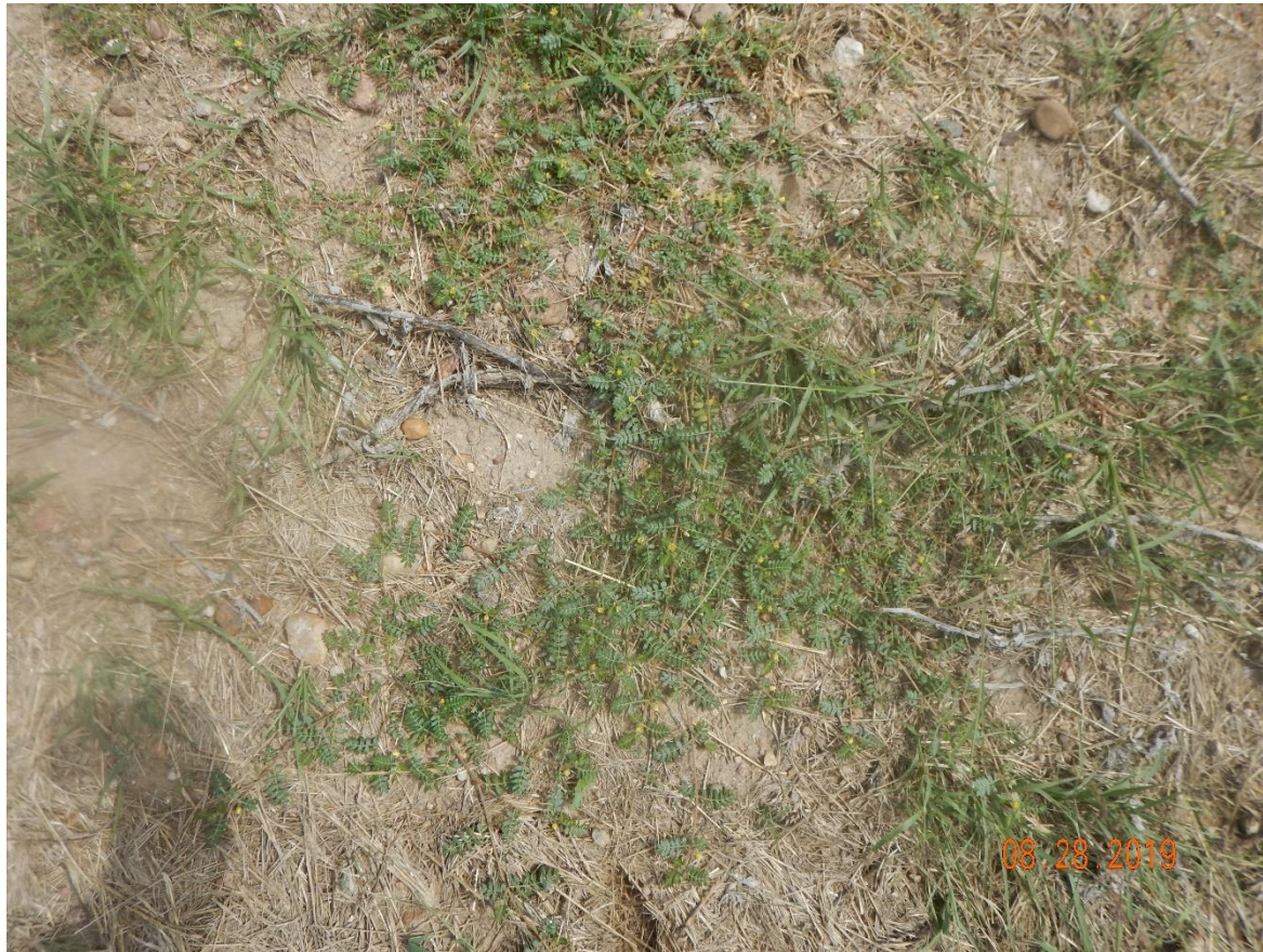
Photo 6: Photo taken from the location. Photo shows puncture vine establishing on location.