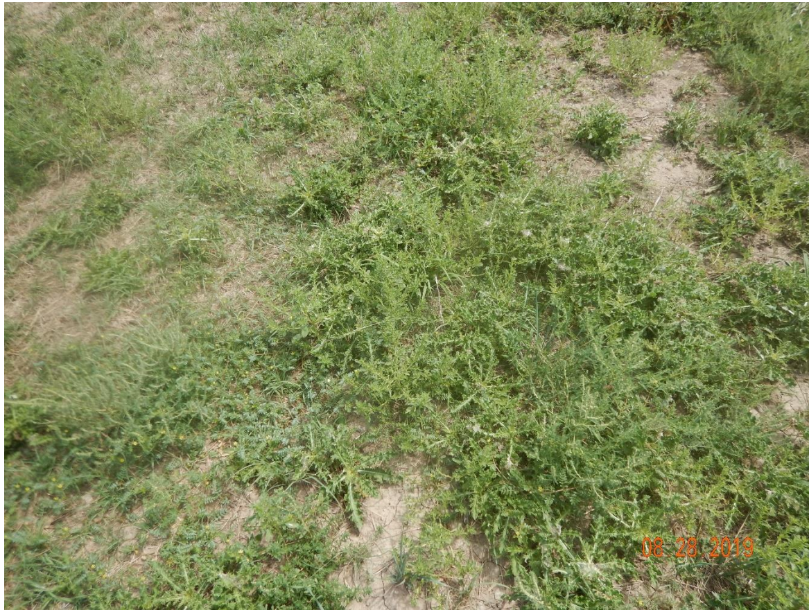
Photo 4: Photo taken from the south end of the location. Photo shows was appears to be Canada thistle plants establishing on the south end of the location.