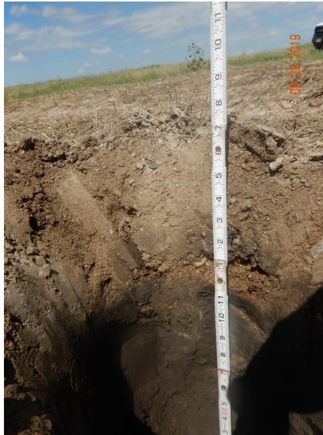
Photo 11: Photo of test pit dug on location. Reclamation specialist observed areas of stained soil and conducted a test pit for both compaction and soil concerns. Photo shows dark colored soils observed from soil surface to at least two feet sub-surface. Soils had a chemical smell and appears to exceed two (2) feet below ground.