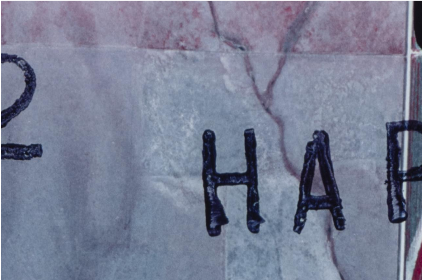
Photo 20: 1980 USGS Aerial imager. Photo shows access roads did not pre-exist the Oil and Gas location. Access road is associated industrial oil and gas disturbance subject to COGCC reclamation rules and requirements.