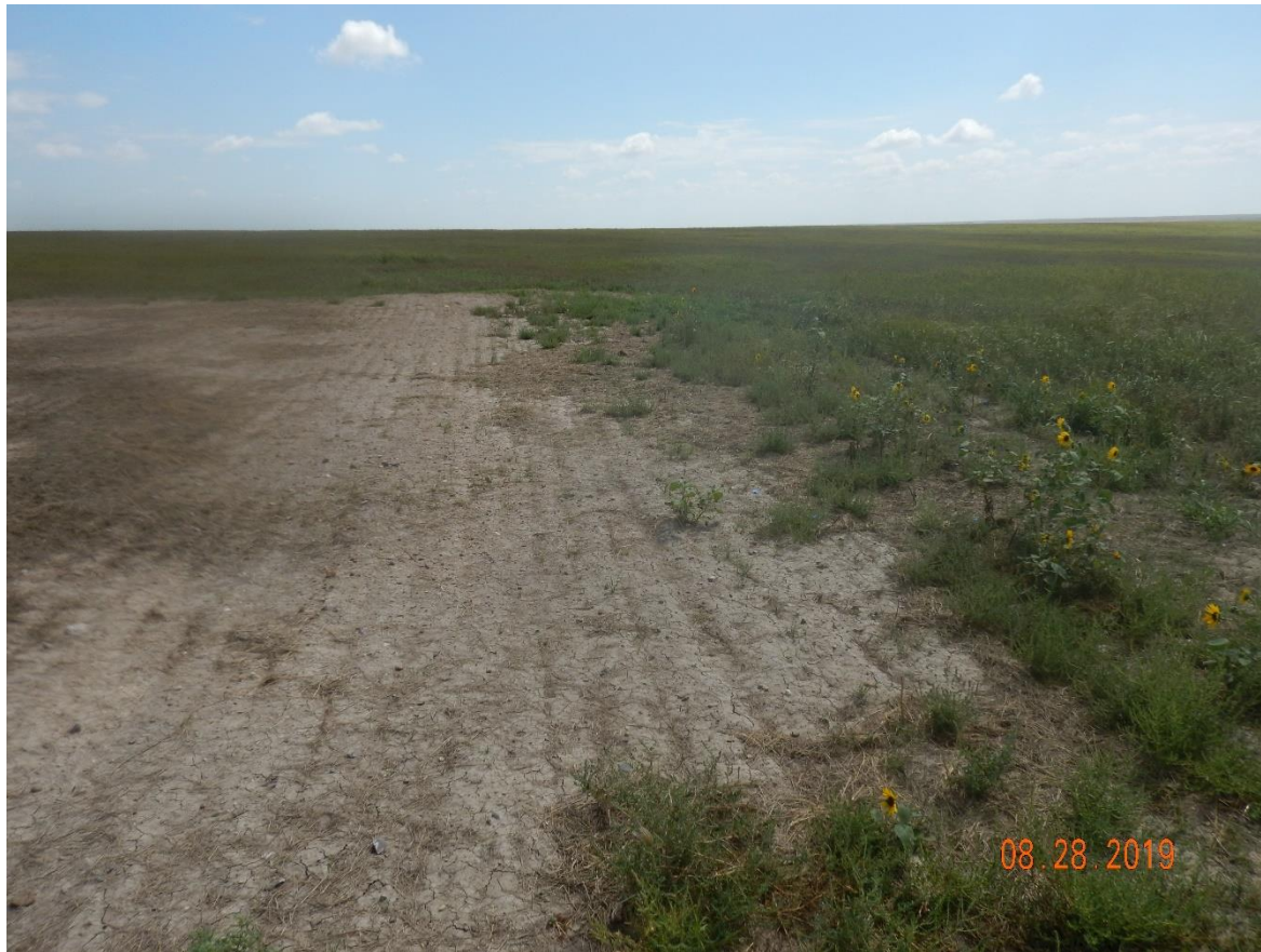
Photo 3: Photo taken from the southwest end of the location, facing east. Photo shows the reclamation of the location.