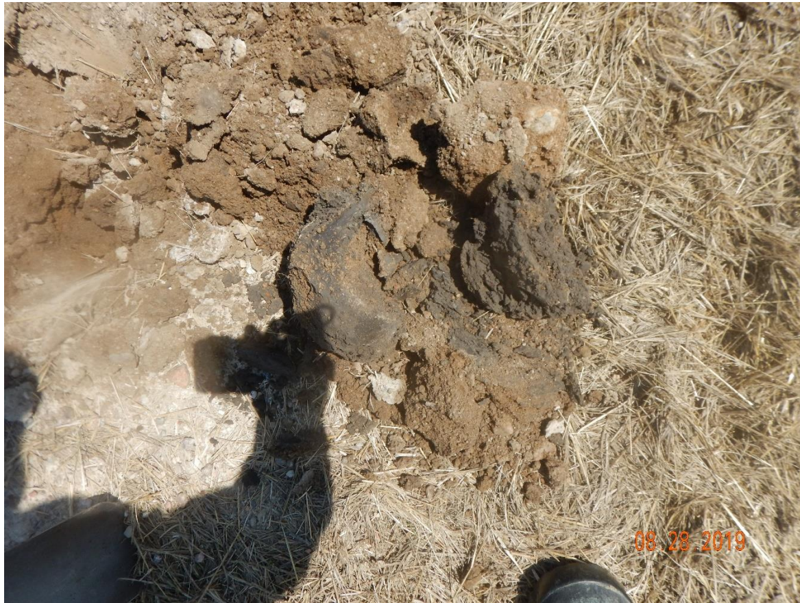
Photo 10: Photo taken from the location. Reclamation specialist observed areas of stained soil and conducted a test pit for both compaction and soil concerns. Photo shows stained soils observed at the surface.