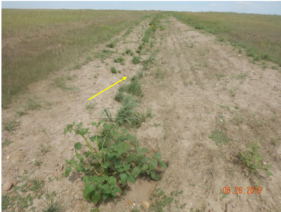
Photo 5: Photo taken from the access road north of the location. Photo shows stormwater erosion degradation is beginning to incise the access road.