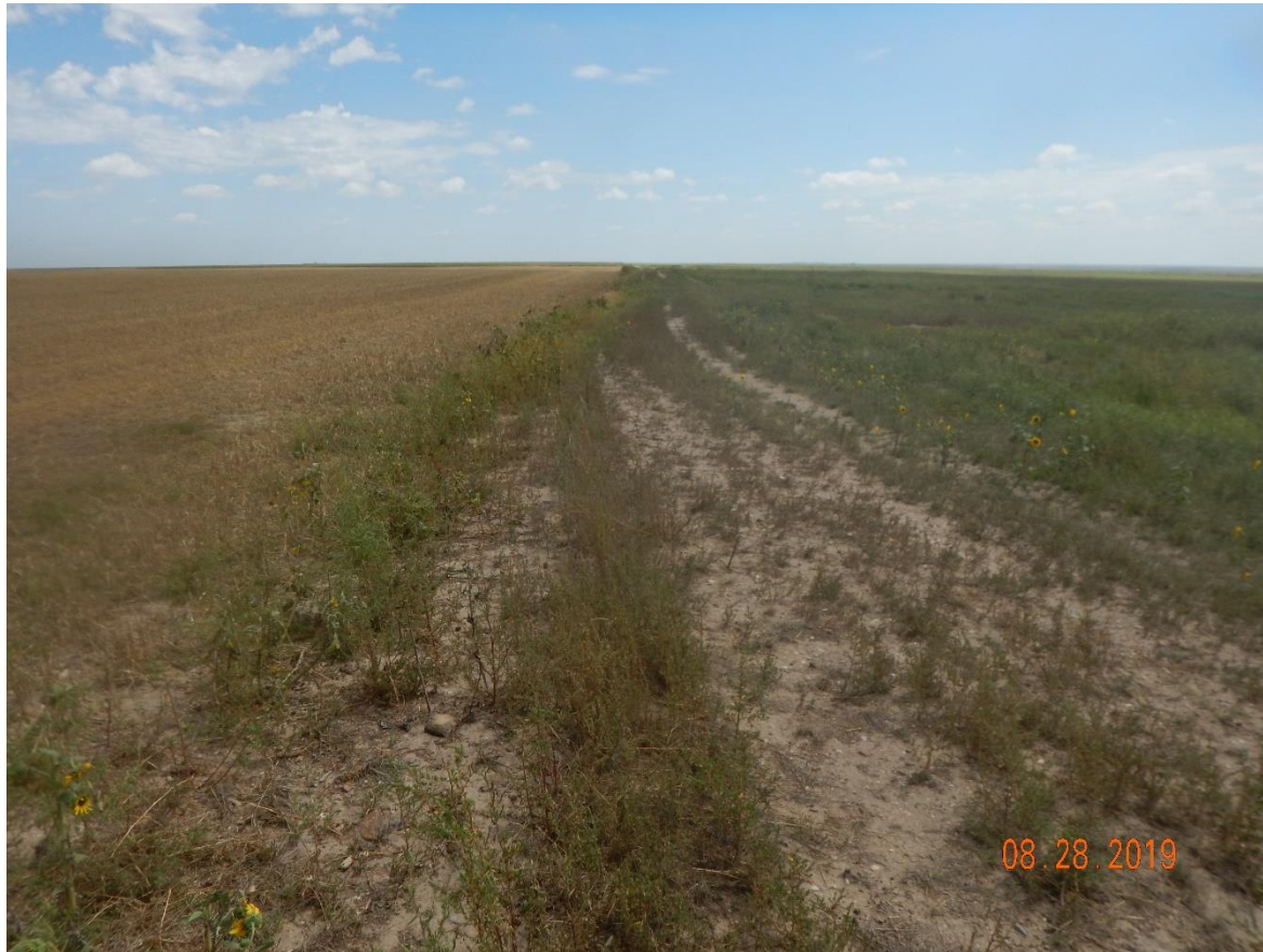
Photo 17: Photo taken the east/west access road north of the location. Photo shows Operator has not conducted final reclamation activities on the east/west section of access road.