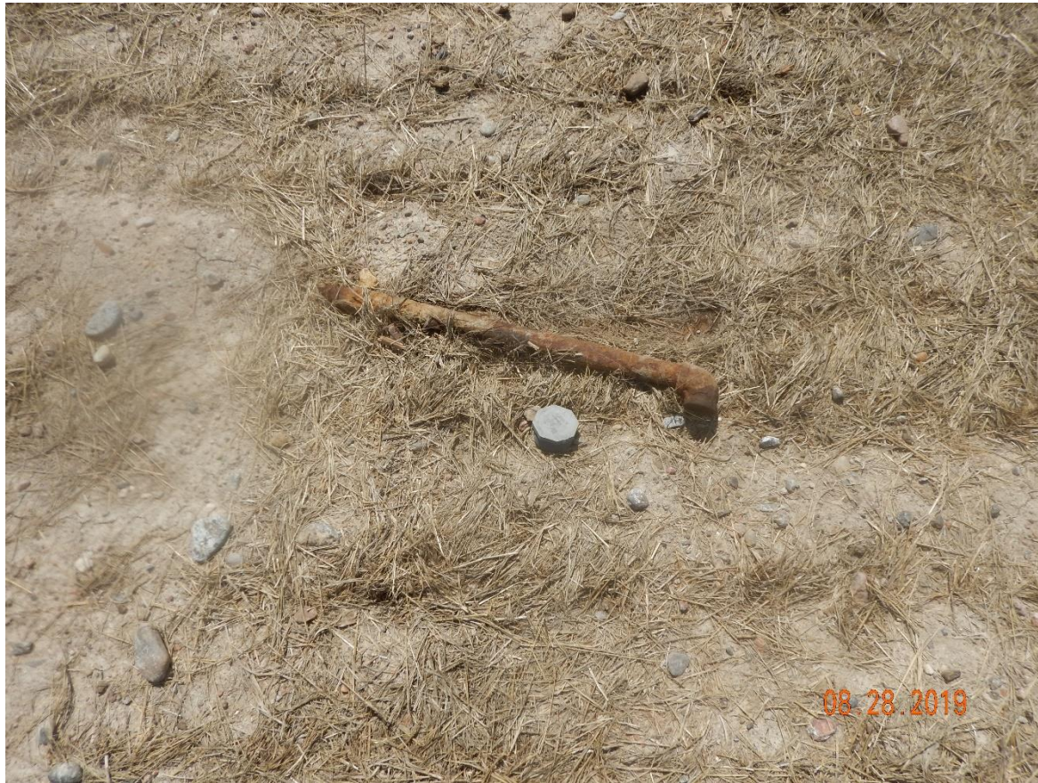
Photo 8: Photo taken from the location. Photo shows trash debris remaining on location.