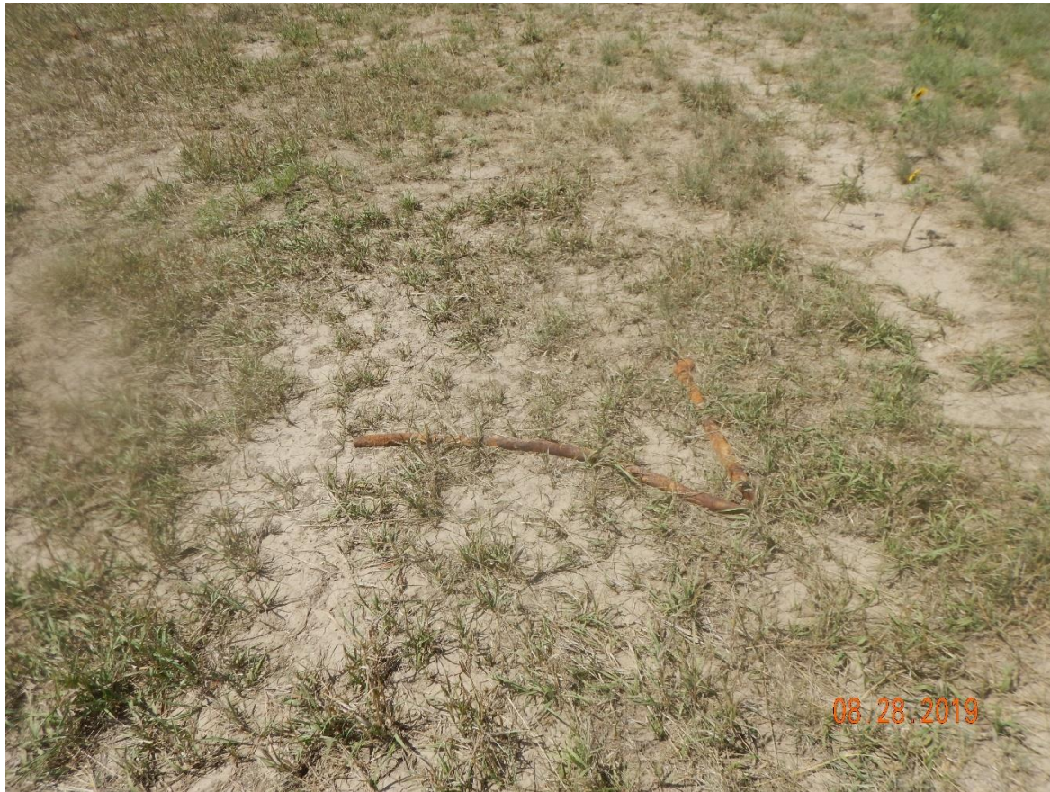
Photo 9: Photo taken from the location. Photo shows trash debris remaining on the location.