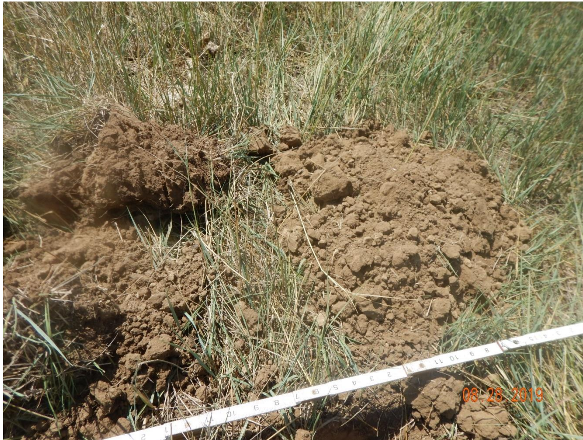
Photo 16: Photo of soils excavated from the reference area. Photo shows soils observed on the location are not reflective of soils on the adjacent reference area.