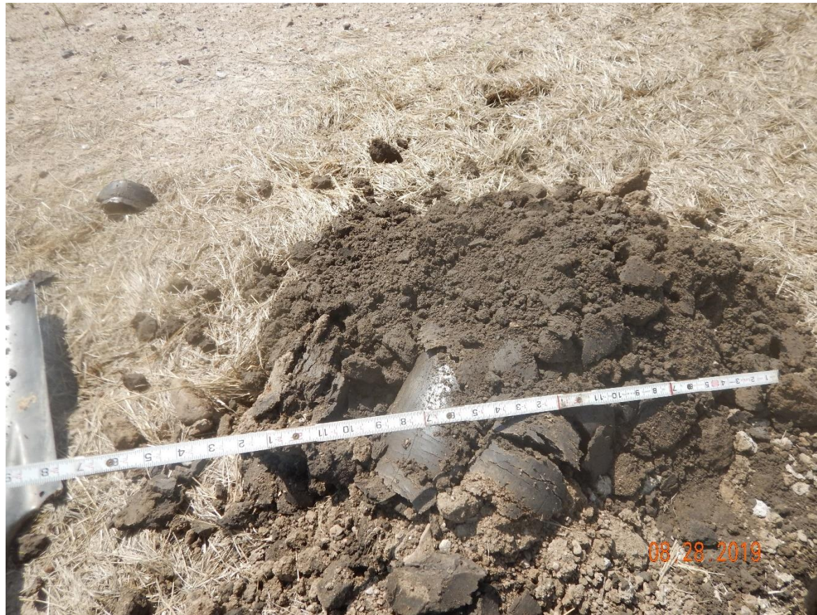
Photo 13: Photo shows dark colored soils with a chemical smell that was excavated from the test pit.