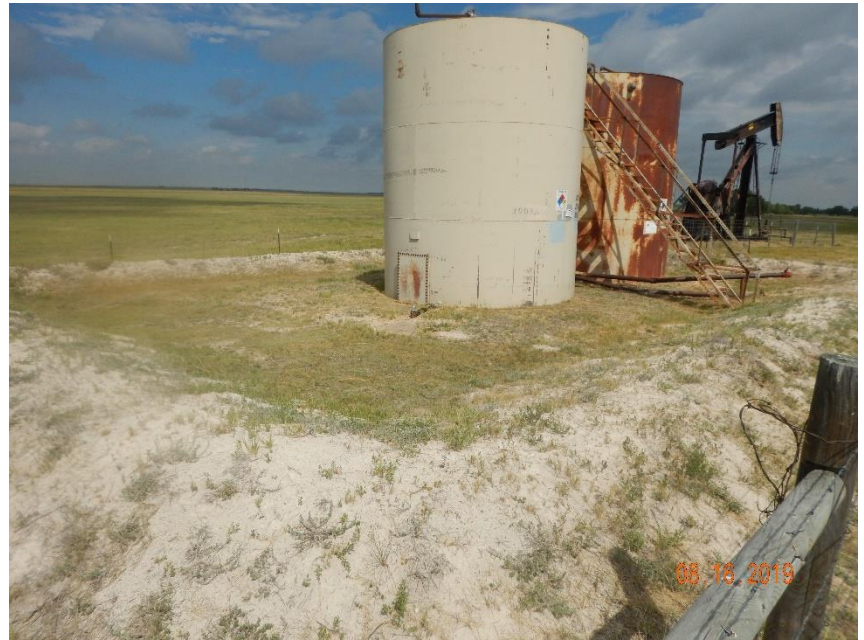
Photo 20: Photo taken from the tank battery on the south end of the location, facing northwest. See comments under photo 19.