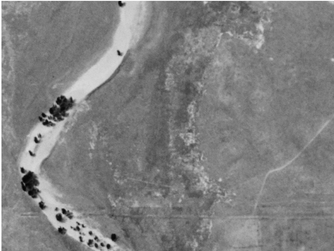
Photo 29: 1971 USGS Aerial imagery. Photo shows area prior to oil and gas disturbances.