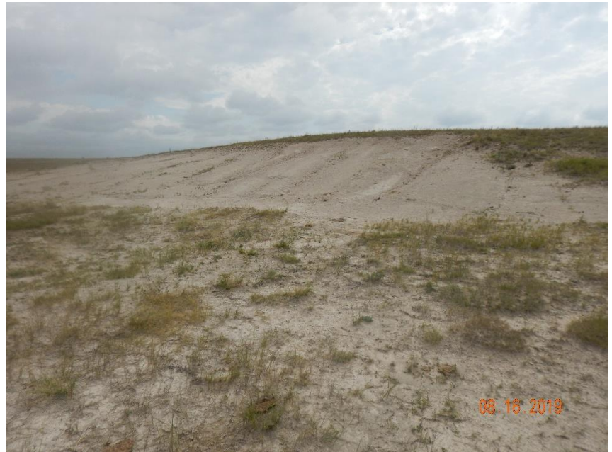
Photo 4: Photo taken from the east end of the location, facing northeast. Photo shows exposed soils with erosion degradation at the cut slopes.