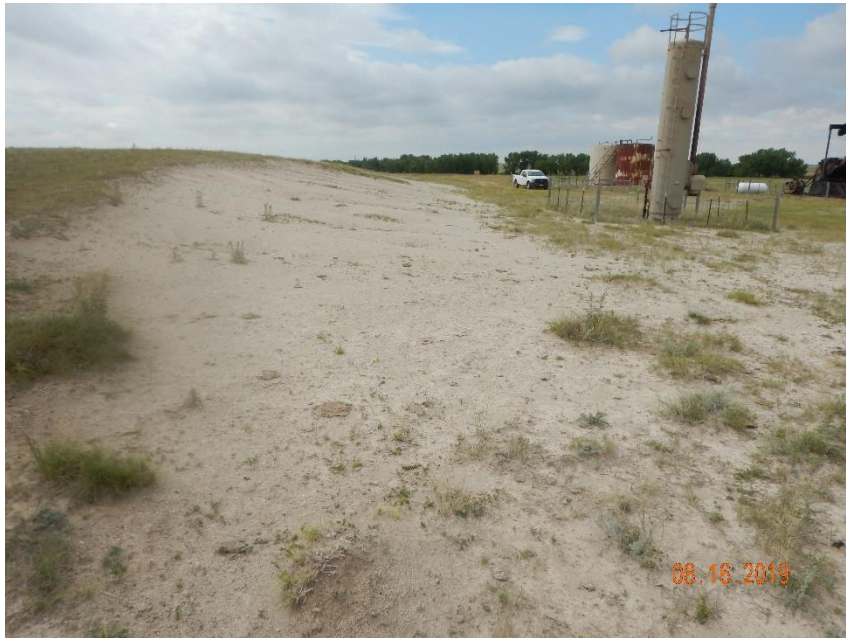
Photo 7: Photo taken from the northeast end of the location, facing west. Photo shows exposed soils and erosion degradation along the east end of the location.