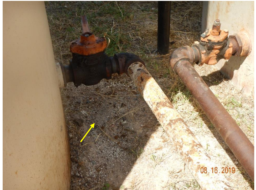
Photo 24: Inspection #696101187 documented and required operator to remove and/or remediate stained soil beneath south crude oil tank loadout. Photo shows area where stained soils were observed in inspection #696101187. It appears during initial observations that the stained soils have been removed or remediated. However, upon closer inspection, it appears as though clean soil has been placed to cover the stained soils (see photos 25-7)