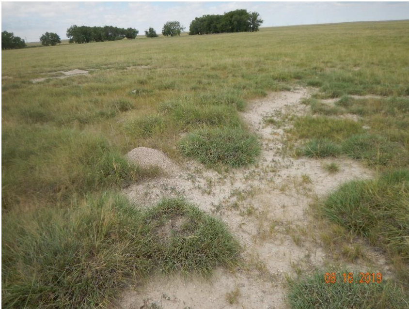
Photo 15: Photo taken from the west end of the location, facing west. Photo shows areas on the west end of the location where pit, or a spill, appears to have historically existed. Disturbance does not pre-exist the oil and gas location. See photos 29-32 for additional details