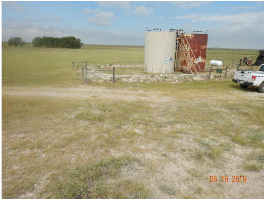
Photo 1: Photo taken from the southeast end of the location, facing west. Photo provides an overview of the location.