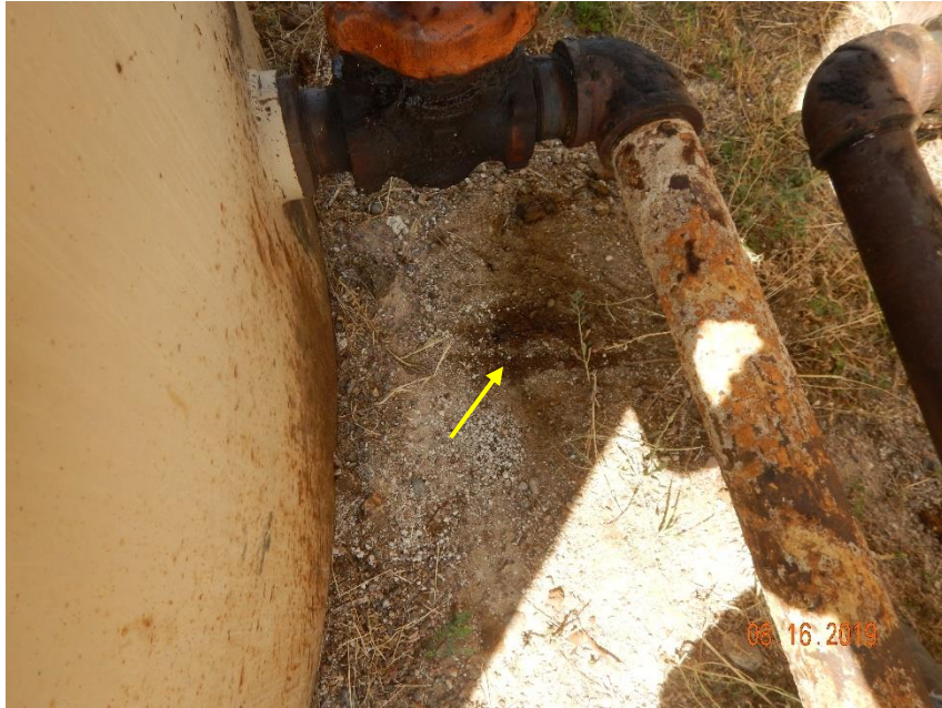
Photo 25: Continued from photo 24. Photo shows that once inspector scrapes the surface, it becomes clear that stained soils have not been removed and or/remediated.