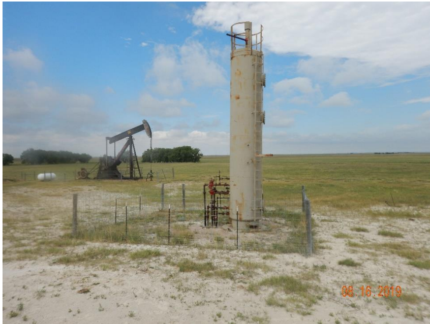
Photo 5: Photo taken from the northeast end of the location, facing west. Photo of equipment on location.