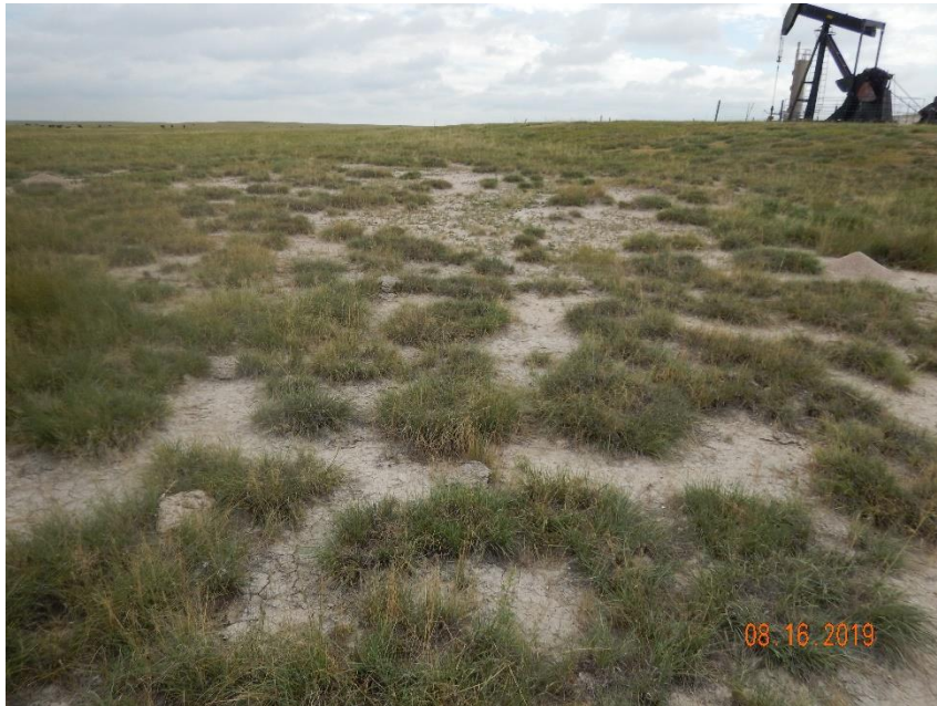
Photo 17: Photo taken from the west end of the location, facing east. See comments under photo 15..