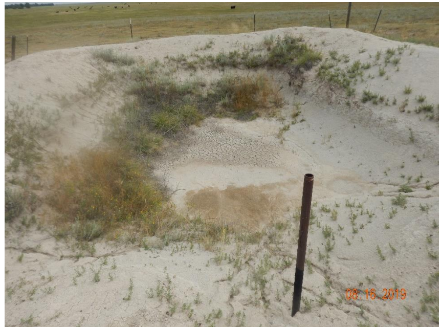
Photo 10: Photo taken from the pit on the north end of the location. .