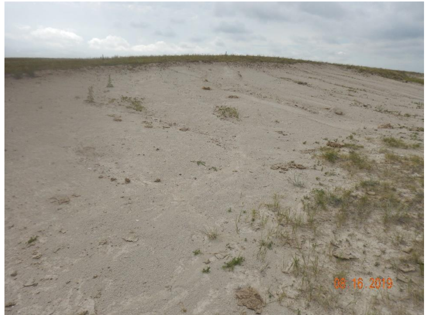
Photo 6: Photo taken from the northeast end of the location, facing southeast. Photo shows exposed soils with erosion degradation at the cut slopes. Previous inspections required operator to install or repair required BMPs by 12/4/2017. Operator has failed to comply with corrective actions and with rule 1002.f.