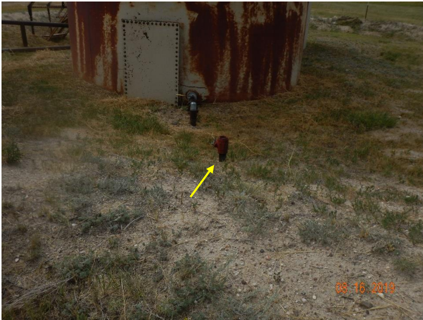
Photo 21: Photo taken from the north end of the tanks. Photo of riser. Riser does appear to be abandoned and is considered equipment not needed for production. Additionally, riser has not been "locked out/tagged out".