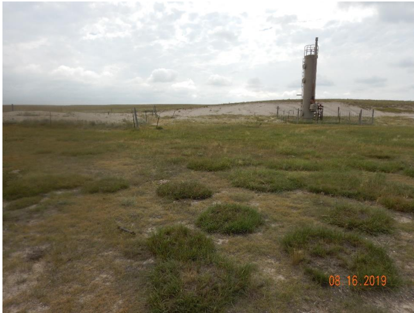
Photo 11: Photo taken from the northwest corner of the location, facing west. Photo provides an overview of the location.