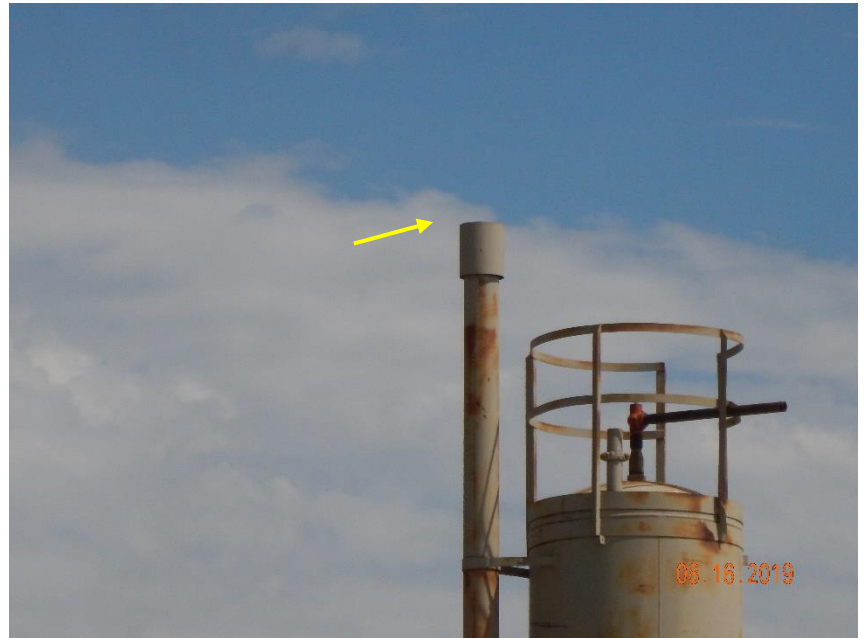
Photo 22: Inspection #696101187 documented that no wildlife protection screen observed on heated treated stack. Photo shows wildlife protection screen does not appear to have been installed per 605.b.(7)