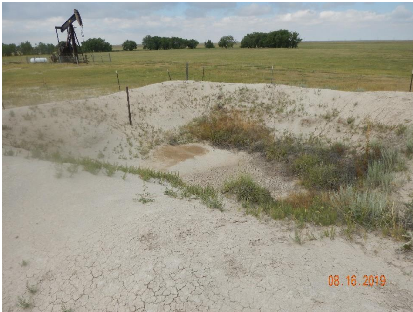
Photo 9: Photo taken from the pit on the north end of the location.