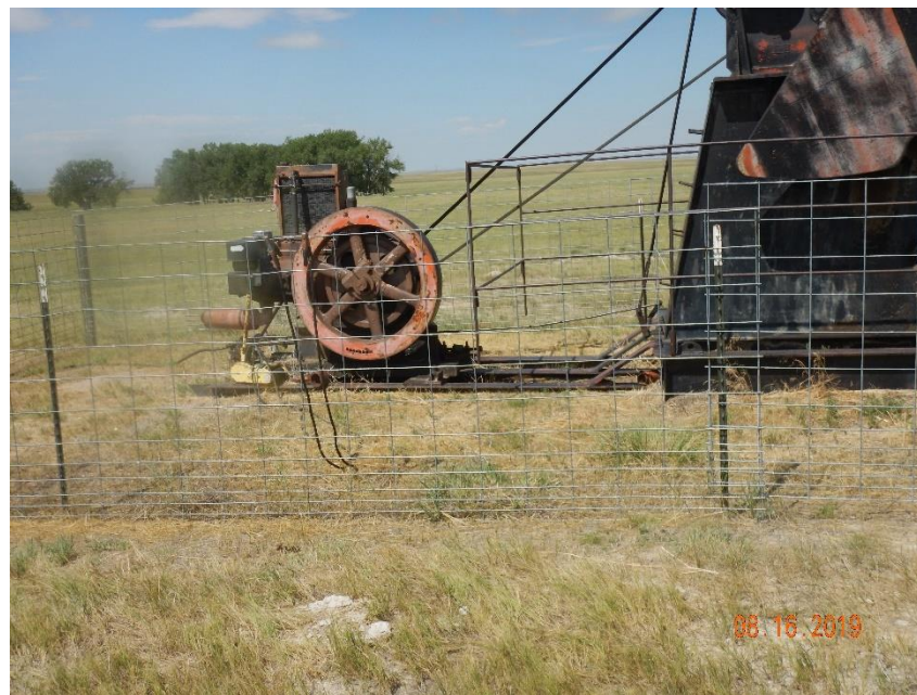
Photo 28: Inspection #696101187 documented trash behind the engine and required removal. Photo shows trash debris appears to have been removed.