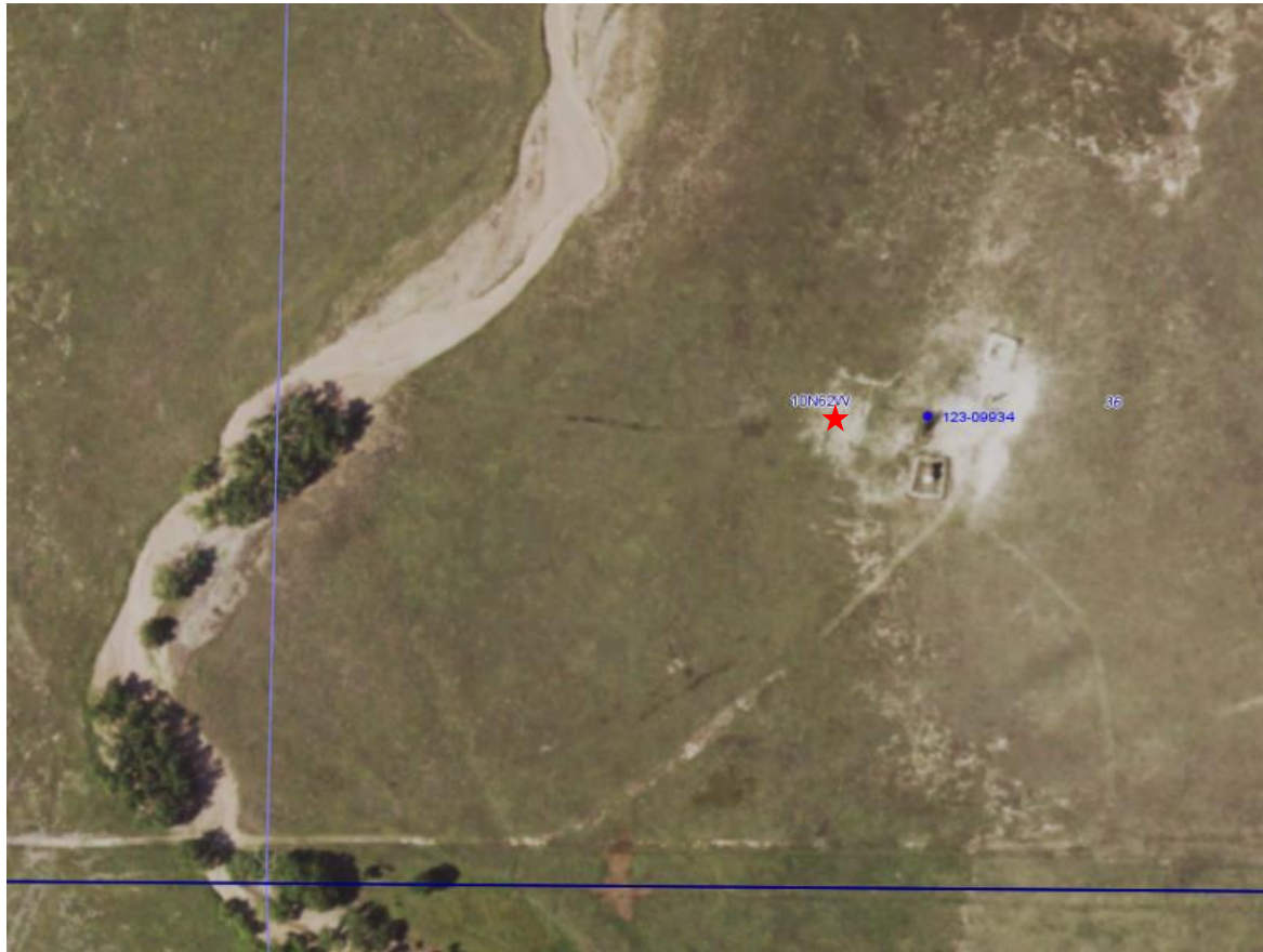
Photo 32: 2017 COGCC COGIS Aerial imagery. Image is the most recent imagery available. See comments under photo 30 , and related photos 15-17