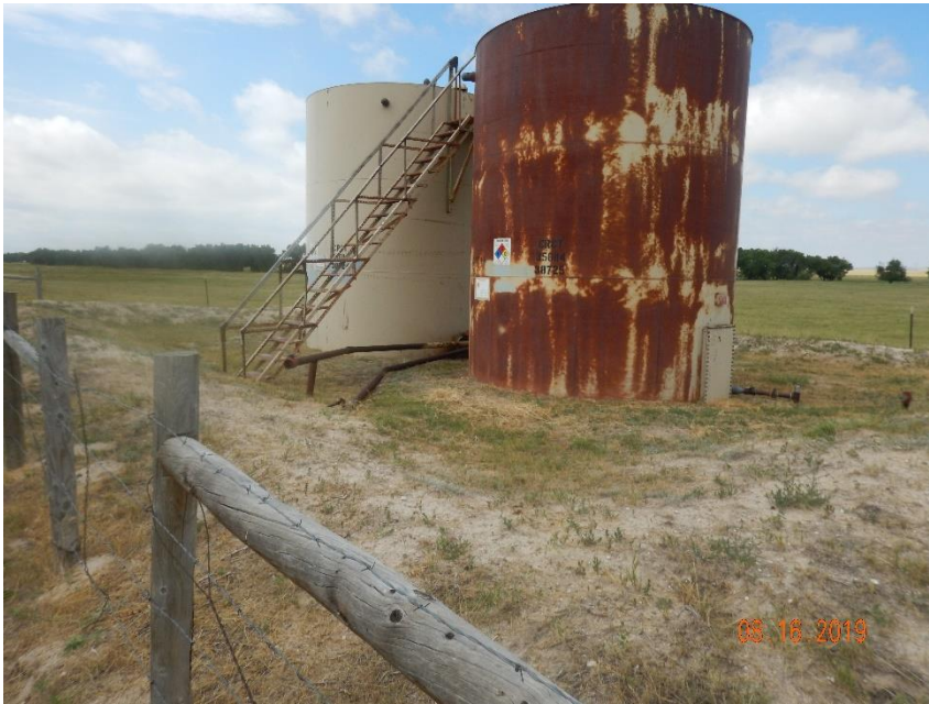
Photo 19: Inspection #696101187 documented weed encroachment at equipment on location and required operator to remove, manage and control weeds. Photo taken from the tank battery on the south end of the location, facing southwest. Photo shows vegetative establishment within, and on the secondary containment (berms). Vegetation compromises the integrity of the secondary containment