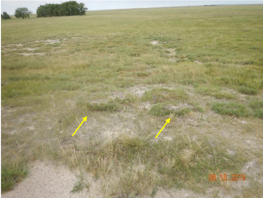
Photo 13: Photo taken from the west end of the location, facing west. Photo shows pedestal formations due to stormwater degradation. Pedestals form when stormwater erodes away un-stabilized areas of soil around vegetation.