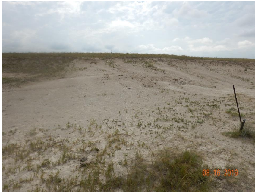
Photo 3: Photo taken from the east end of the location, facing southeast. Photo shows exposed soils with erosion degradation at the cut slopes. Previous inspections required operator to install or repair required BMPs by 12/4/2017. Operator has failed to comply with corrective actions and with rule 1002.f.