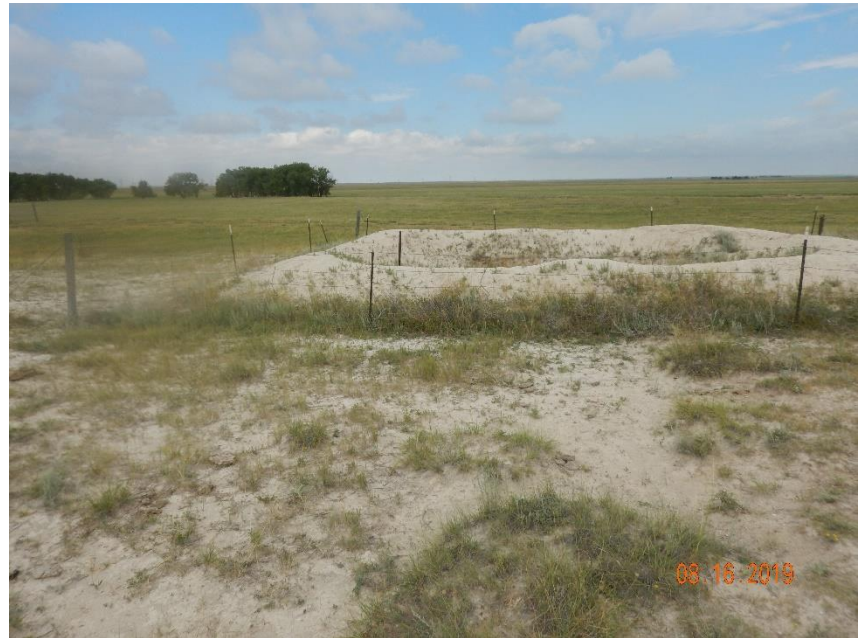
Photo 8: Photo taken from the northeast end of the location, facing west. Photo shows pit on location. Inspection #696101187 documented weed encroachment at pit on location and required operator to remove, manage and control weeds. Photo shows vegetative establishment within, and on the pit. Vegetation compromises the integrity of the pit walls/berms