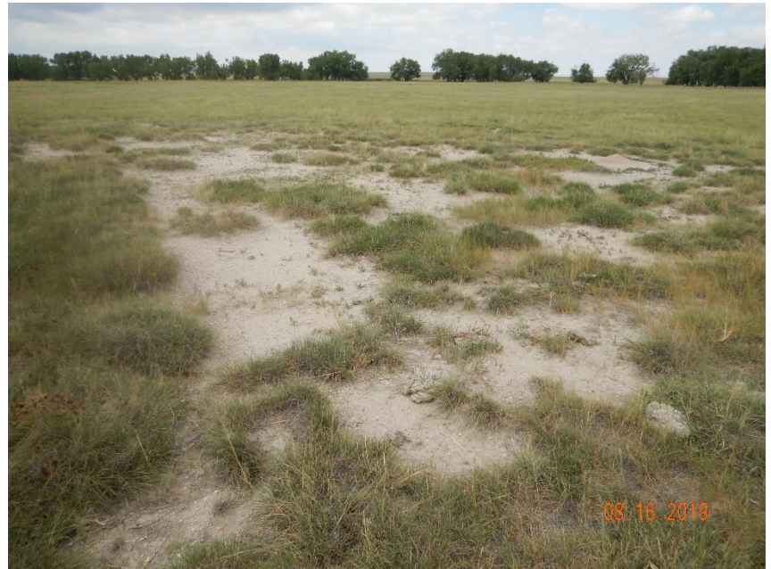
Photo 16: Photo taken from the west end of the location, facing west. See comments under photo 15.