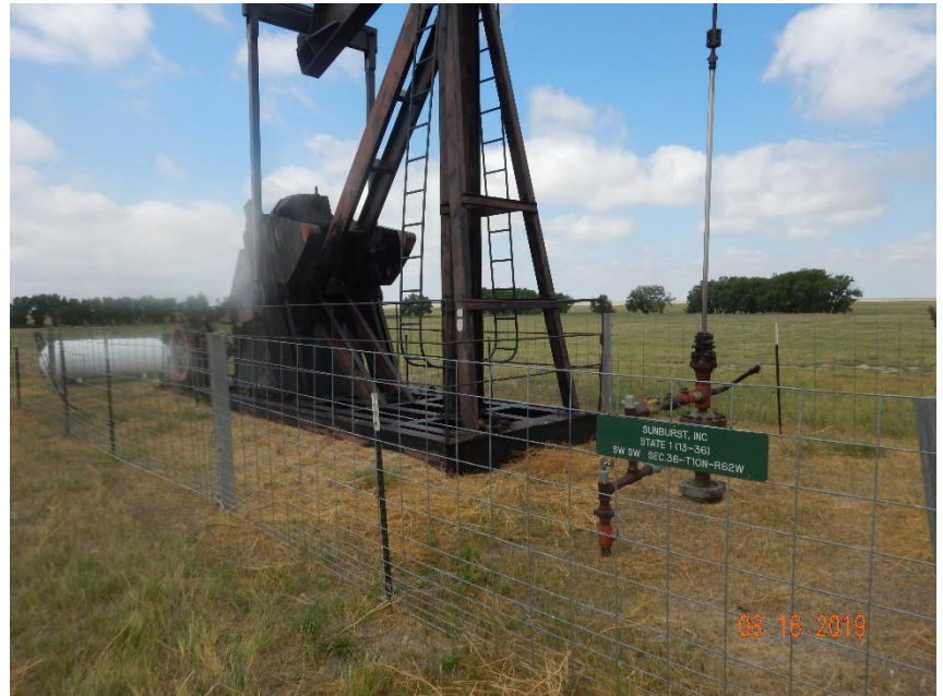
Photo 18: Inspection #696101187 documented weed encroachment at equipment on location and required operator to remove, manage and control weeds. Photo shows vegetation around well appears to have recently mowed, however, vegetation has not been removed from area of equipment. Vegetative growth and accumulation around equipment/wellhead is considered a fire hazard.