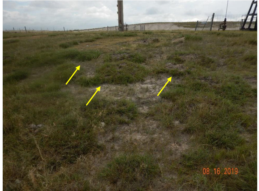
Photo 14: Photo taken from the west end of the location, facing east. See comments under photo 13.