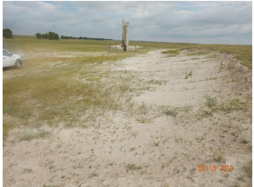
Photo 2: Photo taken from the southeast end of the location, facing north. Photo provides an overview of the location.