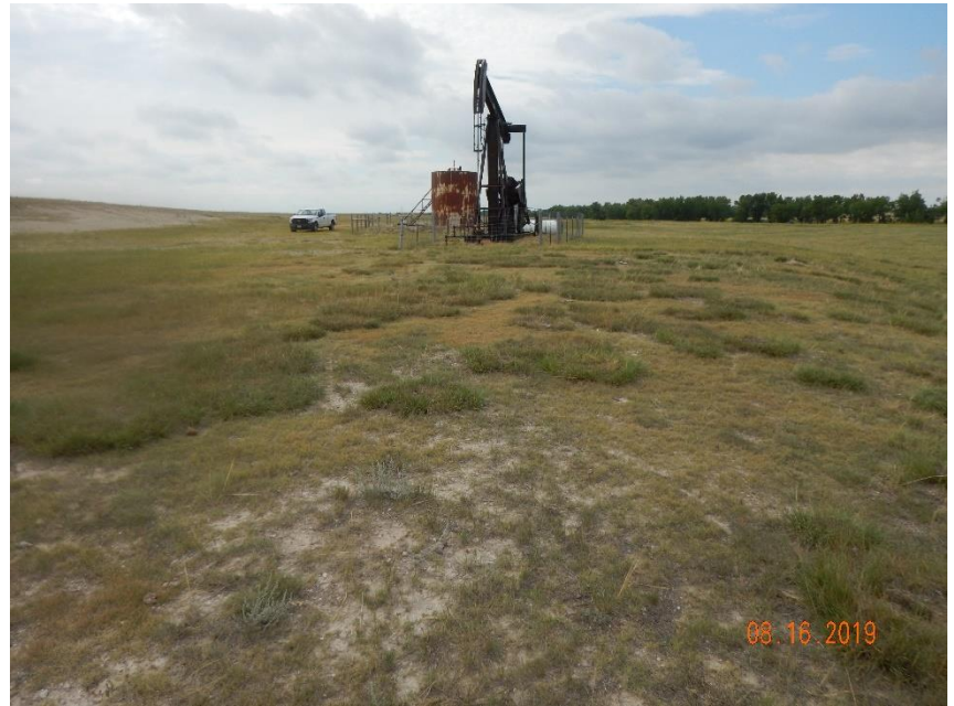
Photo 12: Photo taken from the northwest corner of the location, facing south. Photo provides an overview of the location.