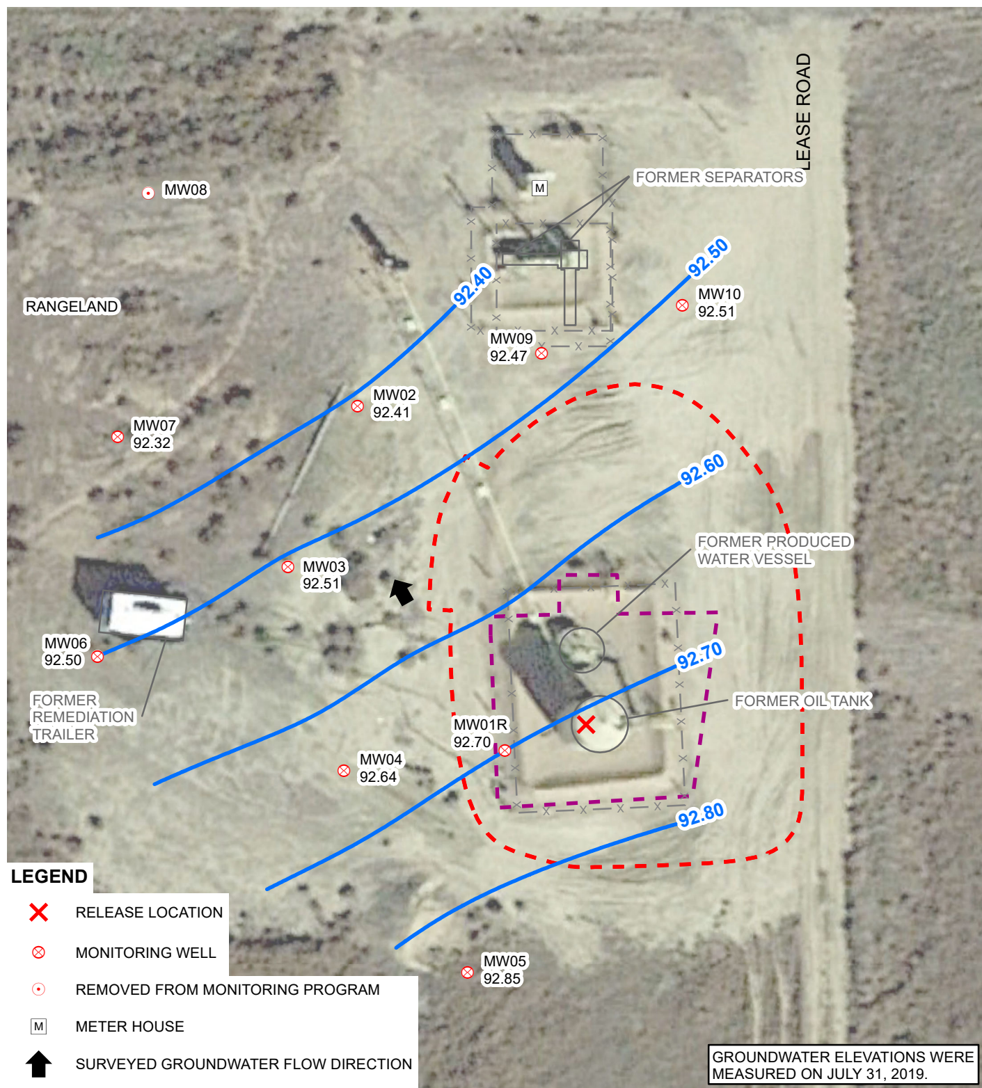
FIGURE 3D GROUNDWATER ELEVATION CONTOUR MAP THIRD QUARTER 2019 HSR-BOTT 3-23, HSR-FISCHER 6-23 NENW SEC 23-T4N-R65 WELD COUNTY, COLORADO KERR-MCGEE OIL & GAS ONSHORE LP