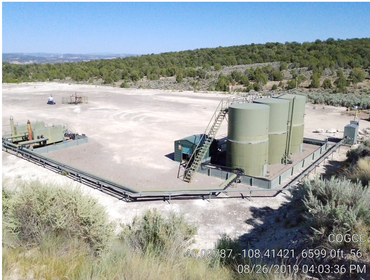
Photo 1. Location.

Yellow Creek 29-32-1 API: 05-103-10551 Inspection: 679705225