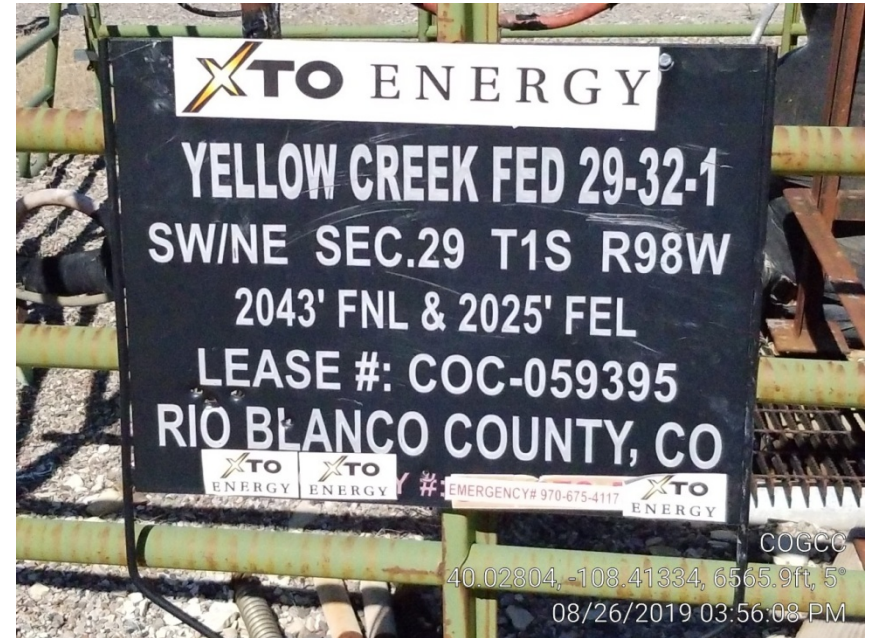
Photo 3. Well head sign.