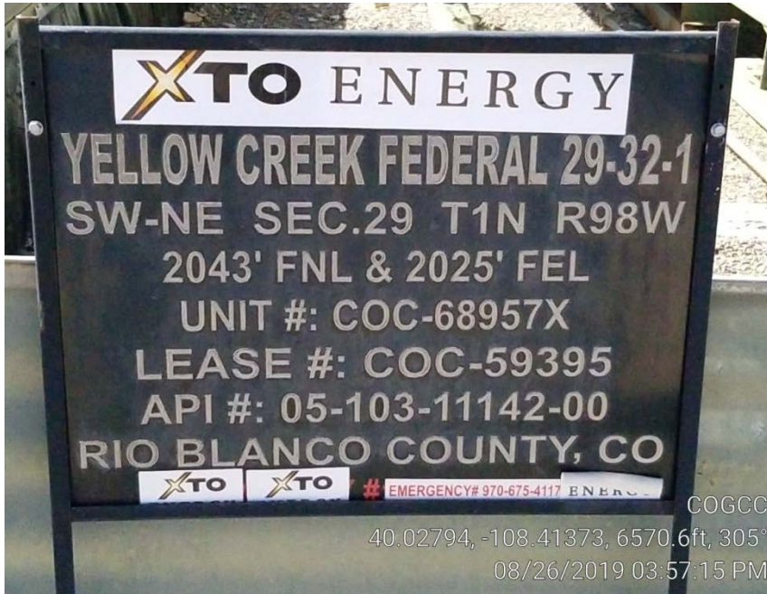
Photo 4. Separator sign.

Yellow Creek 29-32-1 API: 05-103-10551 Inspection: 679705225