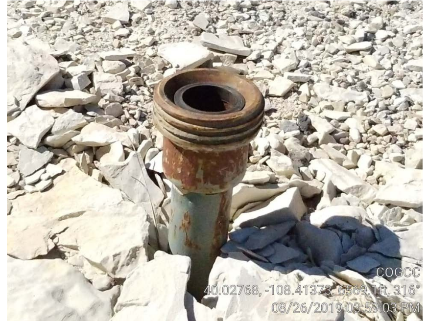
Photo 5. Uncapped riser by meter building.