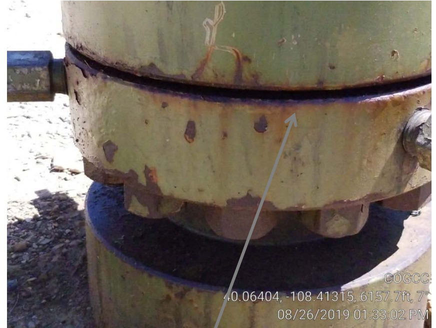
Photo 3. Well head gas leak.