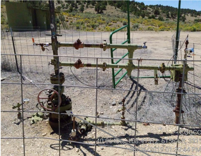
Photo 2. Well head.

BCU 34-8-198 API: 05-103-10903 Inspection: 679705217