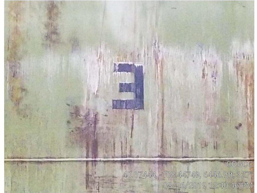
Photo 3. Tank 3.