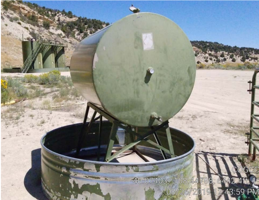
Photo 4. Container next to well head.