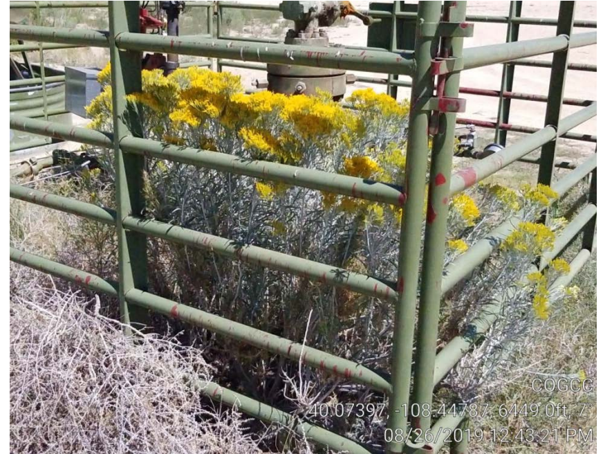
Photo 5. Vegetation next to well head.