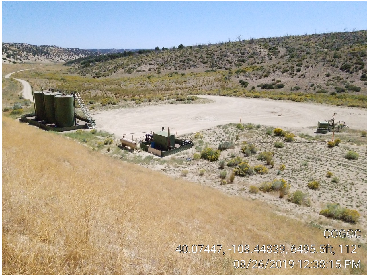
Photo 1. Location.