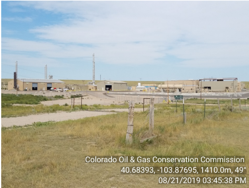
Colorado Oil & Gas Conservation Commission 40.68393, -103.87695, 1410.0m, 49° 08/21/2019 03:45:38 PM