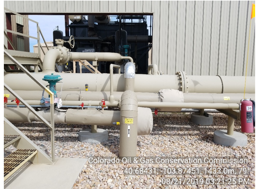
Colorado Oil & Gas Conservation Commission 40.68431, -103.87451, 1433.0m, 79° 08/21/2019 03:21:25 PM