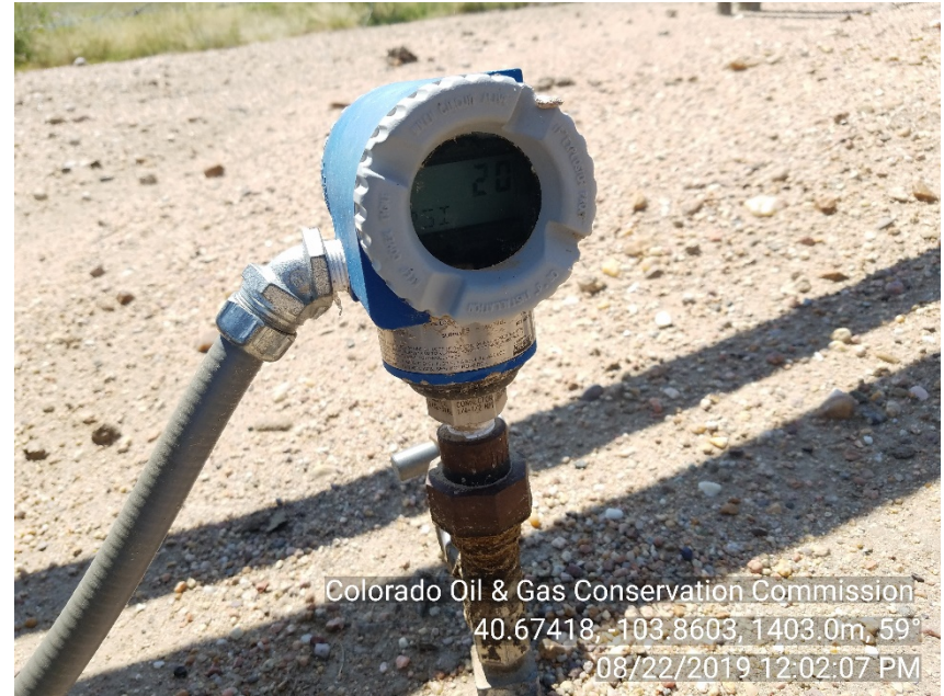
Photo #4 Lilli Unit 9-9 UIC - Injection Wellsite Shut-In | SI Csg. Press: 20#