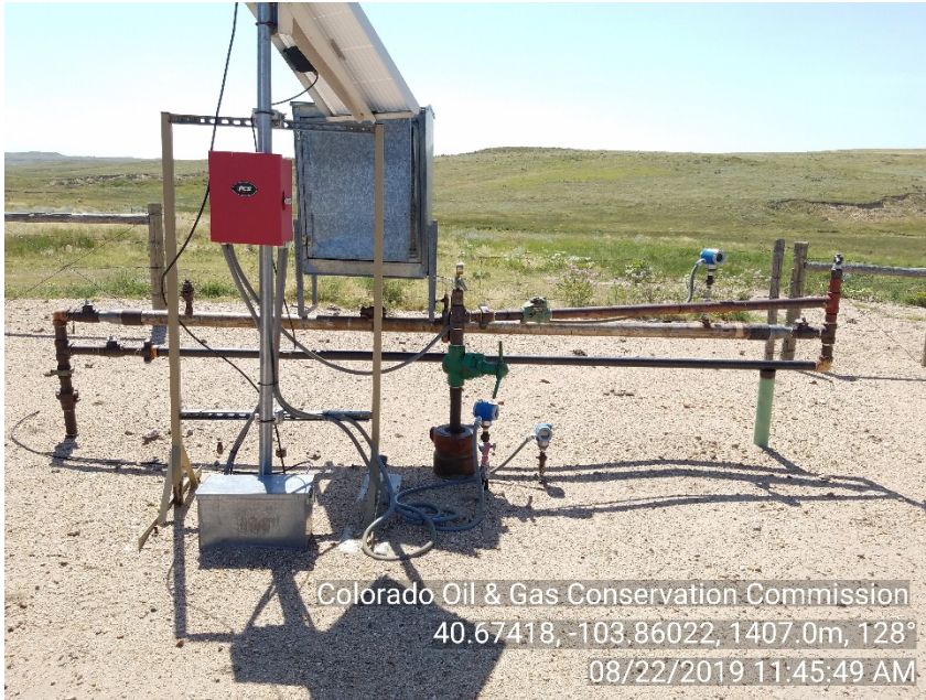
Photo #1 Lilli Unit 9-9 (05-123-14237) UIC - Injection Wellsite UIC Annual Inspection Not Injecting – Gas / Injection line: Shut Shut-In | SI