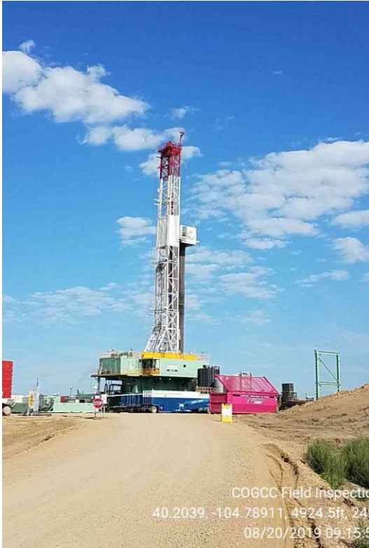
Photo 1 Rig