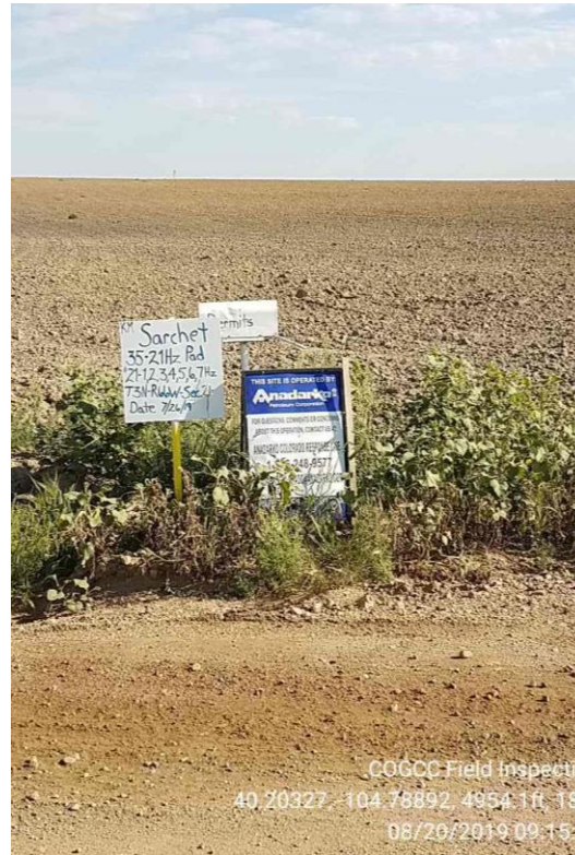
Photo 2 Entrance Signage