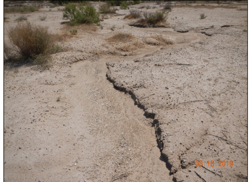
Photo#7. Photo at East side of location. Erosion sediment moving off location and choking out vegetation.