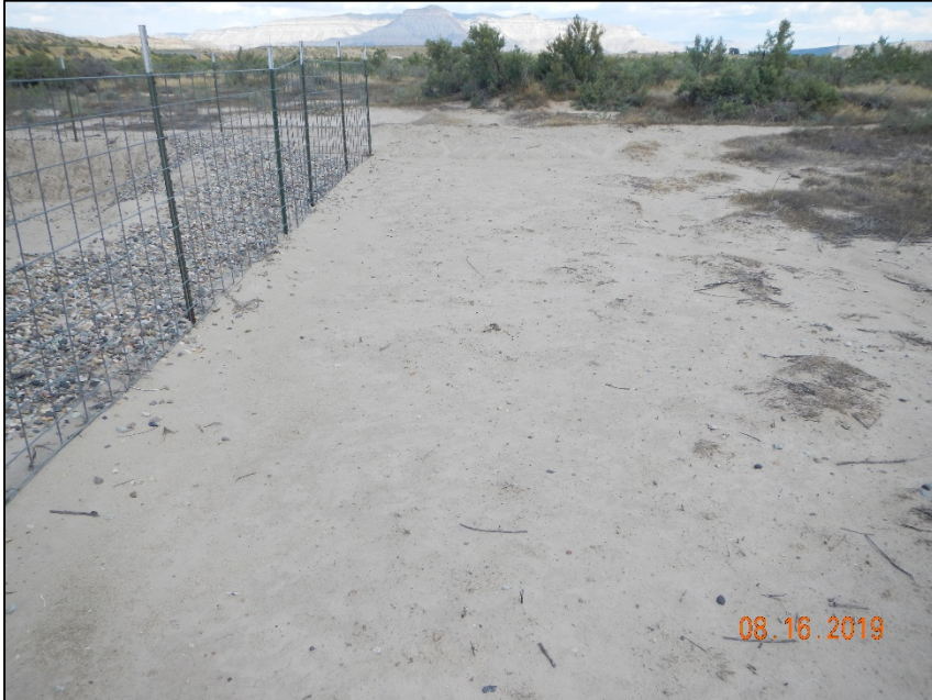
Photo #14 Erosion sediment moving onto location by tank battery. BMP not working and needs maintenance at time of inspection.