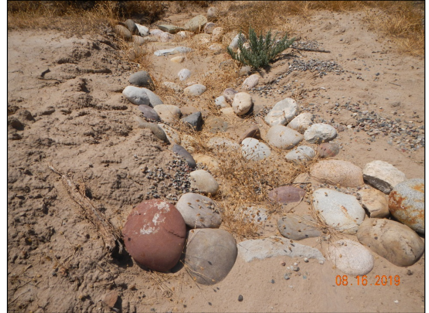
Photo #11. Erosion sediment moving off location into a sediment trap and through the armoring. Sediment trap is on the S side of location, needs maintenance.