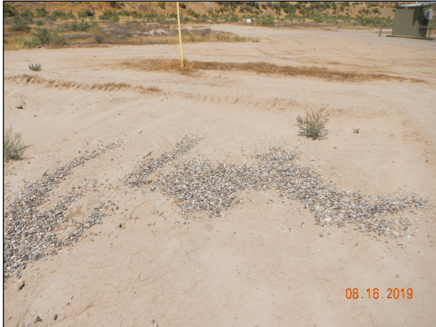
Photo #12. Photo on South side of location. Erosion sediment moving off location and choking out vegetation.