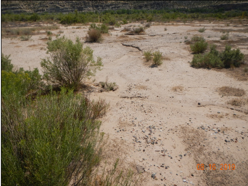
Photo#6. Photo at East side of location. Erosion sediment moving off location and choking out vegetation.