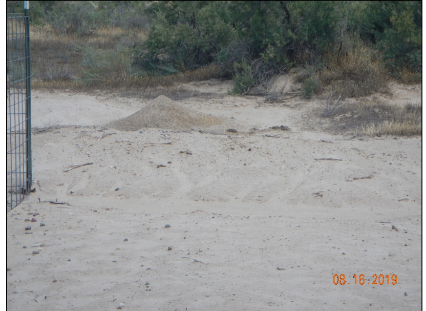
Photo #15 Erosion sediment moving onto location by tank battery. BMP not working and needs maintenance at time of inspection.