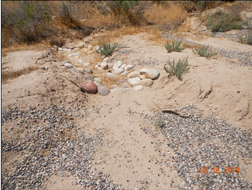
Photo #10. Erosion sediment moving off location into a sediment trap and through the armoring. Sediment trap is on the S side of location, needs maintenance.