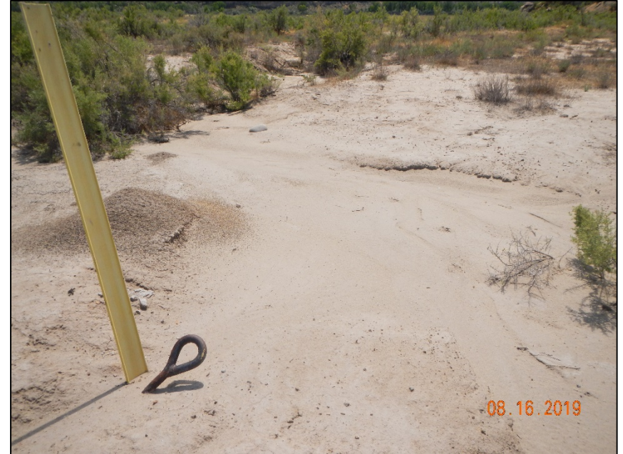
Photo #9 Photo at East side of location. Erosion sediment moving off location and choking out vegetation.