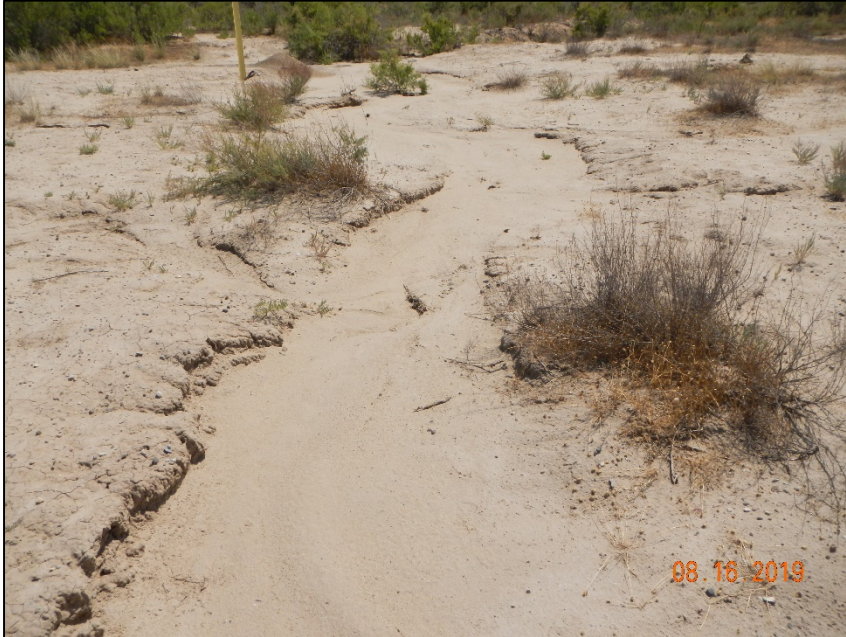
Photo #8. Photo at East side of location. Erosion sediment moving off location and choking out vegetation.