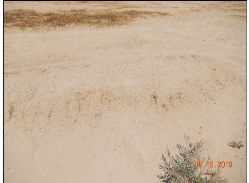
Photo #13. Photo from South side of location. Erosion sediment moving off location and choking out vegetation.