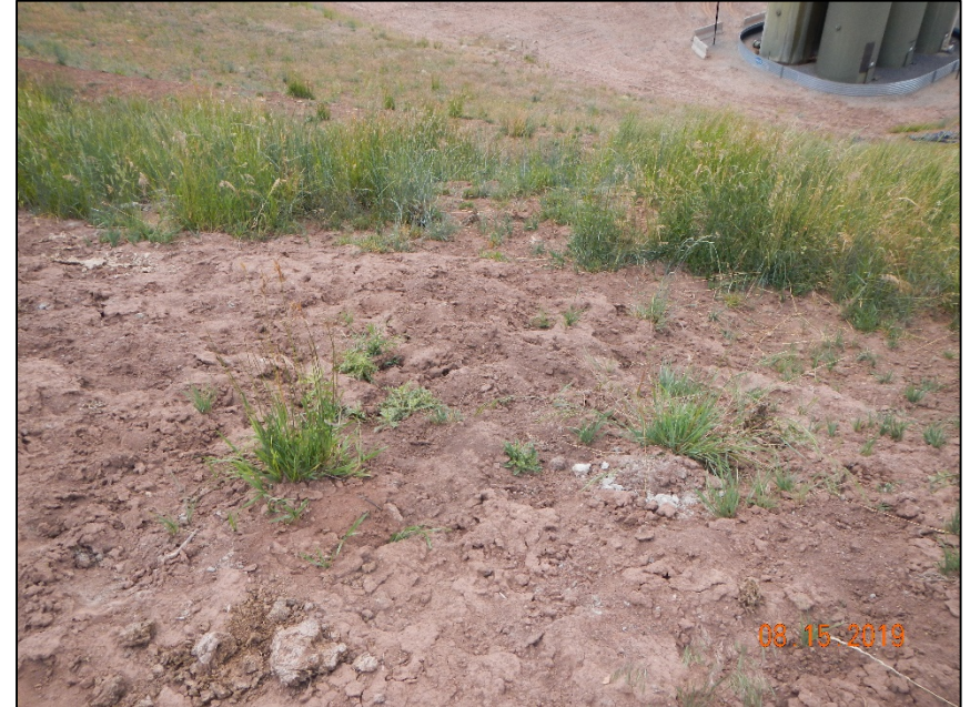
photo #29. South/East has become un-stabilized and erosion is moving soil down the hill. Vegetation is being choke out. BMP needs maintenance.