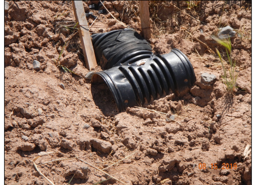
Photo# 19. Drain pipe is being used as a BMP and is in need of maintenance.