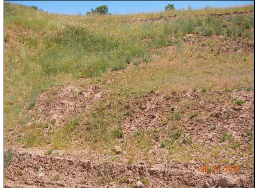
Photo# 15. Erosion is evident along un-stabilized slope on the South side of location. Erosion sediment moving off slope and choking out vegetation.