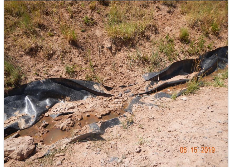
Photo# 21 Lined ditch on West the side of location, is being used as a BMP and is in need of maintenance.