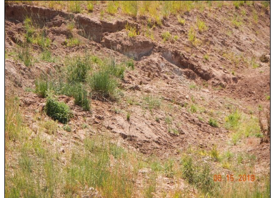
Photo #25. South/East has become un-stabilized and erosion is moving soil down the hill. Vegetation is being choke out. BMP needs maintenance.