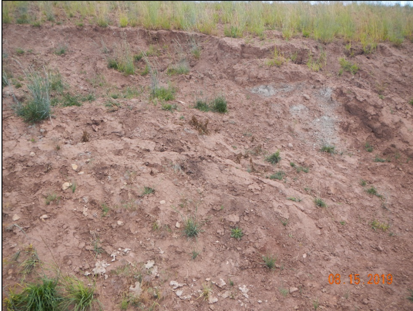
photo #28. South/East has become un-stabilized and erosion is moving soil down the hill. Vegetation is being choke out. BMP needs maintenance.