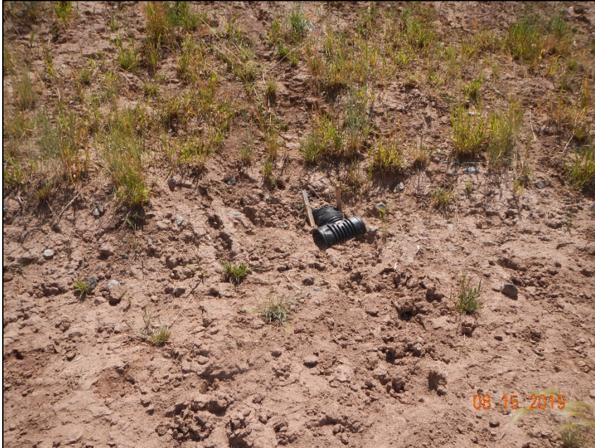
Photo# 18. Drain pipe is being used as a BMP and is in need of maintenance.