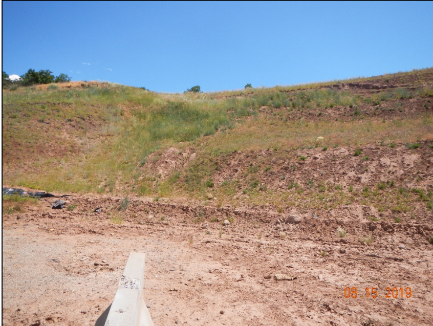
Photo# 14. Erosion is evident along un-stabilized slope on the South side of location. Erosion sediment moving off slope and choking out vegetation.