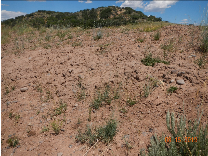
Photo #22. Erosion sediment is moving off un-stabilized berm on the west side of location below the berm, and is choking out vegetation