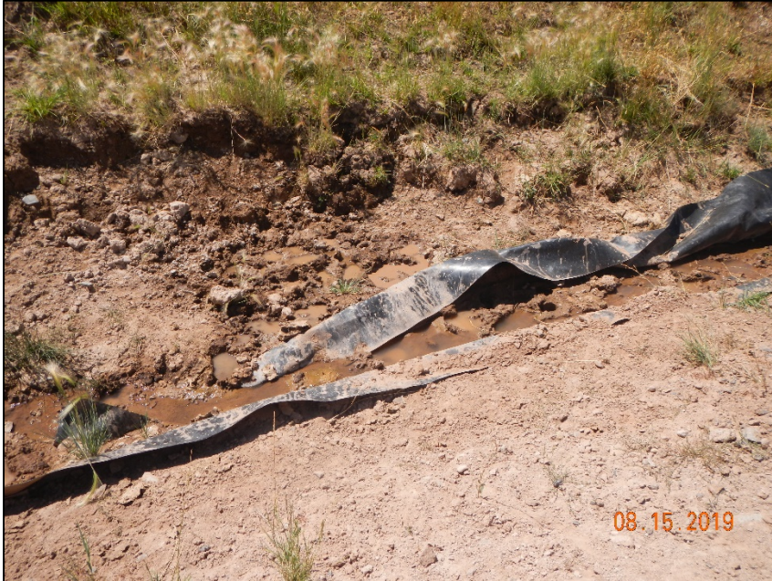
Photo# 20. Lined ditch on the West side of location, is being used as a BMP and is in need of maintenance.