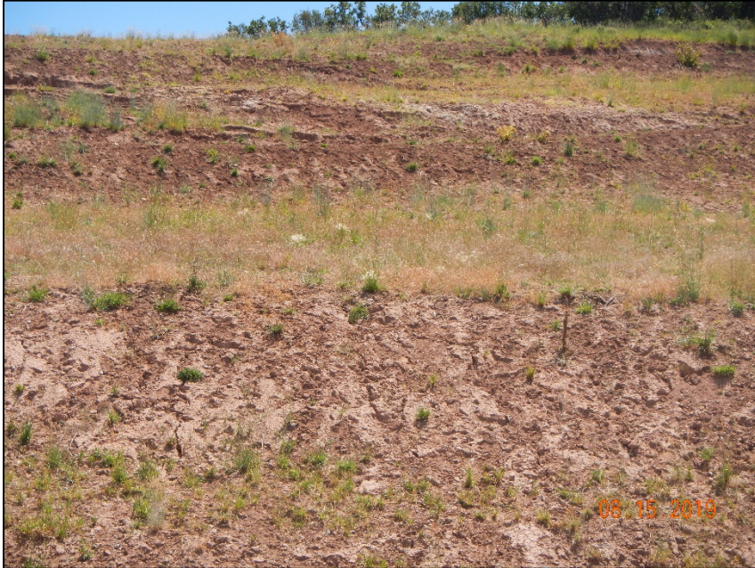
Photo# 16 Erosion is evident along un-stabilized slope on the South side of location. Erosion sediment moving off the slope and choking out vegetation.