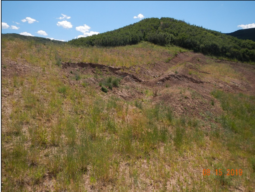
Photo #24. South/East has become un-stabilized and erosion is moving soil down the hill. Vegetation is being choke out. BMP needs maintenance.