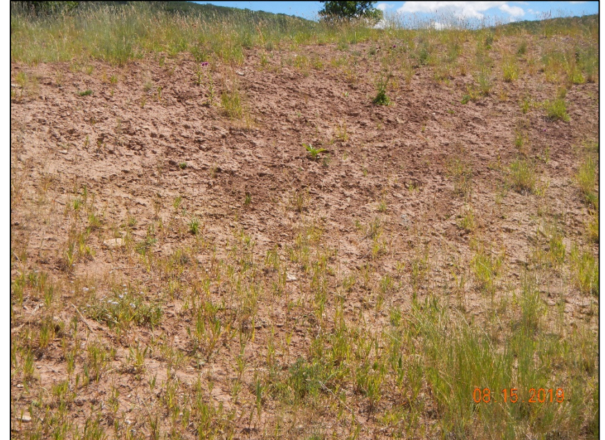
photo #27. On top of the South/East slope, erosion sediment is moving down the slope and is choking out sediment.