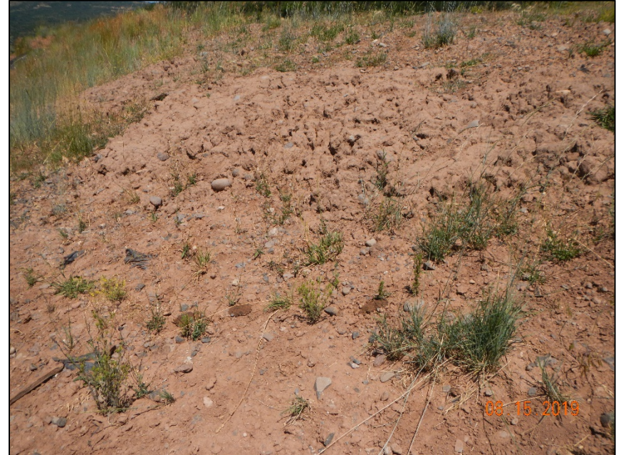
Photo #23. . Erosion sediment is moving off un-stabilized berm on the west side of location below the berm, and is choking out vegetation