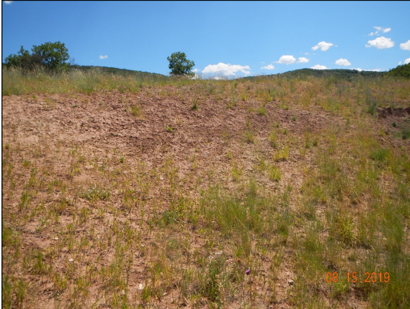
photo #26. On top of the South/East slope, erosion sediment is moving down the slope and is choking out sediment.