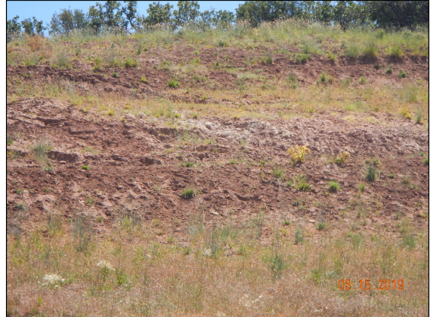
Photo# 17. Erosion is evident along un-stabilized slope on the South side of location. Erosion sediment moving off the slope and choking out vegetation.