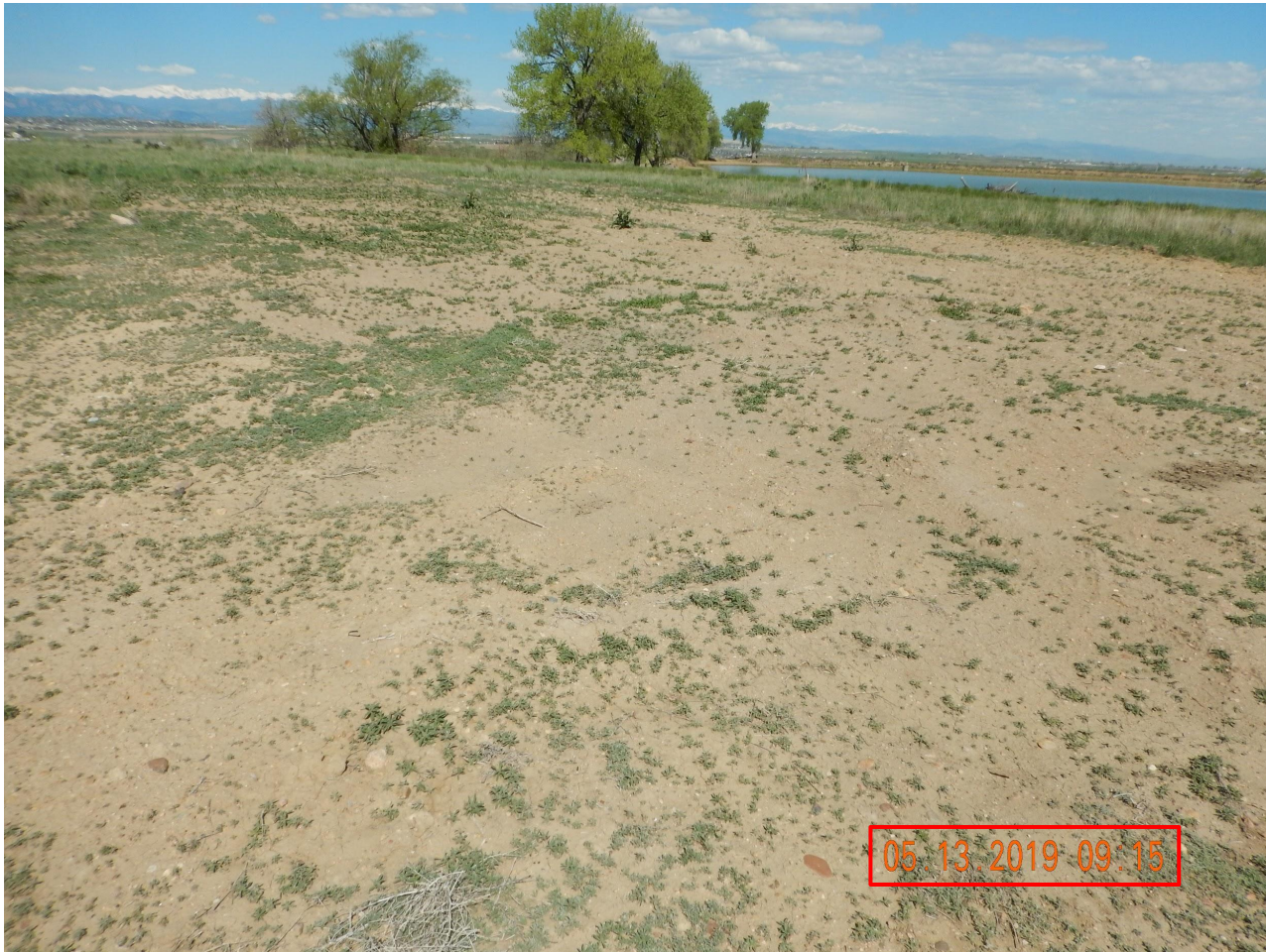
Photo 1. Photo taken on May 13, 2019 from the tank battery, facing Northwest. Photo illustrates Operator has not performed all Final Reclamation activities at the Location at the time of this inspection.