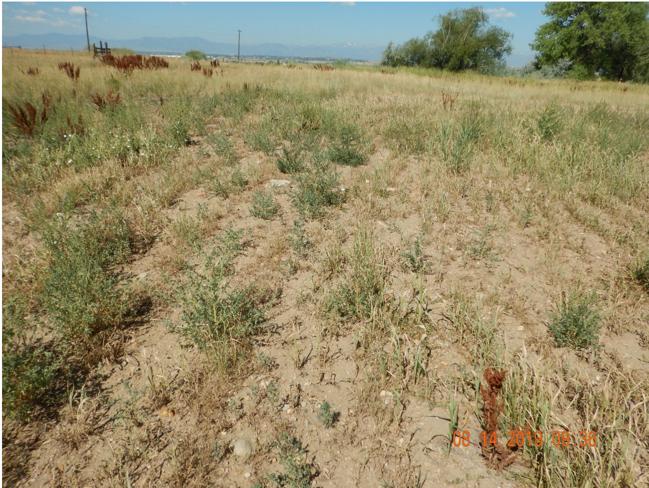
Photo 2. Photo taken on August 14, 2019 from the tank battery, facing West. Photo illustrates Operator has performed Final Reclamation activities but the location will remain in-process as it does not meet our vegetative standard and weed management is needed. Both undesirable and noxious weeds were observed.