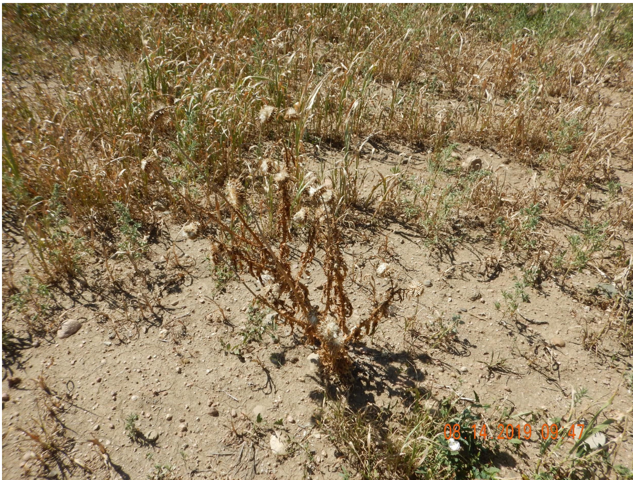
Photo 4. Photo taken on August 14, 2019 from the tank battery. Photo illustrates a List B Colorado noxious weed, Musk thistle.