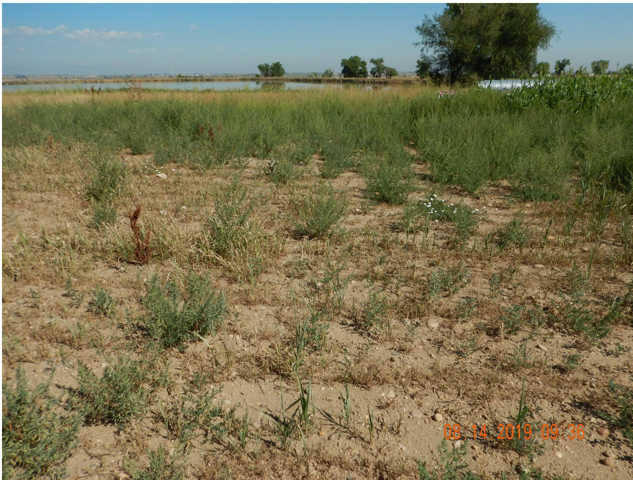
Photo 3. Photo taken on August 14, 2019 from the tank battery, facing North. See comments under Photo 2.