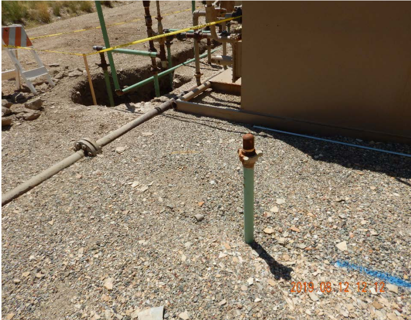
Photo #13 – Unused, unmarked 2" flowline riser north of separators.