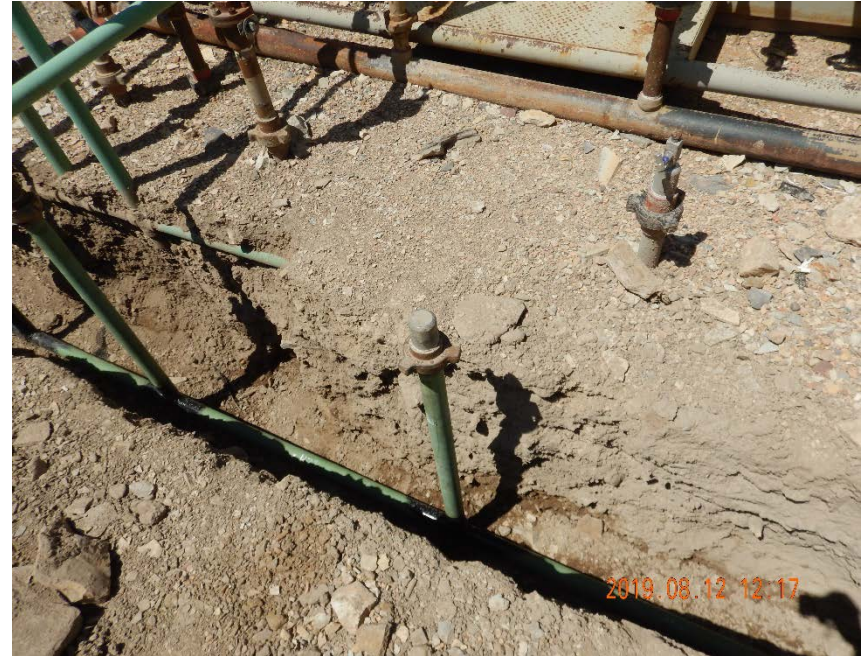
Photo #14 – Unused, unmarked 2" flowline riser east of separators.