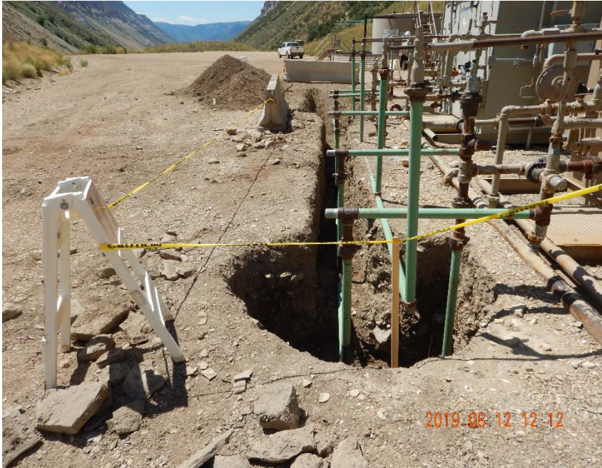
Photo #15 – Overview of open trench and excavation related to Spill/Release ID #466606.