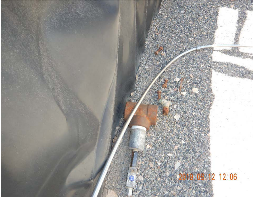
Photo #11 – Assorted metal equipment stored inside of lined tank battery area.