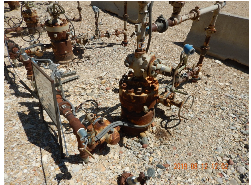
Photo #8 - Accumulation of oily waste beneath NP EF05D-19 L19 595 wellhead equipment.