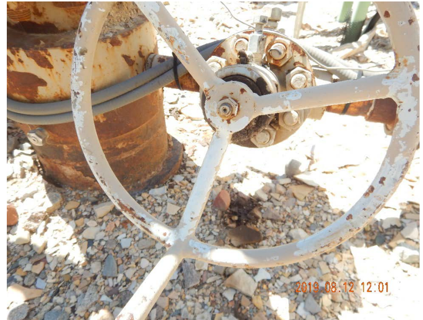
Photo #6 – Accumulation of oily waste beneath NP EF12B-19 L19 595 wellhead equipment.