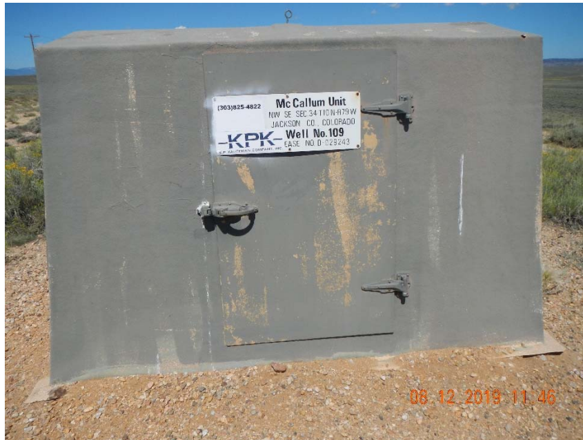
Photo 1. Location overview.