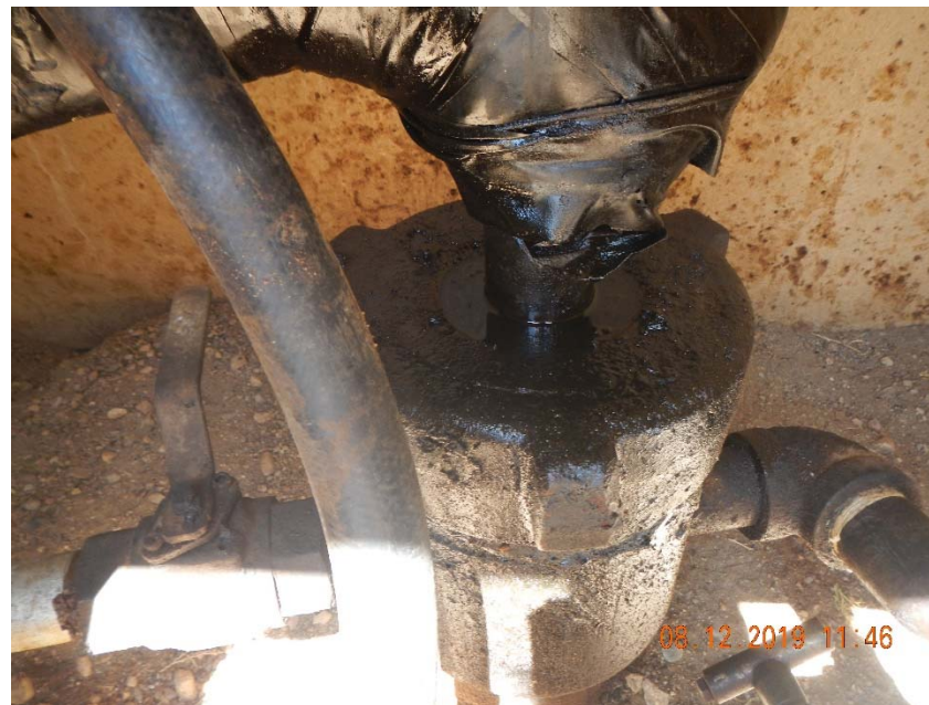
Photo 4. Mechanical conditions leading to stained soil.