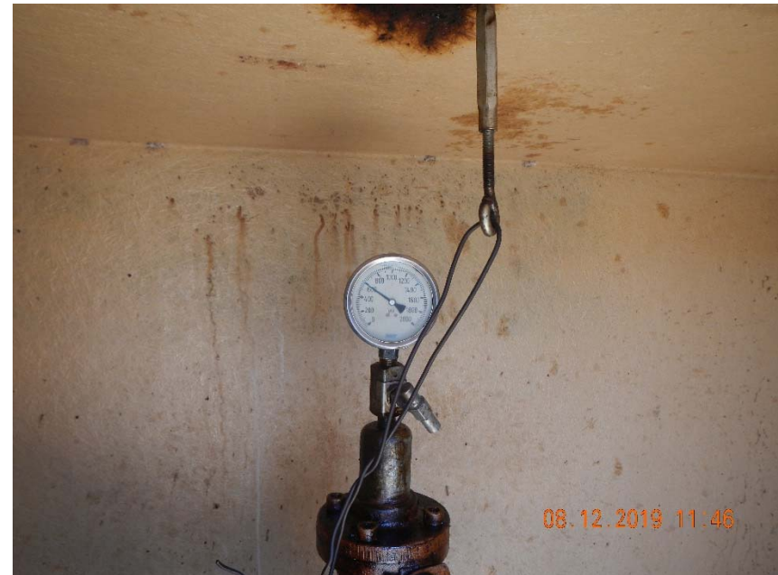
Photo 2. 600 psi on tubing at time of inspection.