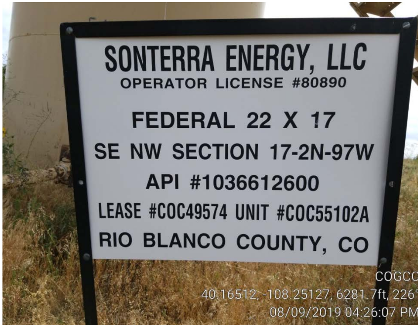
Photo 2. Battery sign.

Lloyd Federal 22X-17 API: 05-103-66126 Inspection: 679705050