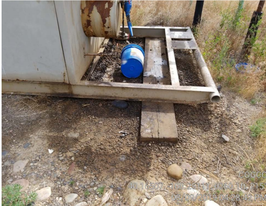
Photo 6. Stained soil at separator.