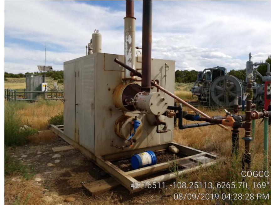
Photo 5. Separator.