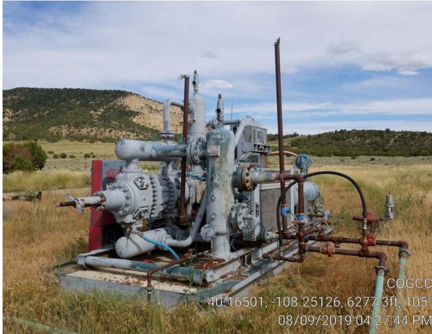
Photo 4. Compressor.