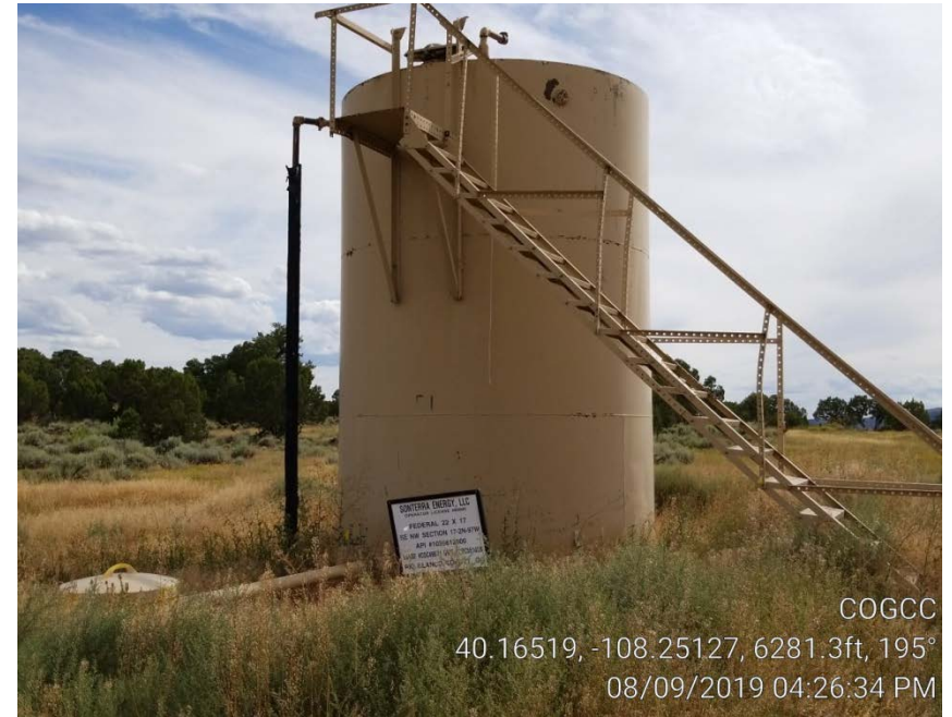
Photo 3. Tank.